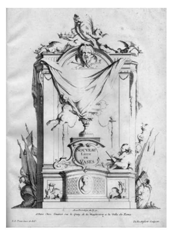
Fig. 6. De Rochefort after Jean-Bernard Toro, Nouveau Livre de Vases , titlepage, etching, 1716 (British Museum, London).