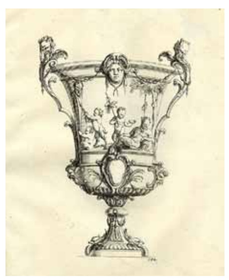
Fig. 7. Cochin after Jean-Bernard Toro, Design for a Vase, etching, 1716 (British Museum, London).