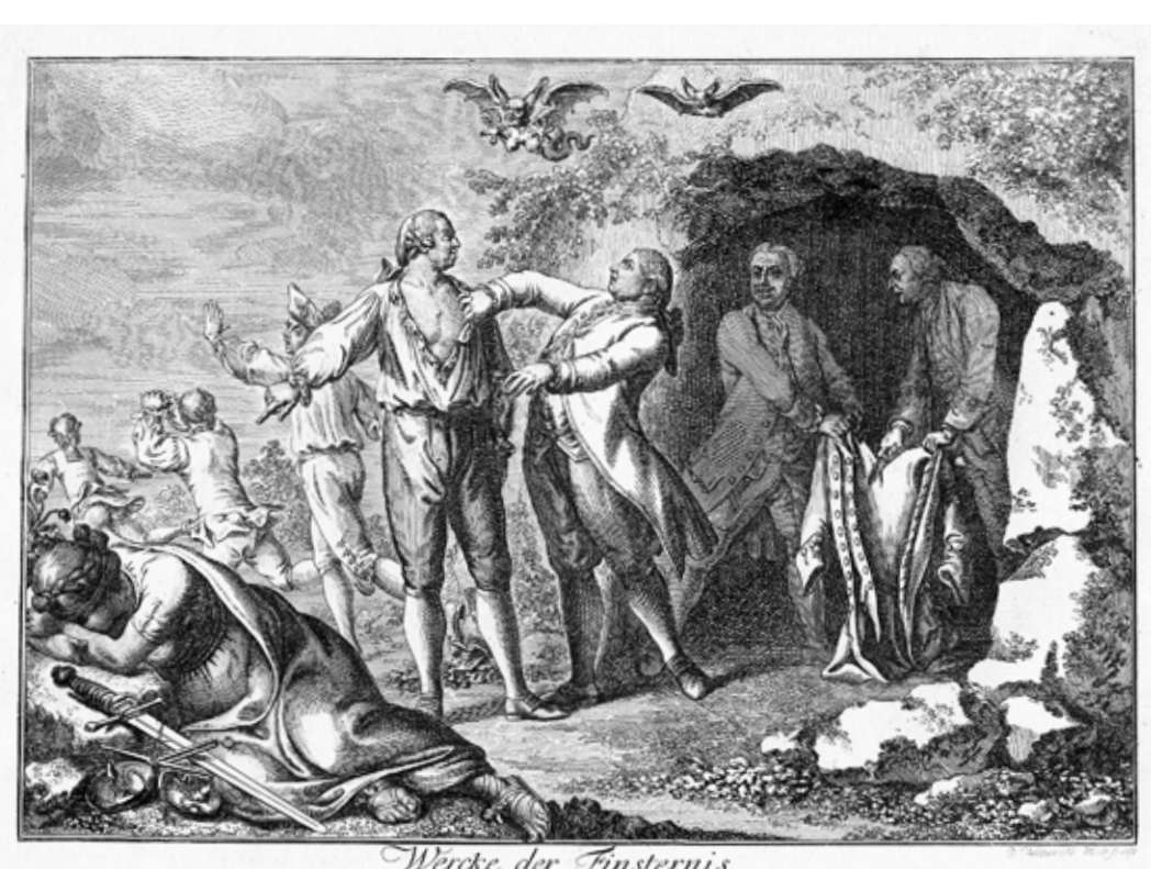
Wercke der Finsternis. Der Begtrag zur Genehichte des Buchhandels in Deutschland. Allegorisch vorgestellt zum besten, auch zur Warnung alter ehrliebenden Buchhandler. zu finden beg C.F. Rimburg in Berlin