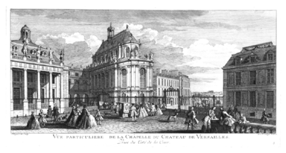
Fig. 5. Jacques Rigaud, View of the Chapel of the Château of Versailles, etching, 1728 (British Museum, London).