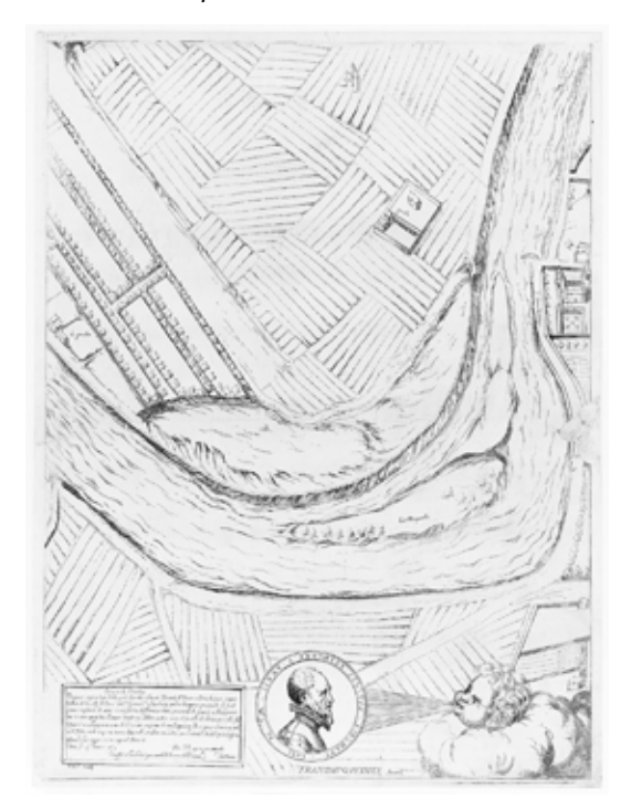
Fig. 2. Pierre Vallet after François Quesnel, Map of Paris, detail of the 'Extrait de Privilege', 1609.

monopoly was sought, assimilating the privilege to the thing, or rather the illusion of the thing, so that it begins to appear as an object framed by the law.