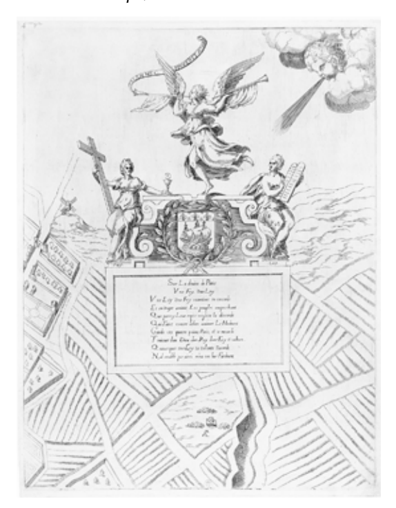
Fig. 4. Pierre Vallet after François Quesnel, Map of Paris, detail of Faith and Law, 1609 (Bibliothèque nationale de France, Paris).

pattern of significations suggests that the copy-privilege was designed to be read, and read, moreover, as a 'discours d'escort', analogously that is, to the other 'peritextual' elements:<sup>52</sup> the eulogy, the royal dedication, the ode to Faith and Law and the brief 'History of the Antiquity of Paris'. Recently, Nicolas Schapira and Claire Lévy-Lelouch have explored in two remarkable essays the competitive play of voices, identities and interests articulated