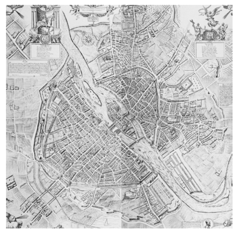
Fig. 1. Pierre Vallet after François Quesnel, Map of Paris, engraving, 1609 (Bibliothèque nationale de France, Paris).

the pages of the third volume of Félibien's Histoire , among the 'pièces justificatives', or historical proofs, where an abbreviated transcription is given of one of the earliest so-called privilèges in images, the 1608 copyprivilege for François Quesnel's Map of Paris (1609; figure 1),<sup>12</sup> granted