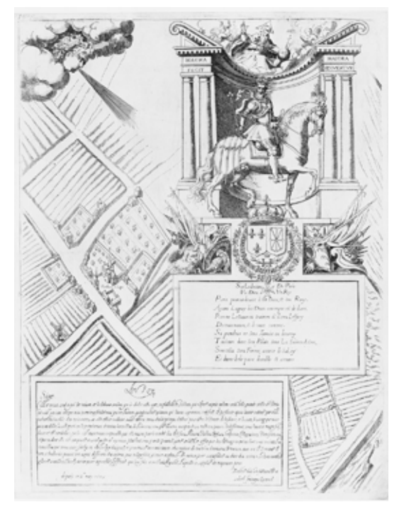
Fig. 3. Pierre Vallet after François Quesnel, Map of Paris, detail of Henri IV, 1609 (Bibliothèque nationale de France, Paris).

publisher.<sup>50</sup> Were it true that the inscription of privilege falls so absolutely outside the image, that it is both formally and discursively utterly detached from that which it serves to protect, it would seem ironically to lack force of visual persuasion precisely there where its existence is most publicly seen. In fact, the contours of the engraved lettering, the form of the text box and the shape and content of word and image collectively invite relations with the other inscriptions and decorations of the map: a liaison is yoked diagonally by the flow of the Seine between the portraits of the king (figure 3) and his author-subject, a triangle of identities is caught in the circles of the laurel wreathed coats of arms (royal and municipal) and the portrait medallion, finally, and more allusively, a connection is there to be made between the spirit of the Law above, and her tablets of sacred text (figure 4), and the fulfilment below of her practical reason in the extract of the privilege.<sup>51</sup> This