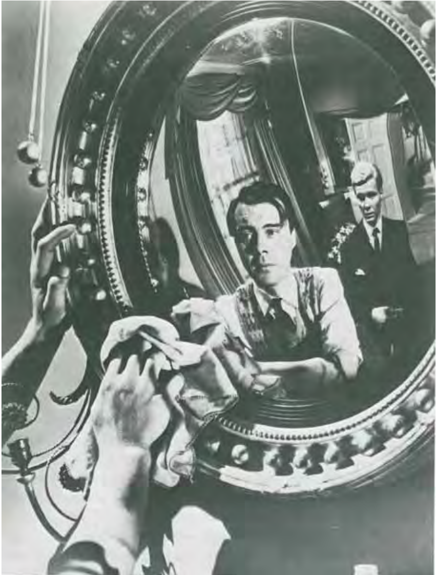
Servant and master (Dirk Bogarde, James Fox). The Servant

This allows him great flexibility. The Servant is both a critique of the British class system and an investigation of sexual manipulation and psychological cruelty that could exist independently of that system but are defined and clarified by it. The two couples, Tony, his lover Susan, Barratt, and Vera, stalk each other, reflect and deflect each other (quite literally, as