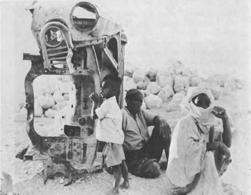
Above: the surreal landscape. Herzog's Fata Morgana (New Line Cinema Corporation)