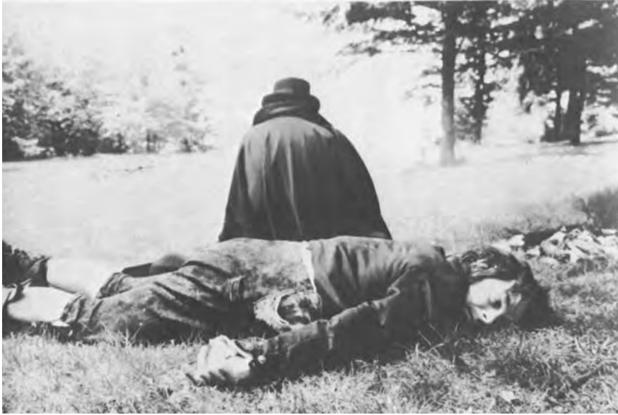
The Herzogian landscape. Every Man for Himself and God Against All.