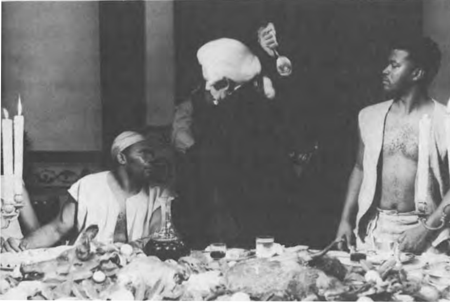
Master and slave. The Last Supper (Unifilm)