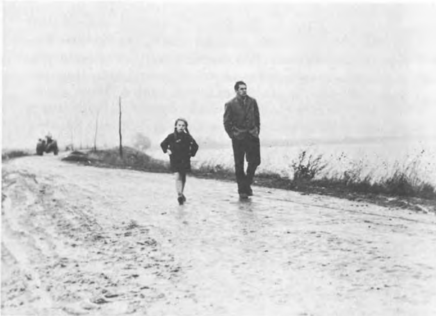
Aldo (Steve Cochran) and his daughter wander the flatlands of the Po.