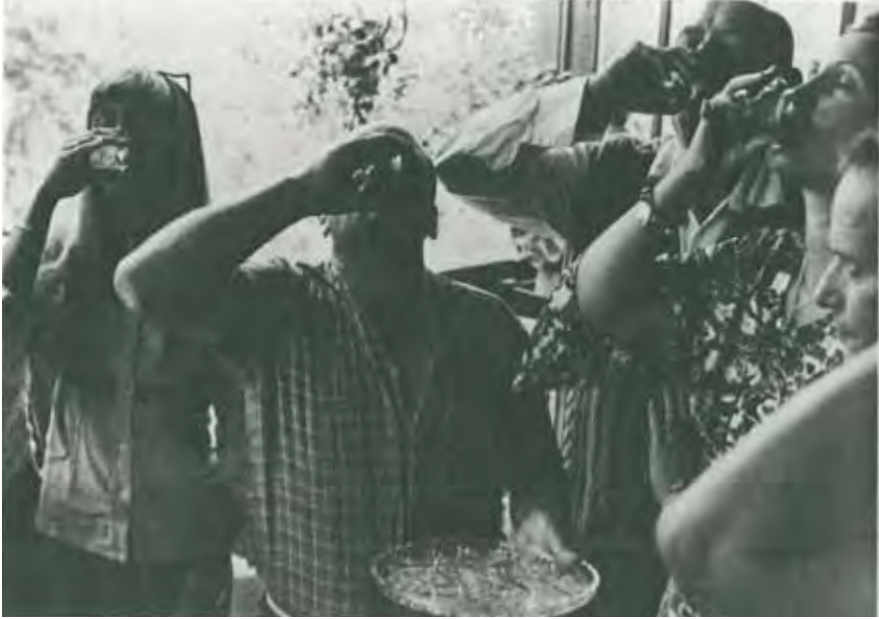
Family life. Rain and Shine

qualities of Jancsó's work, and are rather straightforward in narrative development and visual style. Both—indeed all of the recent Hungarian films I have seen—pay careful attention to their image-making, using color as a quiet and expressive function of the mise-en-scène . But these films do not use their mise-en-scène , as Jancsó does, to subordinate the conventional details of narrative development to the formal movements of figures and ideas. Rather they develop, in the traditional sense, a "story," though like Jancsó, a story that comes out of political history and reflects its agonies.