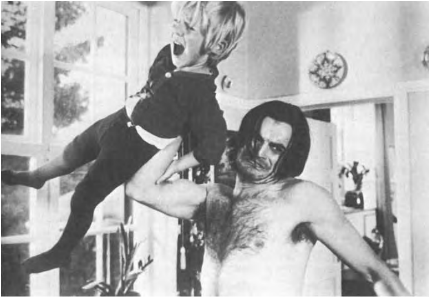
Domestic upheaval. La Rupture

by the blackmailer (who then kills the wife's husband)—when such an increment of absurdities occurs, melodrama reveals its other face, which is parody, of itself and of our acceptance of such absurdities. Because Chabrol details each element with equal care and gazes upon the characters with a visual embrace that zooms, tracks, exchanges points of view, and defines each character, everything and everyone takes on moment and portent. Quite unlike Godard, and the early Truffaut, Chabrol does not attenuate his narrative, nor does he accumulate material in a linear fashion, as does Rivette. Rather he builds out each sequence with sufficient dramatic detail and a more than sufficient attention to spatial relationships among the characters. Within these dynamics, exaggerated just beyond the necessities of convention, melodrama turns on itself and the ludicrous is visible within the serious.