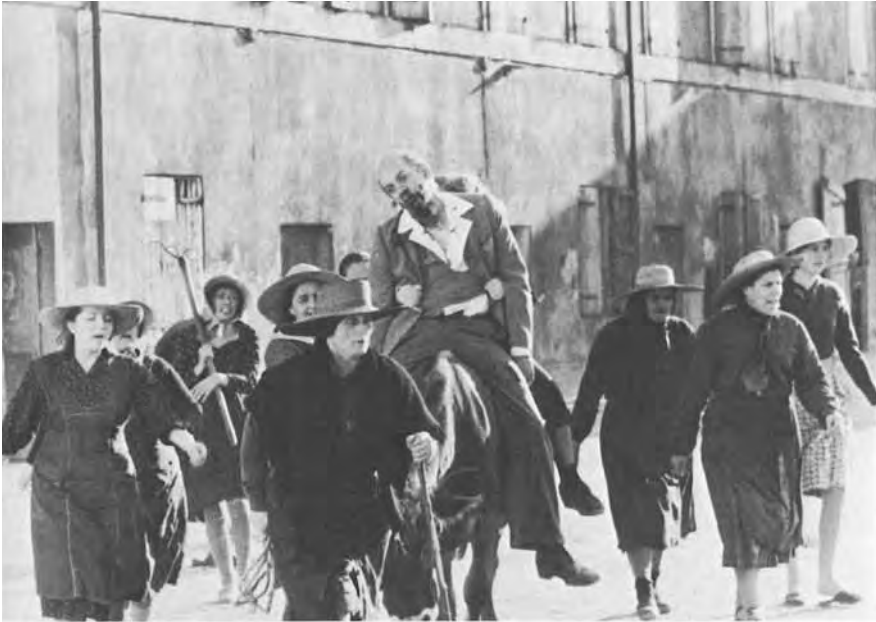
The peasants' revenge against Attila (Donald Sutherland). 1900

enemies; Alfredo's wife, who perceives more clearly than her husband the threat of the fascists, whom he attempts to placate, even at the risk of Olmo's life; and Attila, the local fascist leader.