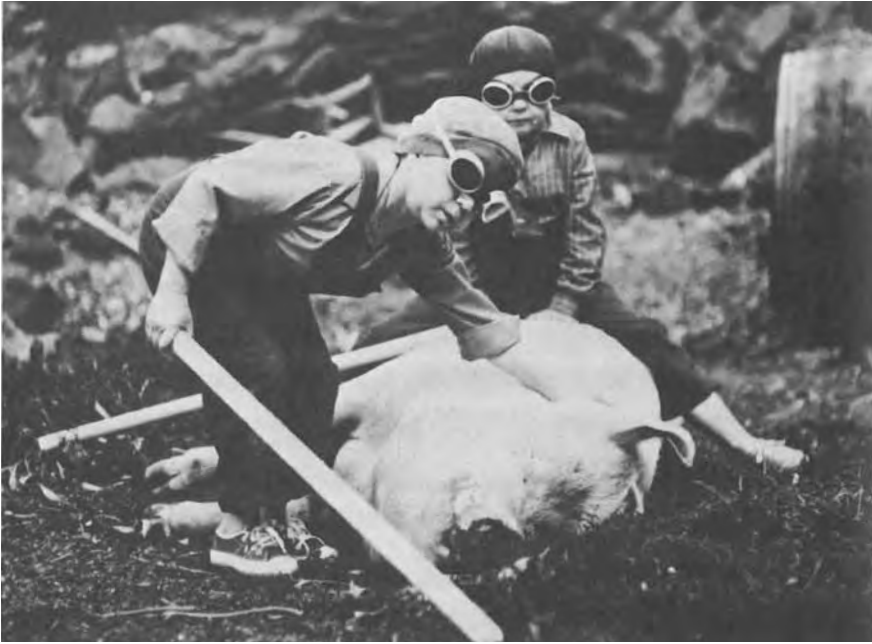
Even Dwarfs Started Small (New Line Cinema Corporation).

lens. The figure becomes one object among the others, contemplated and unexplained. When he photographs the Europeans who live in the region, the sense of disconnection is even more startling. A German holds up a lizard and gives a lecture on the desert heat; another dives for tortoises in a pool. At the beginning of the "Golden Age" section the camera stares at a man and woman sitting at a piano and drums, singing terrible Spanish pop songs, on what appears to be the stage of some wretched ballroom. (The man wears a pair of goggles similar to those worn by some of the dwarfs in Even Dwarfs Started Small .) Meanwhile the commentary has broken down into perfect dada nonsense: "In the Golden Age man and wife live in harmony. Now, for example, they appear before the lens of the camera. Death in their eyes. A smile on their faces [the couple we see are not smiling]. A finger in the pie. . . ."