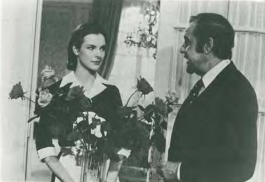
Mathieu (Fernando Rey) and one incarnation of his Conchita (Carole Bouquet). That Obscure Object of Desire (Films Incorporated)

a woman who will not be a passive object, and the history of film is filled with her presence. Such a figure is (within the logic of misogyny) worthy of the wronged man's revenge and may be physically hurt for the emotional hurt she causes. In this film, it is, happily, not so simple. Throughout their story, Mathieu and his Conchita(s) play their roles of lecherous old man and reluctant virgin knowingly, willingly, and with some delight (it is with great delight that Mathieu tells his story to his traveling companions, who listen eagerly). The sexual terrorism they enact upon each other is not as vicious as that committed by Elvira upon herself in In a Year of Thirteen Moons or by Paul and Jeanne upon each other in Last Tango in Paris . Mathieu and Conchita keep seeking each other out, chasing each other away, returning, meeting by accident and by design (accident and design are often interchangeable in Buñuel's work). Around them their games are echoed by acts of the political terrorists, who create a general havoc paralleling the individual havoc created by the two (three) would-be/reluctant lovers.