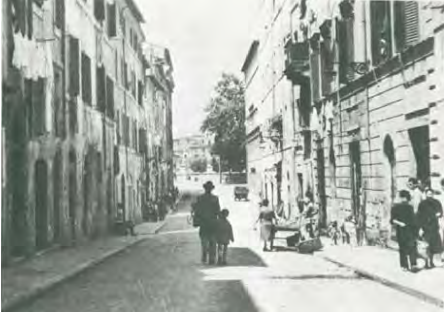
Ricci and Bruno walk the streets. Bicycle Thieves

This careful neutrality is not present throughout the film, and De Sica does play upon expectations when, for example, Ricci and his tattle son Bruno search for the stolen bicycle in the marketplace. Anxiety is created when Ricci—and we—think Bruno may have drowned, and when father and son discover the thief and are surrounded by the people in his neighborhood. De Sica even indulges in a commentative montage. During their search, Ricci and Bruno stop at a restaurant. As Bruno eats his meager pizza he looks over his shoulder at the rich family at another table, and De