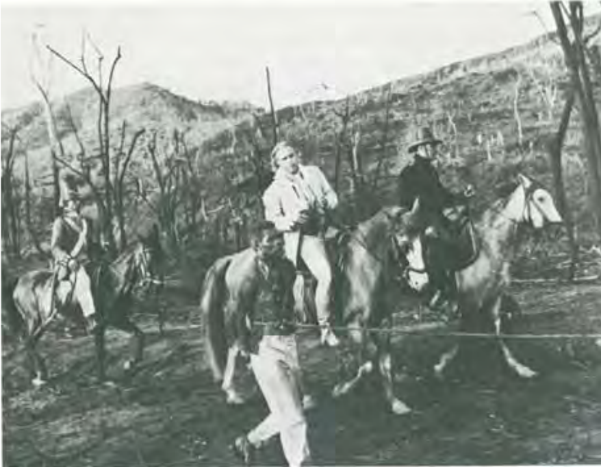
Sir William Walker (Marlon Brando) leads on a rope the insurgent he once supported. Burn! (United Artists)

appearance, attitude, and social position to the man he had originally made rebel leader and then had executed. As he turns to greet this figure, the man stabs him to death. Pontecorvo thus indicates that the revolutionary spirit, once created, outstrips individuals and becomes not part of nature, but of the culture. The man who first formed and then betrayed it is destroyed by one of its representatives, who comes to stand for this man's own bad conscience and the country's revenge.