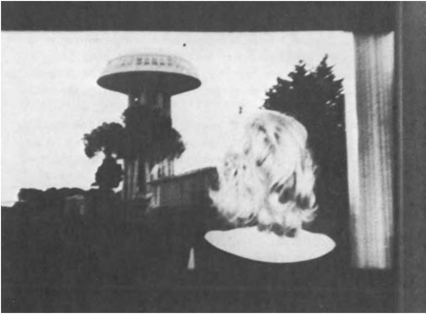
Monica Vitti at a window. The figure dominated by urban structures. L'eclisse (frame enlargement)