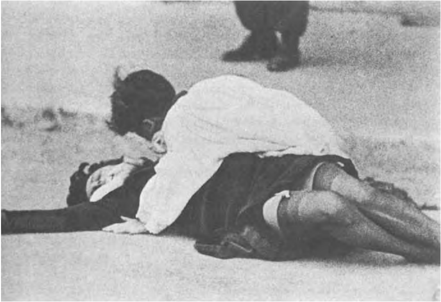
The death of Pina (Anna Magnani). Rome, Open City

so much reflect as contain and surround the desolation of the characters. They are their surroundings: poor, ruined, and seemingly without hope. But always enduring. The suicide of the young boy, Edmund, in Germany, Year Zero is an unusual act for a neorealist character, mitigated by the fact that Edmund comes to stand for Germany and the destruction it brought upon itself. In Rome, Open City , the deaths of Pina, Manfredi, and Don Pietro at the hands of the Germans are a sign of affirmation. Their humanity is transferred, within the film, to the children who carry on their struggle, and, outside the film, to the audience, whose understanding of their struggle validates it and their deaths.