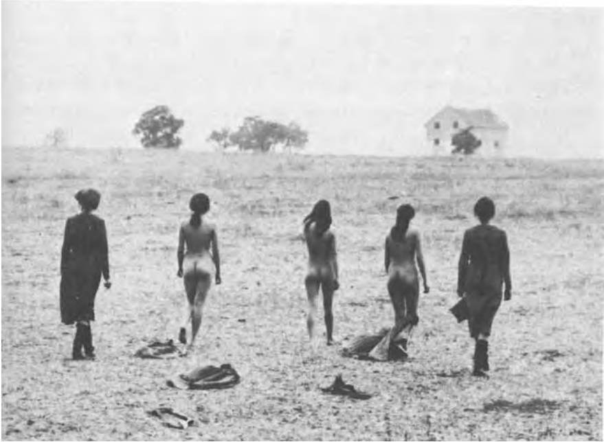
The Three Graces on the Hungarian plain. Red Psalm

workers . . . The man in the leather jacket says to the old man, "I don't wish to offend you, but you can't even read." The old man has obviously been reading! Something odd begins to happen: the man in the leather jacket attempts to continue, but begins rolling over on his side. "Shouldn't people be educated and rights given later . . . ?" he asks, halting, rolling over completely, and finally dying. This may be the first time in film that a character dies from the internal violence of his own oppressive ideas. If the clichés of capitalism are deadening and destructive, there is no imaginative reason why their destructiveness cannot affect one who generates them. In a film that depends on presenting an abstract concentration of history in which events are foreshortened and there is a desire to draw socialist ideas out of the myths of the peasantry and their closeness to the cycles of nature, the events of the film may take on mythic, even magic proportions themselves.