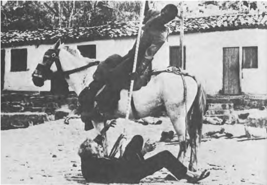
St. George slays the dragon.

Antonio das Mortes