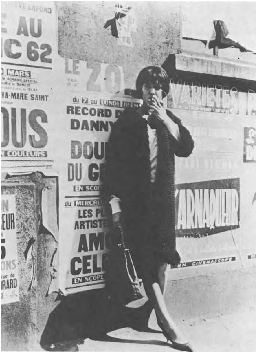
This page and next: the signs of work. Anna Karina in My Life to Live