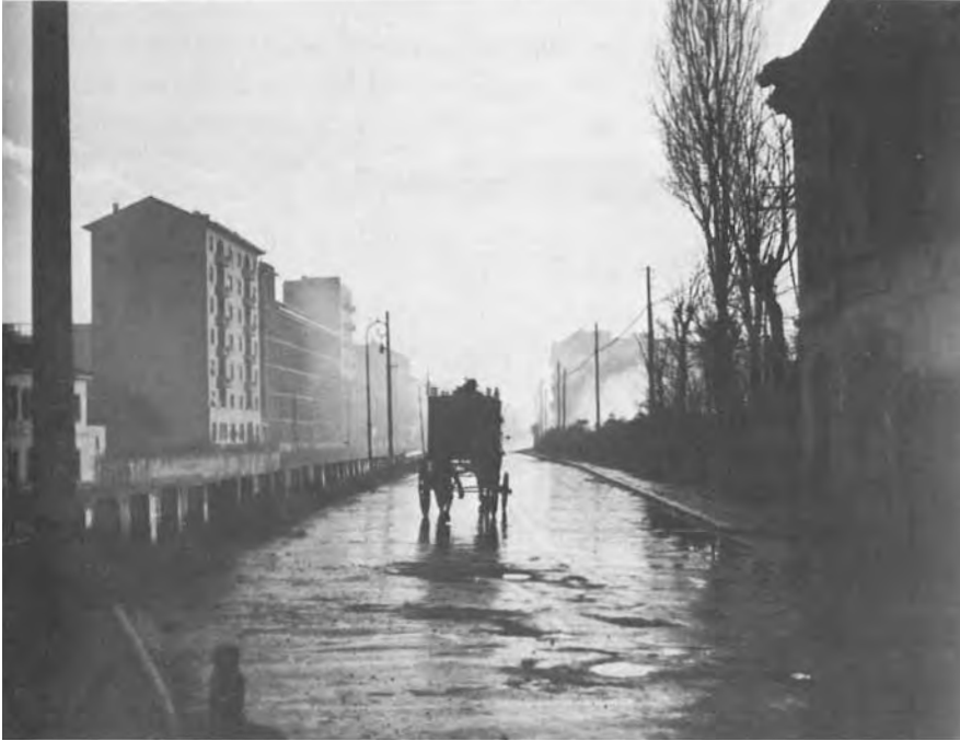
Gray buildings and streets. An anticipation of Antonioni's visual style in an early sequence of De Sica's Miracle in Milan

become repetitive or—in the case of Miracle in Milan —silly; its form and content simply used each other up, and the filmmakers wanted to go on to other things. Finally, too, the state had its word and censored what was left of the movement. In the late forties, the audience for Italian film was excellent abroad, but poor at home. The movement came under political attack—by the left for not providing a strong enough model for analysis and change, by the right for being too left, and by the center coalition government in power for keeping away Italian audiences and portraying Italy in a bad light abroad. The government won. Italy joined NATO and, as a recipient of aid from the Marshall Plan, was enjoined to control and if possible do away with any activity that might be taken for left-wing. In 1949 the Christian Democrats placed Giulio Andreotti in charge of the film industry with powers to subsidize only those films that were “suitable.. to the best interests of Italy.” Statements made by government ministers at the time indicate the direction being taken— the direction indicated in Miracle in Milan —toward a cinema of passivity and pacification: