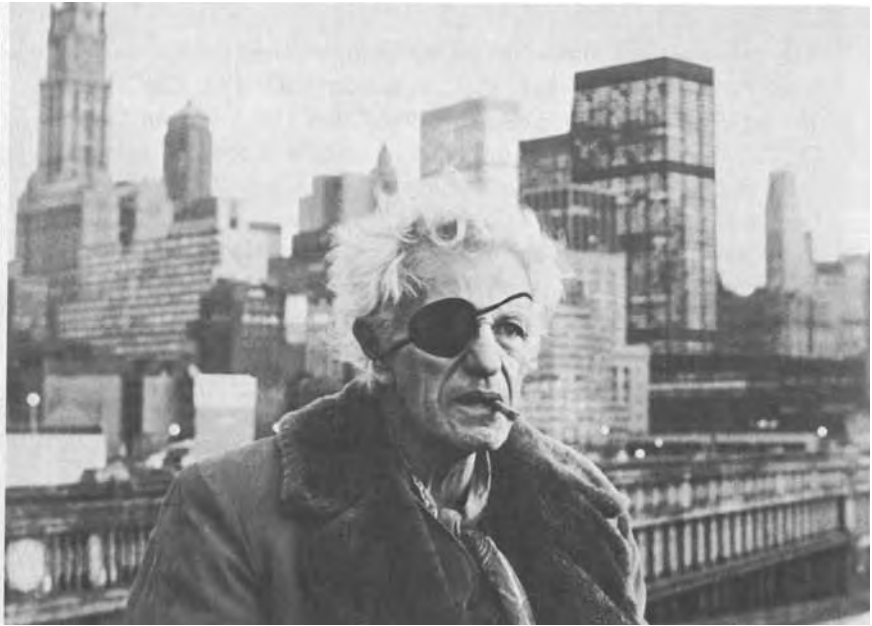
A meeting of cultures, a meeting of cinemas. Nicholas Ray ( above); Bruno Ganz and Dennis Hopper ( below) in The American Friend