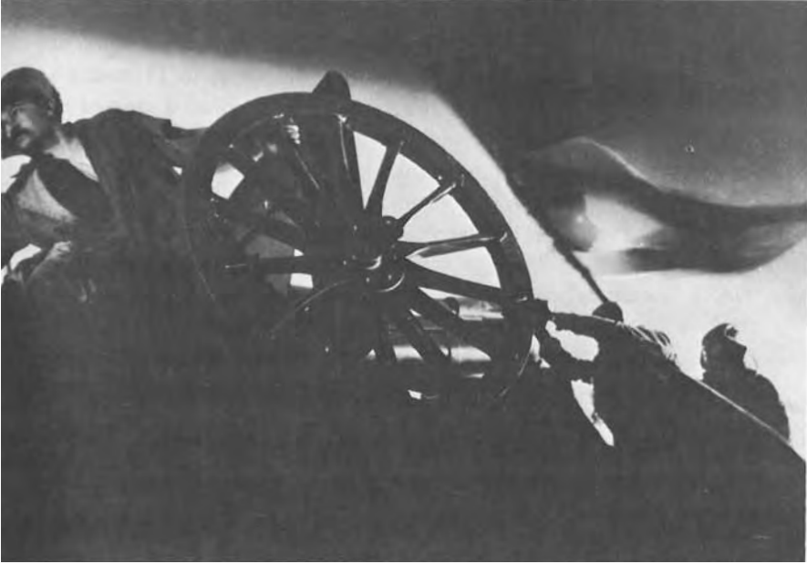
The Eisenstein image

New Wave filmmakers. When the German cinema was revitalized in the seventies, expressionism became more than an influence; it emerged as a problematic. Werner Herzog struggled with it, going so far as to remake Murnau's Nosferatu , imitating some of it and simultaneously removing many of its essential elements. Rainer Werner Fassbinder understood the expressionist urge. He never copied the style, but knew its intent, and created a mise-en-scène of observed entrapment that is in the expressionist tradition. However, Fassbinder, like his contemporary Wim Wenders, may have gotten his expressionist tendencies as much from American film noir as from his own cinematic tradition.