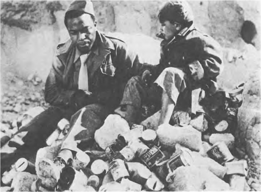
“Joe” and the little boy on the rubble heap. Paisan

the white puppet. The boy leads him away through the ruined streets to a rubble heap where the two sit. The soldier plays a harmonica and talks of his fantasy of a hero's welcome in New York, realizes it is a fantasy, and says he does not want to go home. He falls asleep, and the sequence ends in a manner typical of Rossellini's approach through the film. The little boy shakes him, tells him rather matter-of-factly, "If you go to sleep, I'll steal your shoes." The soldier sleeps. The image fades to black. 33