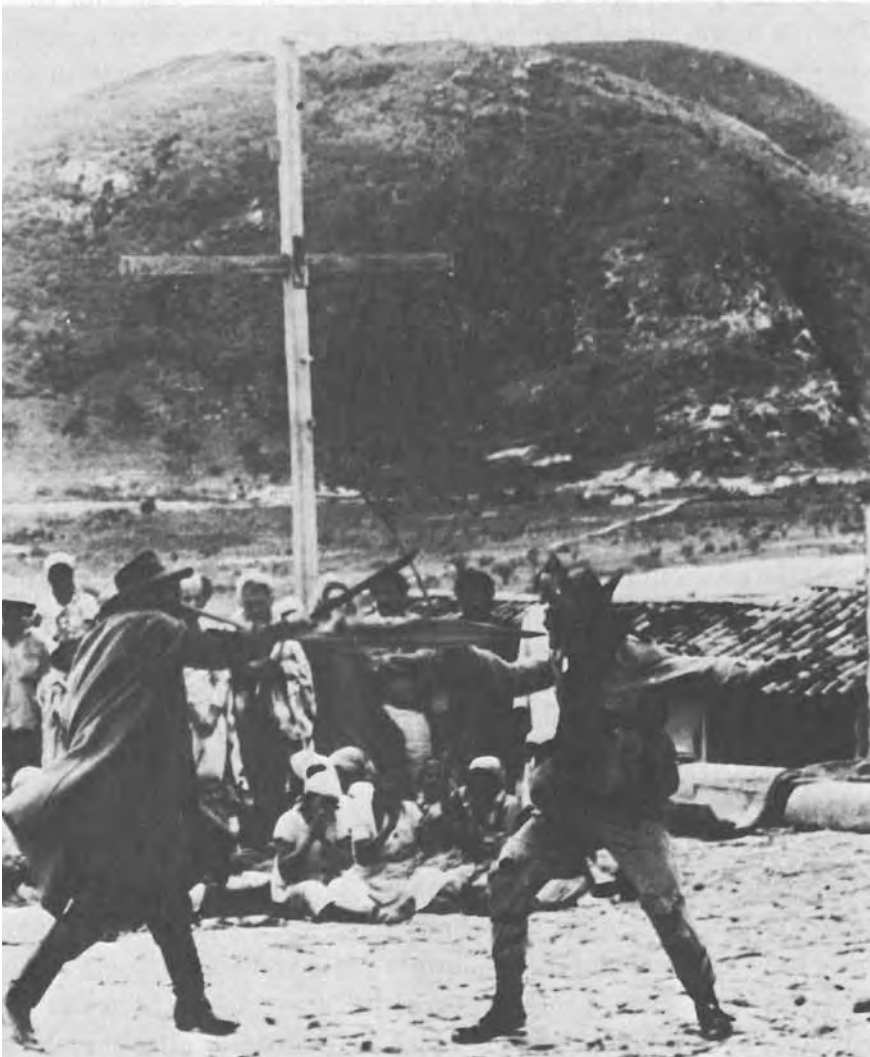
The fight between Antonio and Coirana. Antonio Das Mortes

film continually challenges the viewer to go through precisely the kind of integrations his characters face, to place the fragments of expression in an order that leads to understanding.