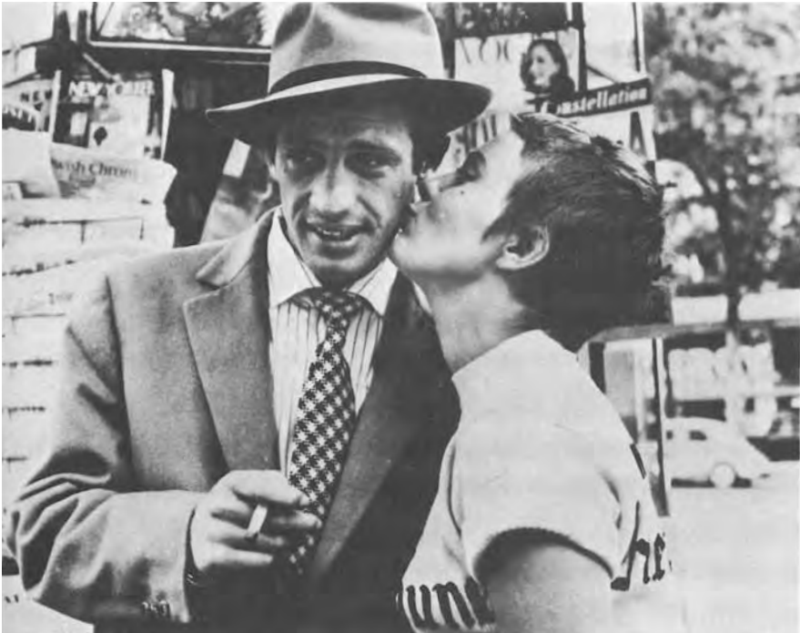
The Godardian gangster (Jean-Paul Belmondo with Jean Seberg). Breathless

look at film in general, an active engagement between film and viewer is maintained that comes from a forthright wish to please. In Truffaut's films, for example, the influence of Renoir manifests itself in an enveloping care for all the characters and the audience's attitude toward them. In the films of Claude Chabrol the pleasure is derived from the exercise of a delighted malignity. He is perhaps formally the most conventional of his colleagues, somewhat less concerned with restructuring narrative means than with narrative ends. In the best of his work he entertains Hitchcockian concerns for the violence that erupts in the most unsuspecting and unprepared of bourgeois circumstances. Chabrol is not concerned with the gangster side of the Hollywood thriller, as is Godard in Breathless and Truffaut in Shoot the Piano Player , nor is he much interested in the Parisian subculture, at least not after Les cousins and Les bonnes femmes . More than the others, Chabrol's eye is on the propertied bourgeoisie of the provinces or the Parisian suburbs, a class he is able to delineate by their gestures, clothing, and surroundings, by the visual design of their world. Chabrol has the finest eye for production design of any of his peers. While Godard has the best eye for cultural design, for abstracting the sign (in a literal and figurative sense) that sums up a social or political attitude, Chabrol can surround his