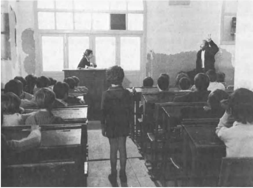
The father takes Gavino out of school. Padre padrone

supply the subjective response to what they hoped would be an objective rendering of character and events, the Tavianis rework this methodology—in light of the thirty years of narrative experimentation that separates Padre padrone from the neorealist tradition—into a complex of subjective, sometimes almost expressionist, inquiry into states of mind, first- and third-person commentary on events, and subdued objective observation of the world inhabited by their characters.