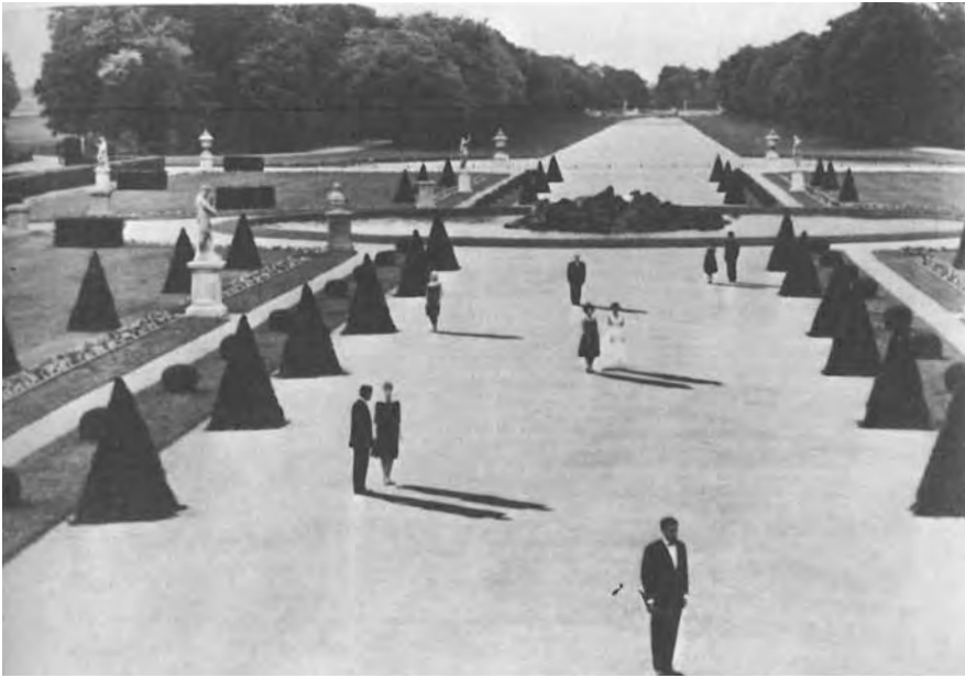
The static cinematic memory, with and without shadows. Last Year at Marienbad