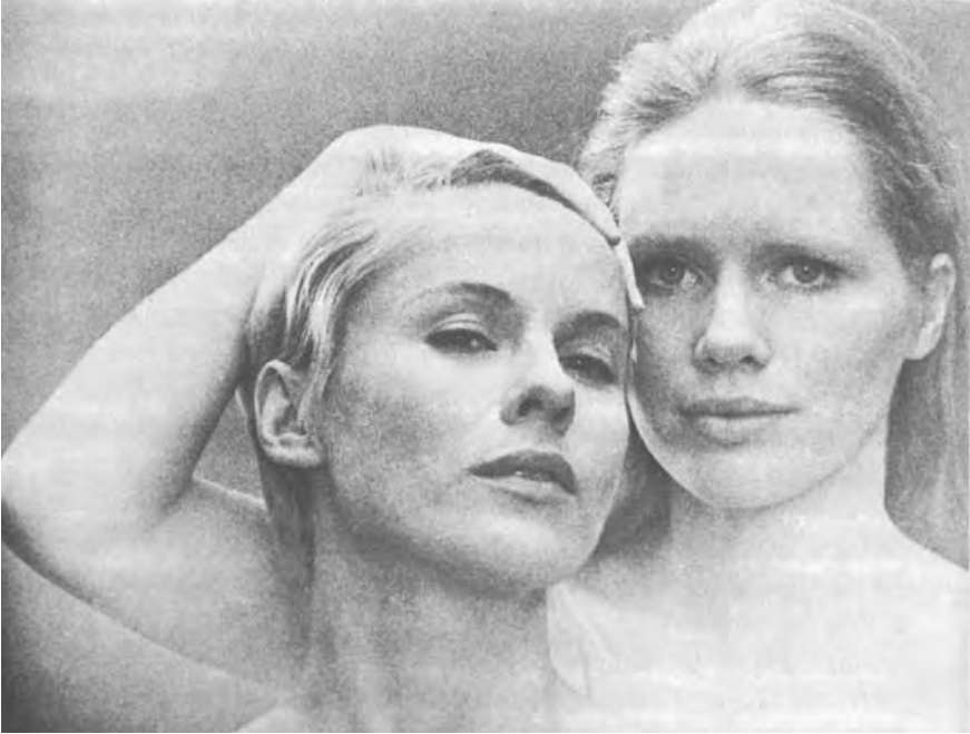
The famous Bergman two shot from Persona (above: Bibi Andersson, Liv Ullmann), and (below) one by Fassbinder from The Bitter Tears of Petra von Kant