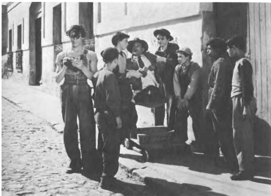
The perversity of the Buñuelian world. Los Olvidados