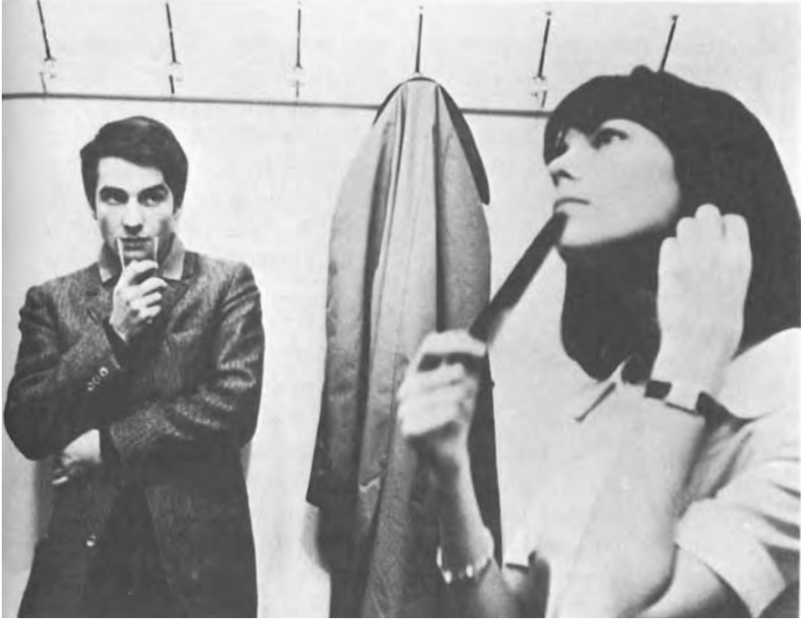
Paul and Madeleine (Jean-Pierre Léaud, Chantal Goya). Masculin-féminin

insight. Godard titles the sequence “Dialogue with a Consumer Product,” and ends it with the sound of a ringing cash register.