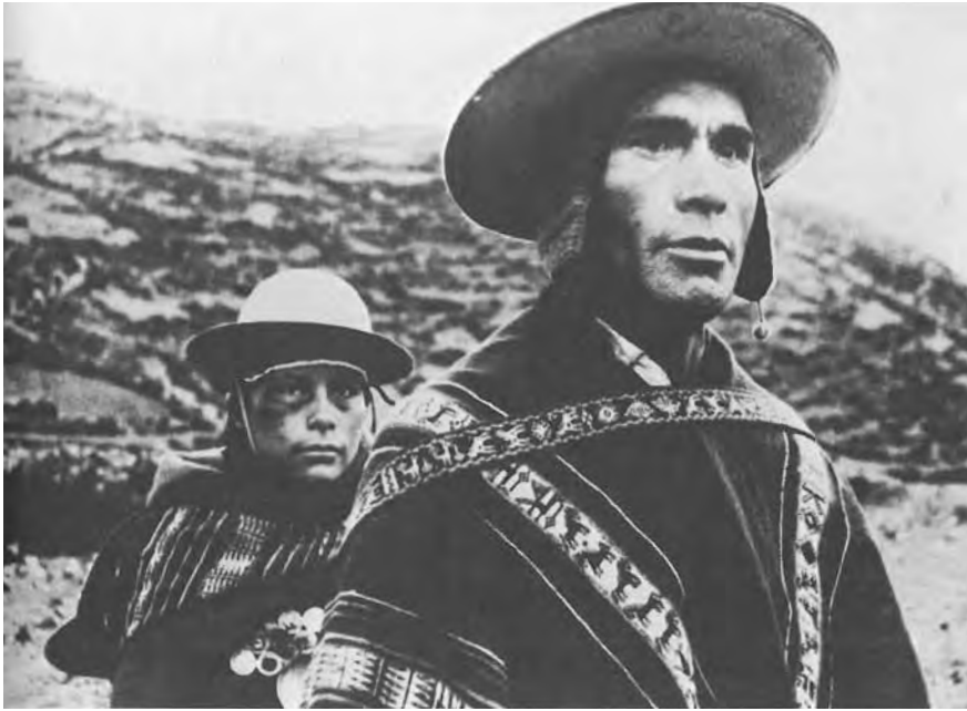
The Bolivian Indians. Blood of the Condor (Unifilm)

these works, like Hour of the Furnaces , are documentary in nature, though with specific left-wing social and political perspectives. Some, like Jorge Sanjinés's Bolivian film Blood of the Condor (1969), document a terrifying oppression in the form of narrative fiction—a form, in this case, close to neorealism.