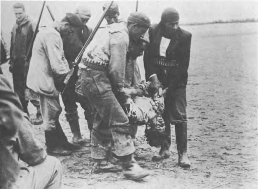
A chronicle of war's terrors. Paisan

of humility, simplicity, and pure faith...." 34 Sanctimoniousness is replaced by understanding, conflict by acceptance, and embellishment is foregone.