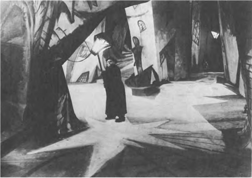
The expressionist image. The Cabinet of Dr. Caligari