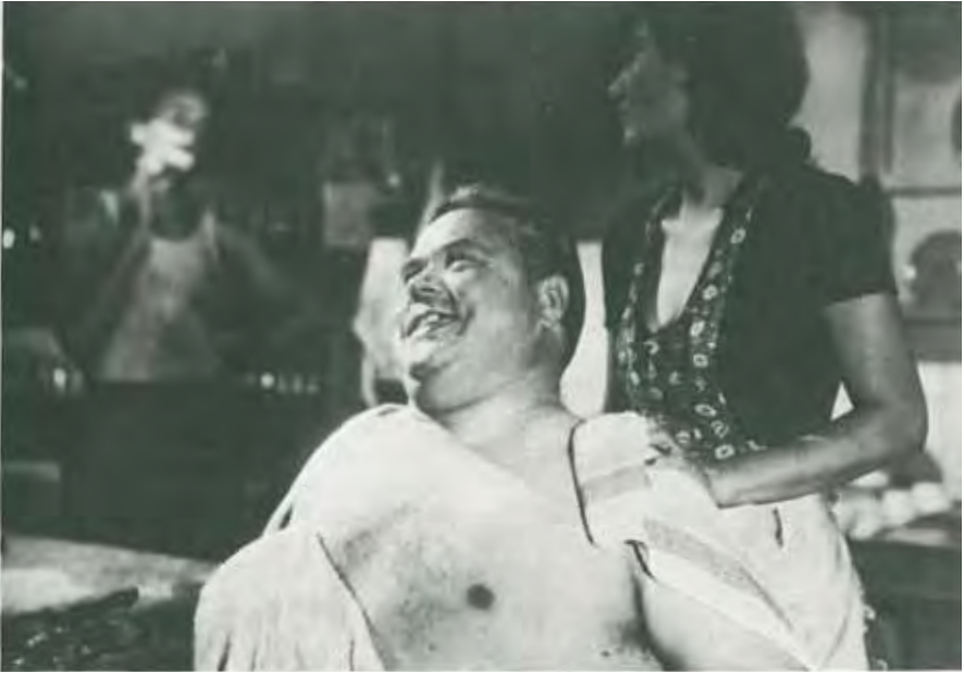
An aroma of sweat and lust. Osessione

familiarity. It was a tradition of cinema that asked little of the spectator besides assent and a willingness to be engaged by simple repetitions of basic themes, a tradition that located the spectator in fantasies that had the reality of convention.