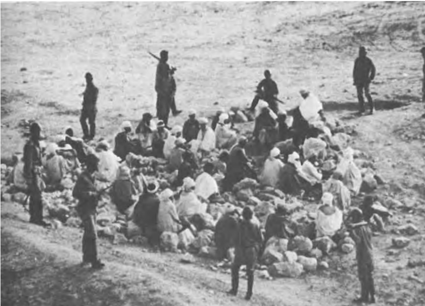
Below: the political landscape. Bertucelli's Ramparts of Clay (Cinema 5)