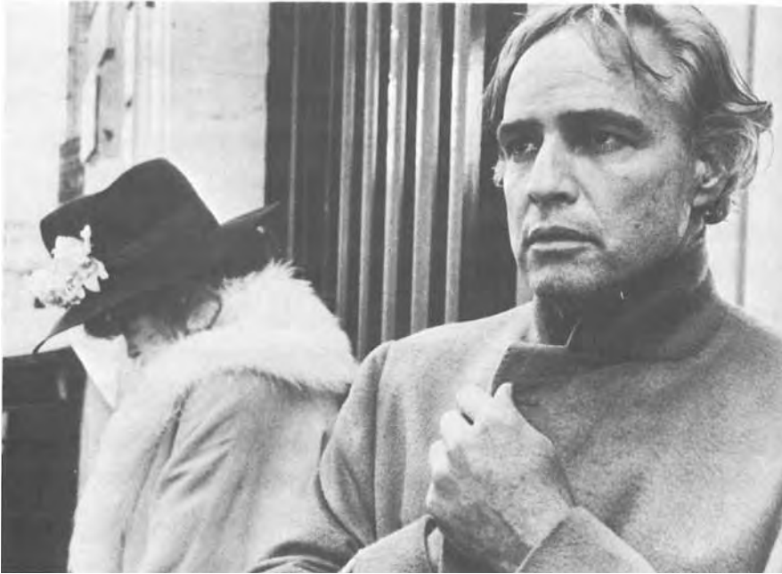
A figure of desolation. Paul (Marlon Brando) in Last Tango in Paris (Museum of Modern Art Film Stills Archive)

in a room full of flowers, he is once again confronting himself, in a further attempt to understand his own subjectivity. "Who the hell were you?" he asks her. He says that during their life together he felt like one of her hotel guests. He curses her and asks her forgiveness, crying: "I'm sorry. I don't know why you did it. I'd do it too if I knew how. . . ." And he is called away by another of the hotel's "guests," a whore whose client he scares away, runs after, and beats up, as if he were attempting to relive or settle his past and deal violently with its sexual torments.