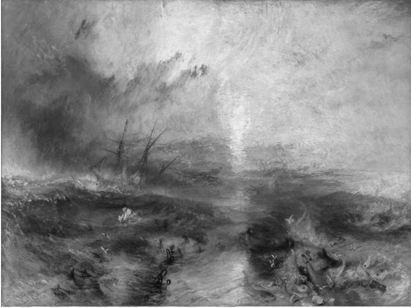
Joseph Mallord William Turner, Slave Ship (Slavers Throwing Overboard the Dead and Dying, Typhoon Coming On) , 1840. Oil on canvas, 90.8 × 122.6 cm. Museum of Fine Arts, Boston, Henry Lillie Pierce Fund.

an ominous storm. Turner's manipulation of the viewer's gaze is crucial to the painting's impact, as it effectively guides our reaction from awe at the raw power of nature, through empathy at the vulnerability of the ship, to horror at the view of the submerged, fractured body of the slave. The force of the painting can also be said to come from the way it sublimates its theme by transposing the horror of the slave trade onto the seascape: the typhoon announced in the painting's title can be seen as a symbol of final judgment against the slavers, while the blood-colored sea evokes the violence the slave trade unleashes on its victims.