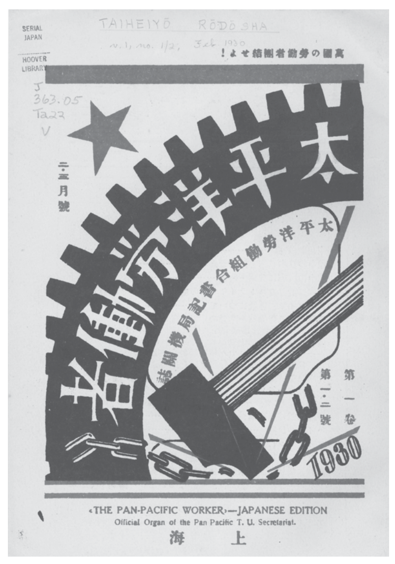
FIGURE 4 Cover of Japanese-language edition of the PPTUS publication, The Pan-Pacific Worker , vol. 1, no. 1/2 (February 1930). First issued in English in early 1928 by the PPTUS bureau in Shanghai, the Chinese, Japanese, and Korean editions were initiated following the simultaneous convening of the Second Pan-Pacific Trade Union Conference and Second Conference of Transport Workers in Vladivostok in August 1929, and establishment of the Pan-Pacific Secretariat of Transport Workers [TOST]. At the latter conference, the secretariat resolved that the newly formed Vladburo would be responsible for issuing first on a monthly basis and then bimonthly the Chinese-, Japanese-, and Korean- language editions of the PPW . The American Bureau—PPTUS took charge of the publication of the Japanese-language Taiheiyo Rodosha as a 32-page biweekly following Harrison George's appointment as head of the Bureau in early 1932.