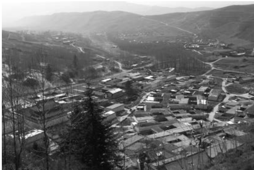
Rgulang Monastery (2010).

Beyond marriage, a second significant venue of plurilingualism was the monastery. This context primarily involved males and, for the most part, did not involve alternating languages according to different stages in the life cycle. 5 Mongghul participation in formal institutions of Tibetan Buddhism was significant. Rgulang Monastery was a large and politically significant institution at the heart of the Seven Valleys and, at its peak, probably housed around 2,000 monks, mostly from the Seven Valleys (Sullivan 2013, 2015).