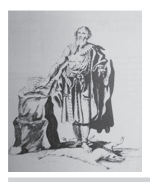
Fig. 3: Judicial J.O.-Taking in Breslau

A seventeenth-century copperplate engraving, illustrating the obligatory J.O.- taking in the Breslau Christian court. The Jew stands bareheaded, bare-breasted and barefoot on a sow-skin, his right hand is laid on the open Pentateuch – Ex. 20: 1-7 – with the injunction "Thou shalt not take the name of the Lord thy God in vain" (v. 7) clearly visible, and holding the lewish-hat in his left hand.