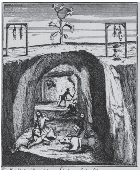
Vor Mausched müßen ietzt in Chaters Leche fitzen ; du wonners nech Jaren ausst Ichneinen Leder schwissen Warum wir haben einst. Zu wieten Schmuch gemacht, Und bis on Galgen hin der Sessim Sott erracht.