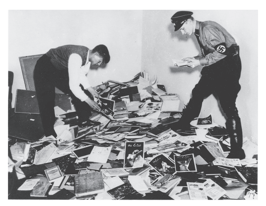
Figure 4.2 Members of the Hitler Youth select material for the book burning, 1933. Magnus-Hirschfeld-Gesellschaft.

at pictures, while the soldier is reading a page in a book. Closer inspection suggests that the photograph was staged in a way that sought to dissociate the Nazi men from the content of the materials in which they are so immersed. The picture is well lit and carefully composed. Strategically placed at the front of the mountain of books and papers are a number of photographs of topless women, apparently taken from the journal Die Ehe, the institute's publication on marriage. The conspicuous inclusion of these images heterosexualizes the materials handled by the Nazi men. Nazi propaganda and policy tended to decry and persecute both pornography and homosexuality.<sup>108</sup> However, here the prominent placing of photographs of topless women suggests that homophobic anxieties shaped the raid on the Institute of Sexual Science. The representation of Nazi hands on naked women manages to maintain the institute's association with sexual immorality even as these images also ensure that the Nazi men sent to cleanse the institute of its holdings are dissociated from homosexuality. Sharon Patricia Holland has argued that "if touch can be interpreted as the action that bars one from entry and also connects one to the sensual life of the other, then . . . racism has its own erotic life."109 Holland's observation on "the erotic life of racism," by which