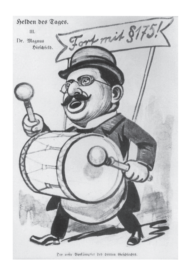
Figure 1.1 A 1907 political cartoon depicting sex-researcher Magnus Hirschfeld, "Hero of the Day," drumming up support for the abolition of Paragraph 175 of the German Penal Code, which criminalized homosexuality. The banner reads, "Away with Paragraph 175!" The caption reads, "The foremost champion of the third sex!"

While Hirschfeld did not address directly the antisemitism, he noted that the attacks against him in the wake of the Harden trial, a scandal that had started out as a response to the perceived weakening of Germany's colonial might, "brought the laborious achievements [of the fledgling homosexual rights movement] once more into question." Hirschfeld noticed the rise of what Eve Kosofsky Sedgwick would later call "homosexual panic," a term she borrowed from the psychiatrist Edward Kempf, which describes "the most private, psychologized form in which many twentieth-century western men experience their vulnerability to the social pressure of homophobic blackmail." According to Hirschfeld "it was after the Moltke-Harden scandal