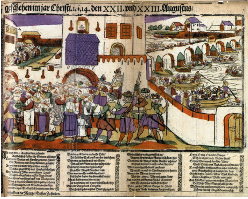
Fig. 3 and 4: Zeytung des verlauffs zu Franckfurt am Meyn von der blinderung der Juden Gasse