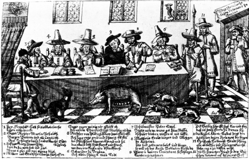
Fig. 10: Das rebellische Bayrn Parlament zu Braunau