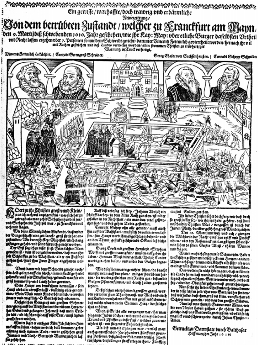
Fig. 6: Eine gewisse/ warhafft/ doch trawrig und erbärmliche Newzeitung

On the whole, the public interpretation and popular memorisation of the revolt was dominated by the authoritarian view of the imperial punishment of a political crime to be commemorated through the erecting of a Schandsäule – a “pillar of shame” or “infamy monument” – at the devastated place of Fettmilch’s house. Two more illustrated broadsheets, printed in Frankfurt by Conrad Corthoys and again Johann