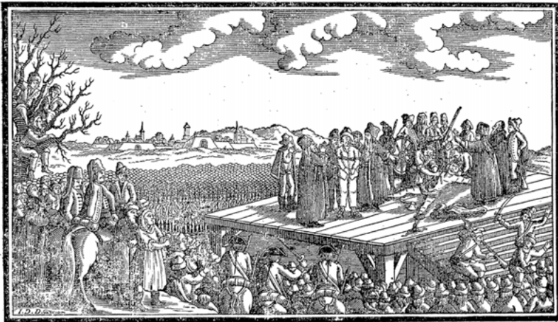
Fig. 14: Vorstellung der Execution