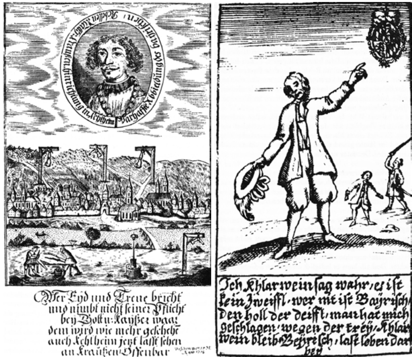
Fig. 11 & 12: Two different representations of revolt: the execution of the ringleader Kraus (Wahrhafftige Abbildung), and Khlarwein as a Bavarian patriot (Rechtfertigung Plinganser, in: Probst, Volksaufstand, 313)