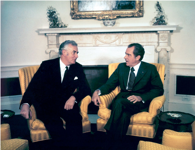
Australian Prime Minister Edward Gough Whitlam and US President Richard Nixon, Washington DC, 30 July 1973