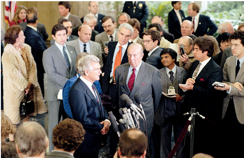
Australian Prime Minister Bob Hawke speaks at a press conference in Washington DC, in 1985, watched by US Secretary of State George Shultz