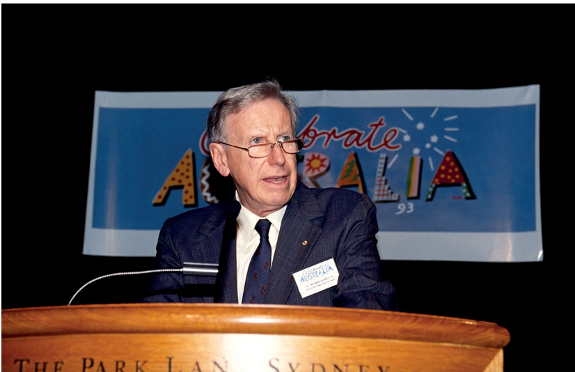
Rawdon Dalrymple, Australian Ambassador to the United States from 1985 to 1989, speaking in 1993