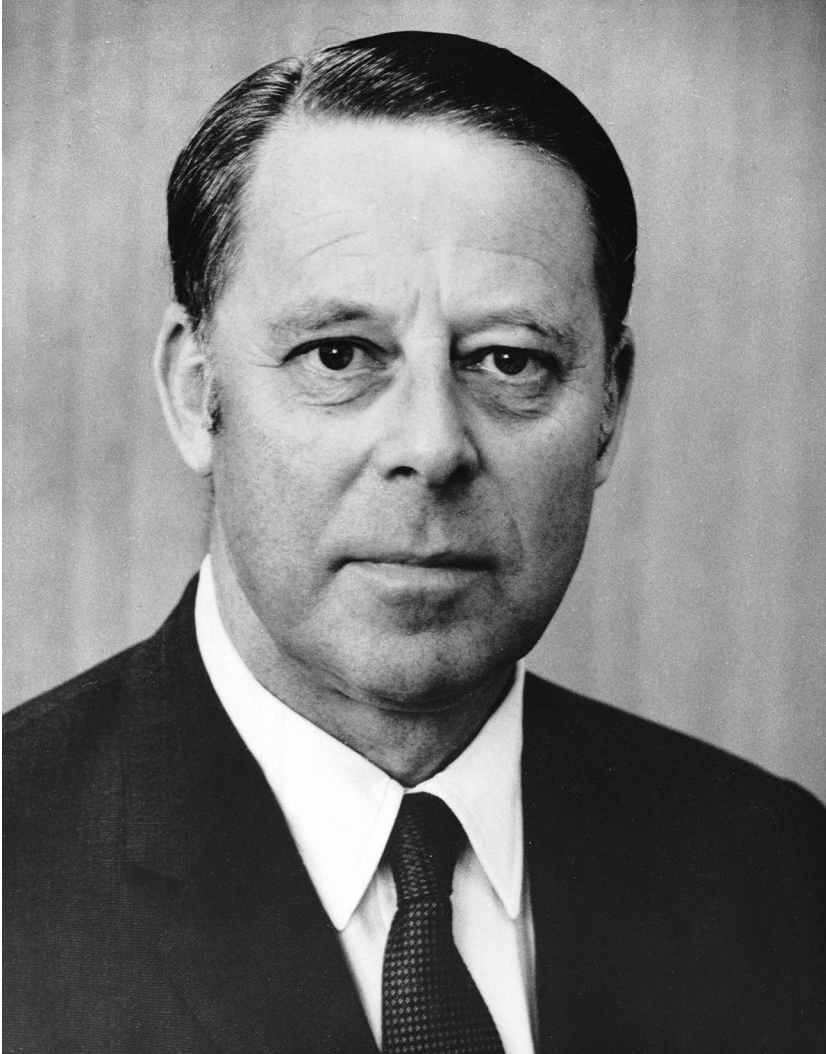
Sir Patrick Shaw, Australian Ambassador to the United States from 1974 to 1975, pictured in 1960