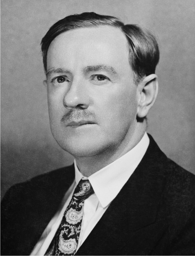
Percy Spender, Australian Minister for External Affairs, in 1949, two years before being appointed Ambassador to the United States