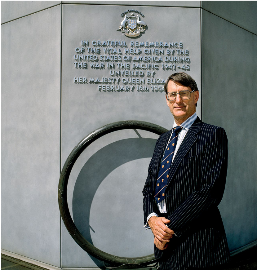
Australian Ambassador to the United States Michael Cook in 1989