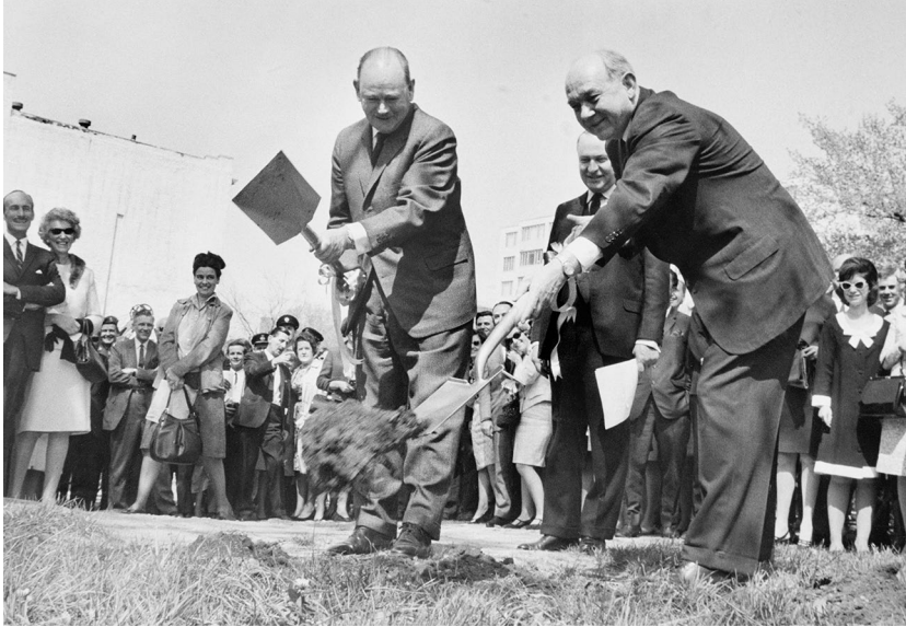
Australian Minister for External Affairs Paul Hasluck and US Secretary of State Dean Rusk break ground for the new Australian Chancery in Washington, 1967