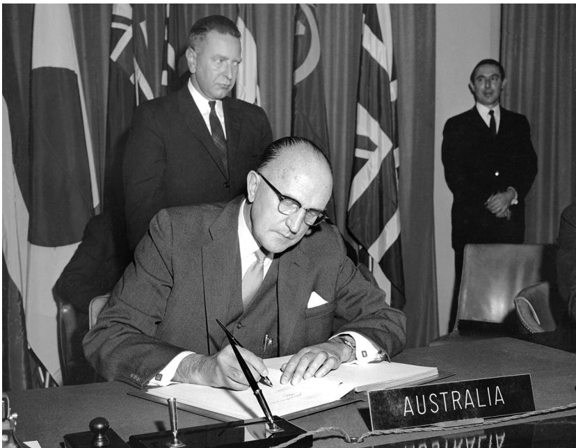
Australian Ambassador to the United States Howard Beale signing the Antarctic Treaty, 1959