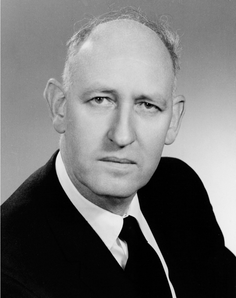
Sir James Plimsoll, Australian Ambassador to the United States from 1970 to 1973, pictured in 1965