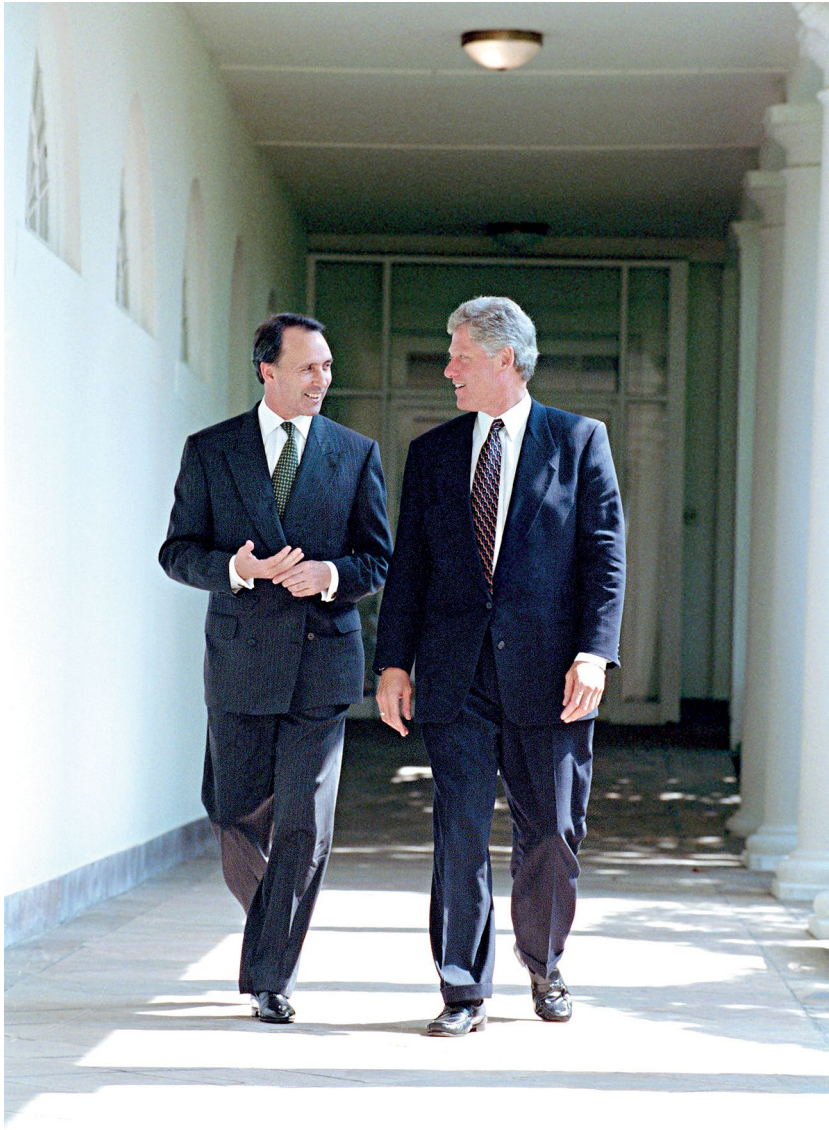
Australian Prime Minister Paul Keating and US President Bill Clinton in 1993