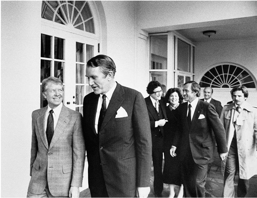
From left: US President Jimmy Carter, Australian Prime Minister Malcolm Fraser and Australian Minister for Foreign Affairs Andrew Peacock (fifth from left) at the White House, 1980