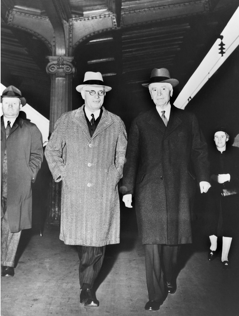
Australian Prime Minister John Curtin with US Secretary of State Cordell Hull, Washington DC, 1944 (Elsie Curtin in background)