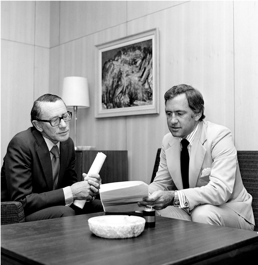
Alan Renouf, Secretary, Department of Foreign Affairs, talking with Australian Minister for Foreign Affairs Andrew Peacock in January 1976, a year before Renouf's appointment as Ambassador to the United States