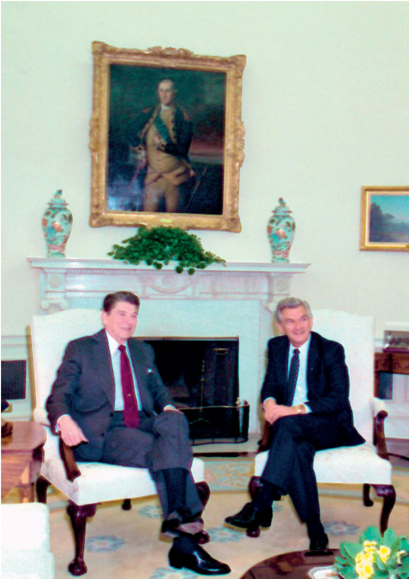
US President Ronald Reagan and Australian Prime Minister Bob Hawke at the White House, during Hawke's visit to the USA in 1986

Source: National Archives of Australia, A8746, KN8/5/86/2