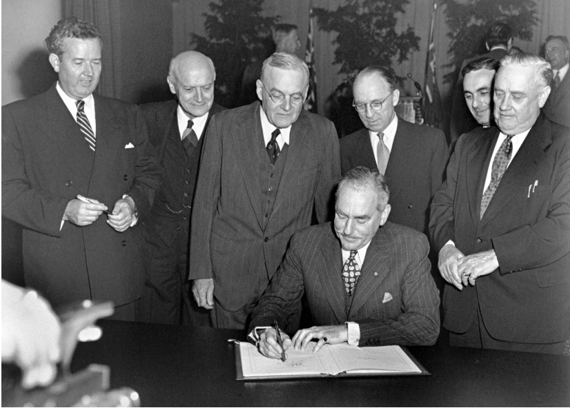
US Secretary of State Dean Acheson signing the ANZUS Treaty in San Francisco, 1 September 1951, watched by John Foster Dulles (left), who would succeed Acheson from 1953 to 1959