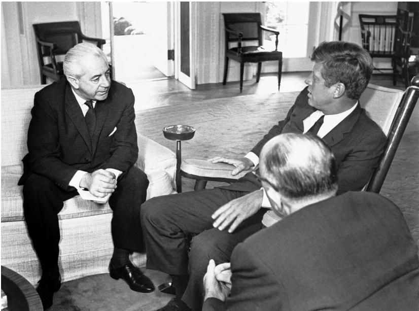
Australian Treasurer Harold Holt with US President John F. Kennedy, 5 July 1963