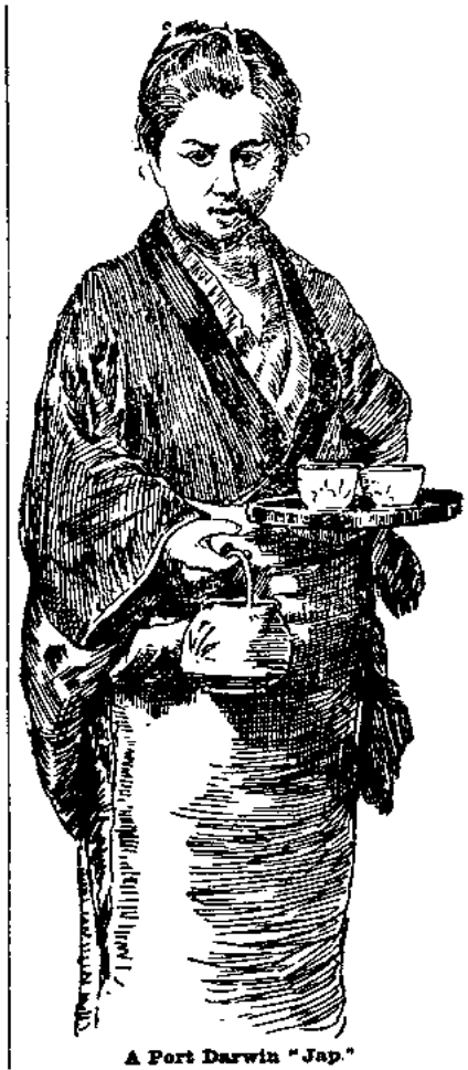
A Port Darwin "Jap."

From the Queensland weekly magazine, the Boomerang , 12 May 1888.