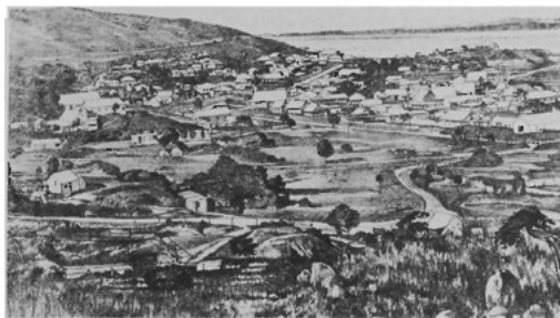
Thursday Island, 1894

Japanese began to appear among the luggers' crews in the late 1870s. From early in 1893 they were the largest national group employed in the industry at Thursday Island. 3 In 1908 they achieved the same preponderance at Broome. In 1913 when the industry reached its peak, there were 1166 Japanese 'indenters' at Broome and 574 at Thursday Island. 4 When the war broke out in 1941 the Australian pearling industry had about 500 indentured Japanese in its employment. 5