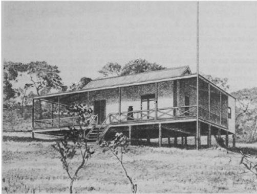
The Japanese Club, Thursday Island, 1894

In the course of my visit to the Island I often heard that the more influential among the natives were discussing what would happen in circumstances such as the following—if we invested big sums and set up large agencies there: if we exported shell to London without going through middlemen; or if our government sent several hundreds more of us there. It was obvious that our latent strength was causing fear among the Island's principal merchants and shopkeepers. 99