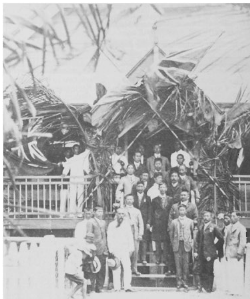
Celebration of the Emperor's birthday, Japanese Resident's Association, Thursday Island, 1910

Following Federation, the control of immigration was in 1902 transferred from the States to the Federal Government. The latter took the number of coloured persons then employed in the industry and allowed replacements up to that level. Within these limits no restrictions were placed on particular nationalities. Initially, its policy was to grant additional permits for crews for any new boats added to the pearling fleets. In November 1905, however, when the Senate passed a resolution that no coloured labour be admitted except to fill existing vacancies, this dispensation was discontinued. 125 This fixed the maximum number of coloured persons for temporary admission to serve on luggers at about 4000 for the Commonwealth as a whole, of whom about 2500 were at Broome. 126 There, over the period 1905 to 1910, the proportion of Japanese rose from 32.6 per cent to 51.3 per cent. 127 At Thursday Island, in the latter year the proportion of Japanese was 55.3 per cent and, of the 160 licensed divers there, 150 were Japanese. 128 Since the time of the Hamilton Commission, the belief that the pearling industry should not be an exception to the White Australia Policy had extended considerably beyond the membership of the Labor Party and the trade unions. This belief, however, was tempered by the realisation of the demonstrated fact that life aboard the pearling luggers did not attract Australian workers. When Labor secured its first long term of office at the