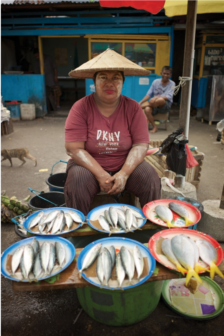
Fig. 2. TERNATE: A fishmonger at the central market and bus terminal poses with her stock. She's fashionably outfitted against the midday sun with a broad hat and smears left by a thin rice-flour-and-turmeric paste applied earlier to protect her skin; alas, her fish boast no similar protection from the heat. June 2010: photo by S. Chris Brown