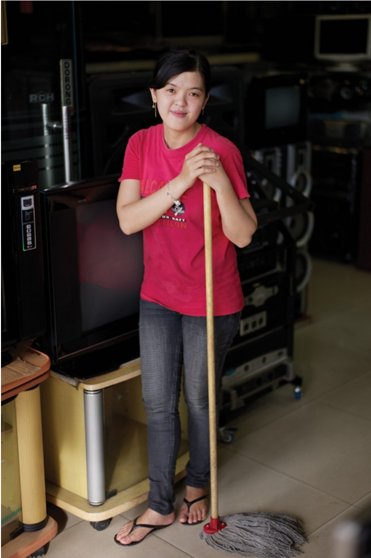
Fig. 5. PONTIANAK: A young woman working in an electronics shop is eager to pose for the camera. Too late, she is chagrined to realize that her mop will undermine the sophisticated air she hoped to project. June 2010: photo by S. Chris Brown