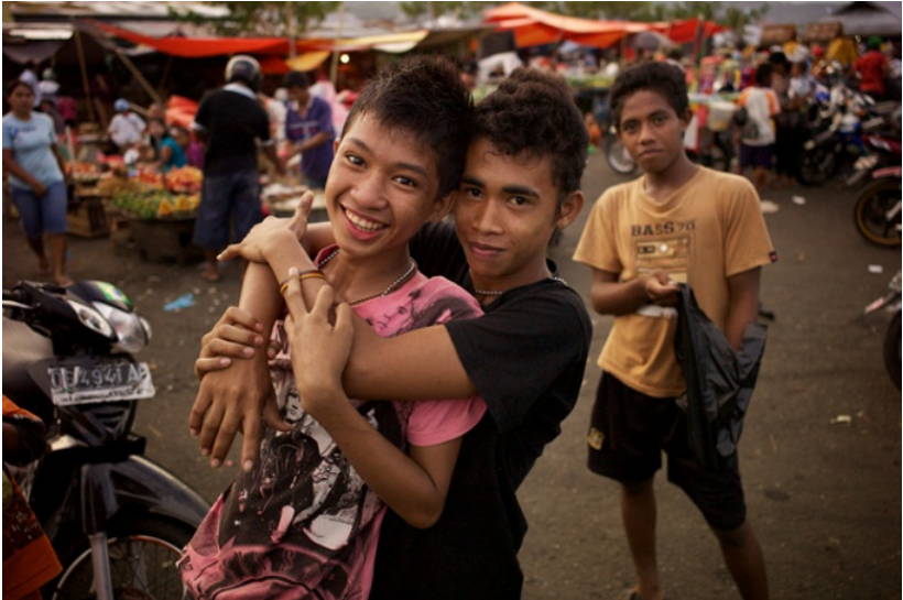
Fig. 1. TERNATE: Punk pals bask in the glow of friendship and the orange evening sky, in between running odd jobs for market vendors. June 2010; photo by S. Chris Brown.