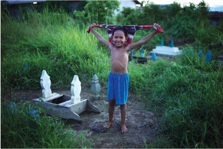
Fig 7. PONTIANAK: The city is built on top of a swamp, with houses on stilts or piles; sometimes when a big truck passes by, you can almost see the asphalt ripple like a wave under its tires (and you can definitely feel the hollow reverberations). In some neighbourhoods the only dry land is the cemetery, which therefore doubles as a playground.