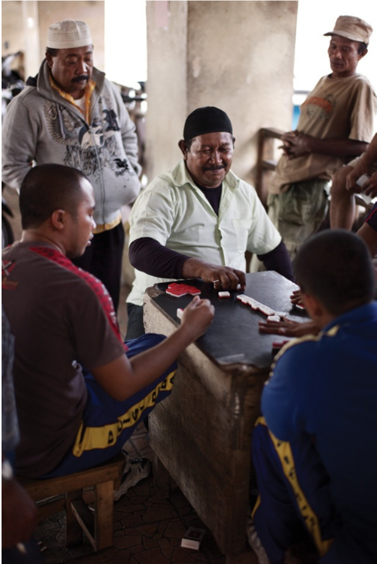
Fig. 6 TERNATE: Dock bosses spend much of the day (and night) at the central pier playing dominos for money, petty sums per point which can nevertheless add up to a tidy amount. Even though gambling is illegal, local police frequently join in the action. Meanwhile, more junior members of the dock gang are allocated actual loading and unloading of boats, from which the bosses reserve a cut. June 2010: photo by S. Chris Brown