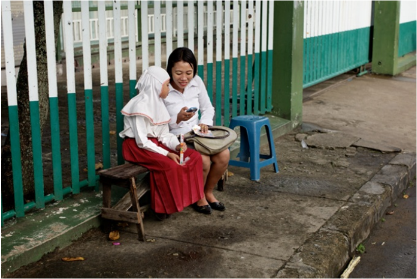
Fig. 8. PONTIANAK: An elementary teacher helps a forlorn student, waiting outside the schoolyard, arrange for a ride home. June 2010