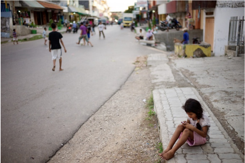
Fig 3: KUPANG: Girl absorbed in a cell phone game while older kids play street soccer in downtown kupang. Cell phones, with radios, games, music, cameras, and web access, are the new babysitters all over Indonesia. June 2010: photo by S. Chris Brown