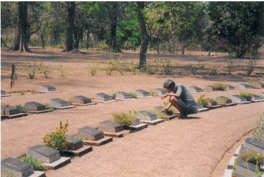
Thanbyuzayat War Cemetery gravestones (2002)