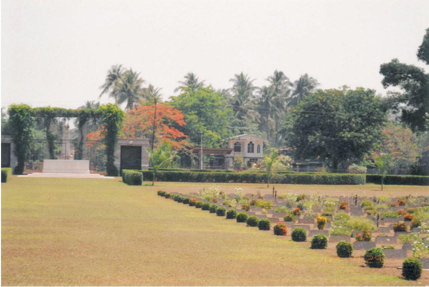
Thanbyuzayat Commonwealth War Cemetery – Entrance gate and gravestones