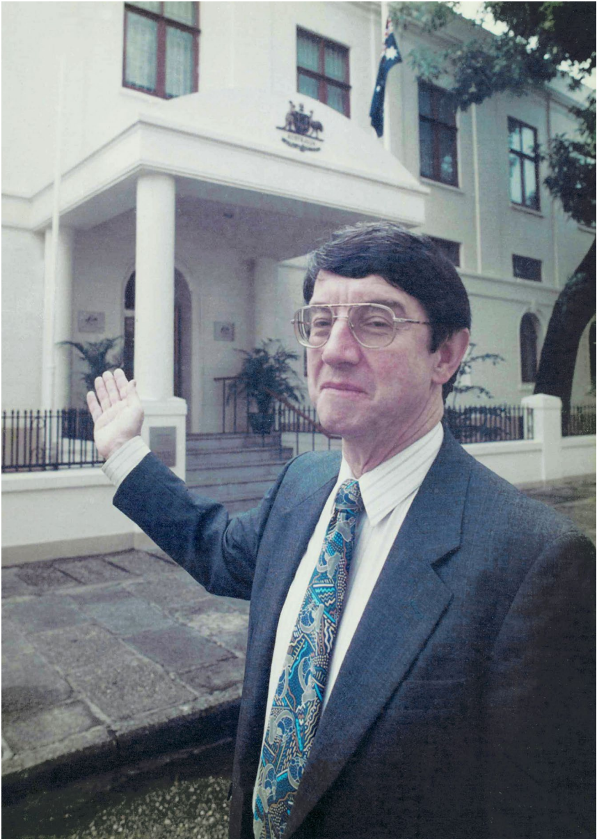
At opening of the refurbished Australian Embassy, Strand Road (2000)