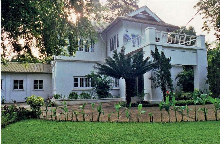
Australian Ambassador's residence and garden, Yangon (2002)