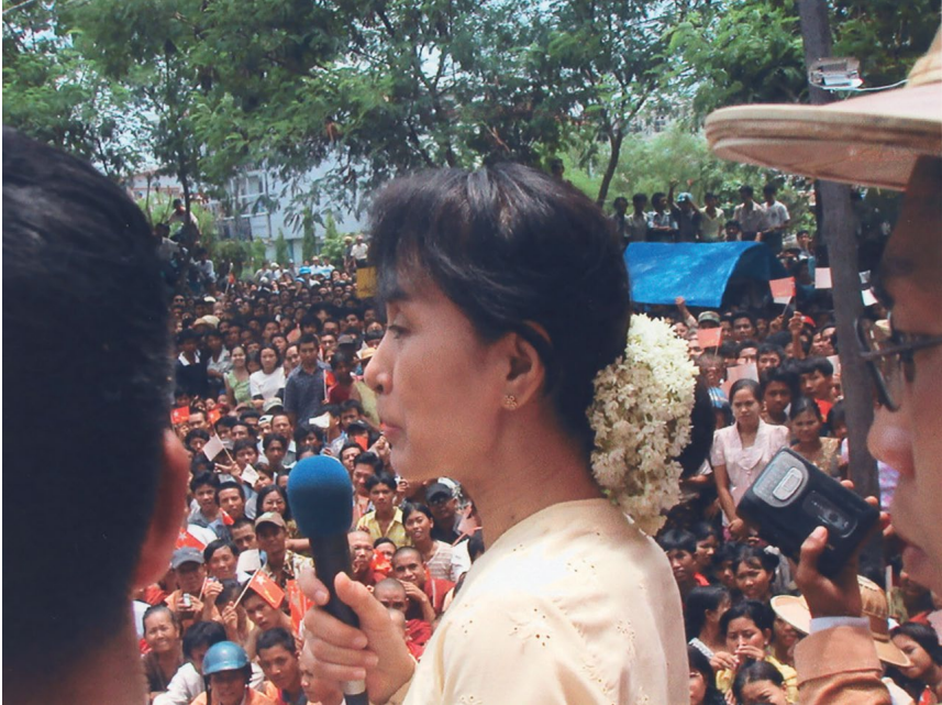
Aung San Suu Kyi in crowd after her release (2002) (Mandalay)