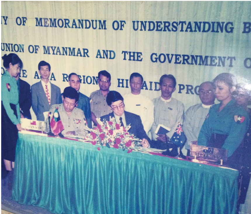
Signing MOU on HIV AIDS cooperation with Myanmar Police Force (2002)