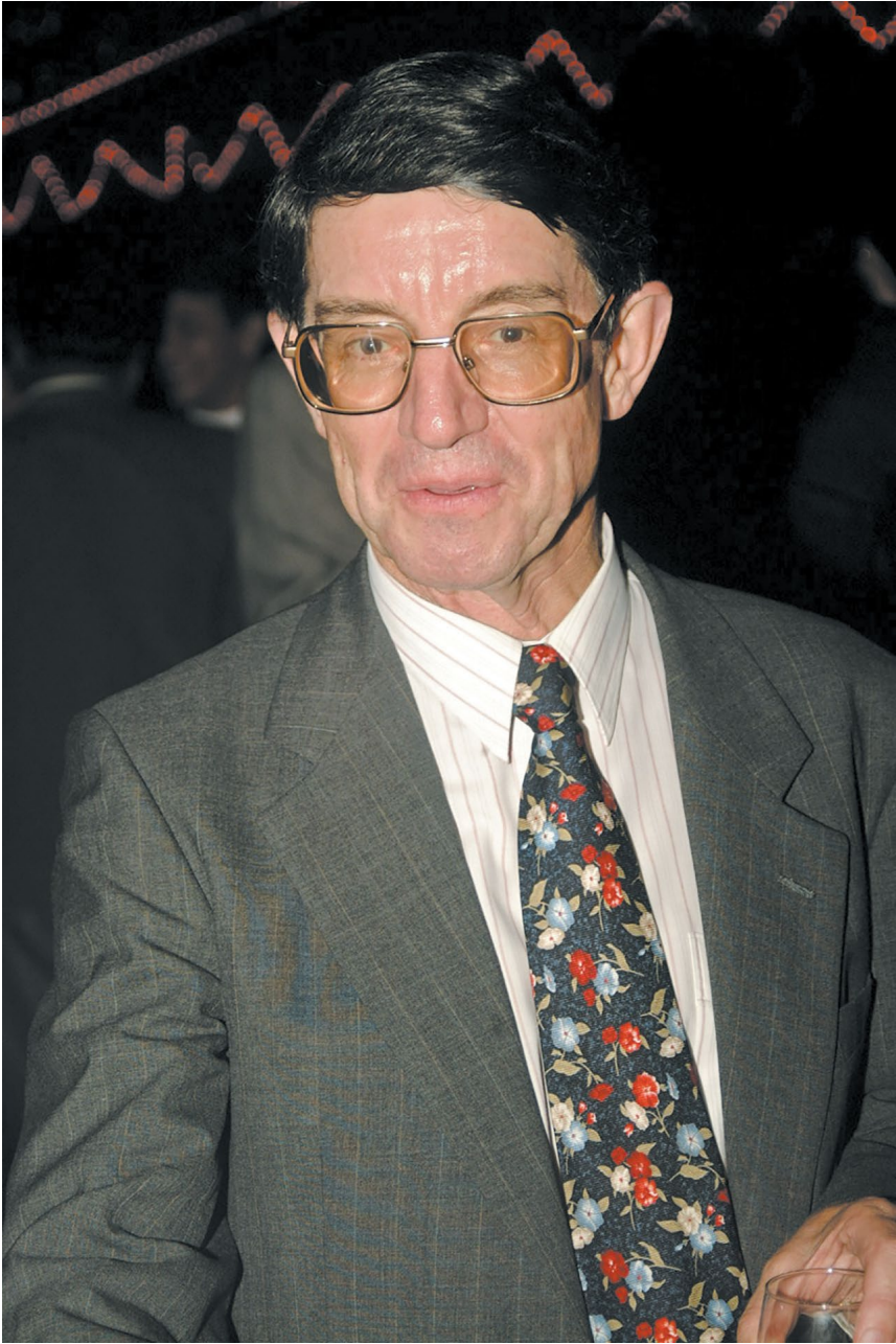
At an Australia Day Reception at the Australian Club, Yangon (2003)