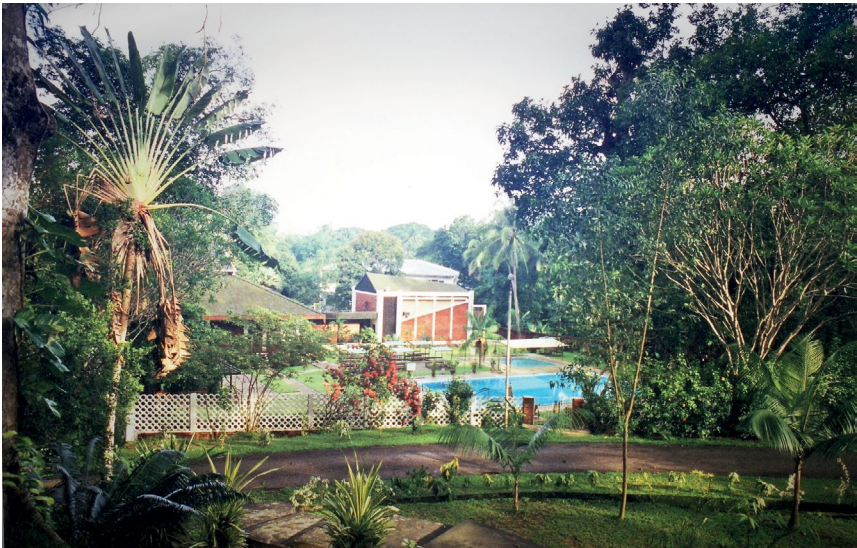
Australian Club buildings taken from Ambassadors' residence (2002)