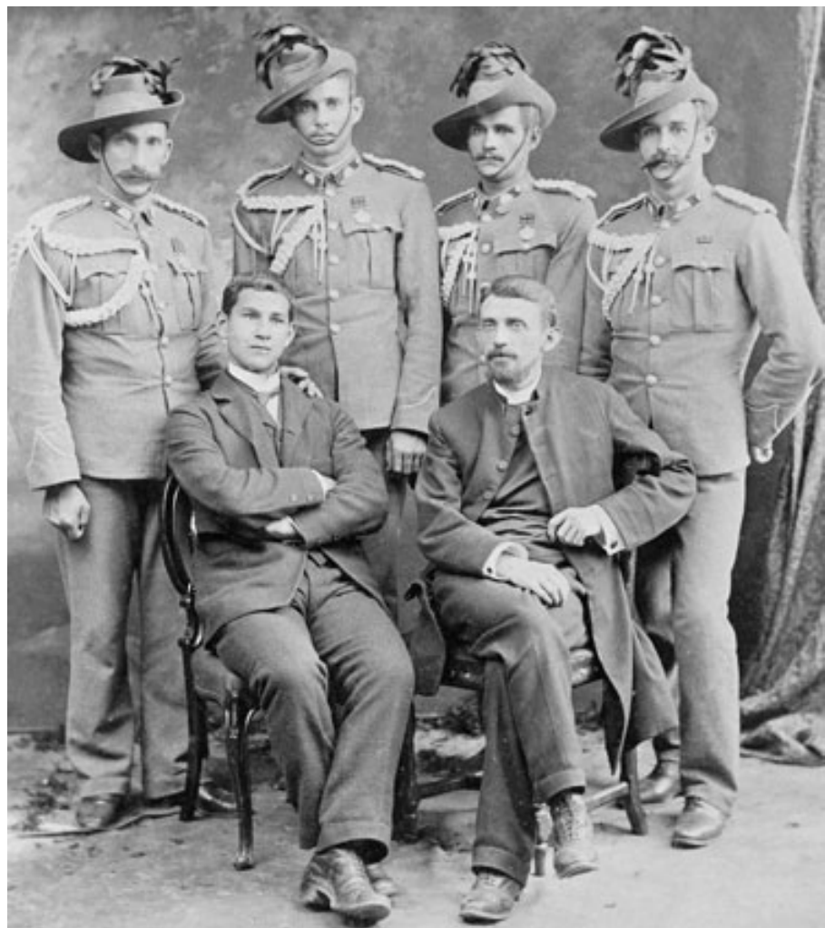
Four Imperial Bushman natives of Norfolk Island, in Commonwealth Contingent sent to London for the Coronation of King Edward VII; also one clergyman and one civilian, London NAA CP697/96