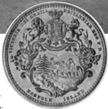
Insert: Norfolk Island Seal Norfolk Island 994.82, plate no. 25114