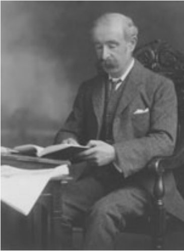
Portrait of Patrick McMahon Glynn, South Australian Federation Leader and MHR