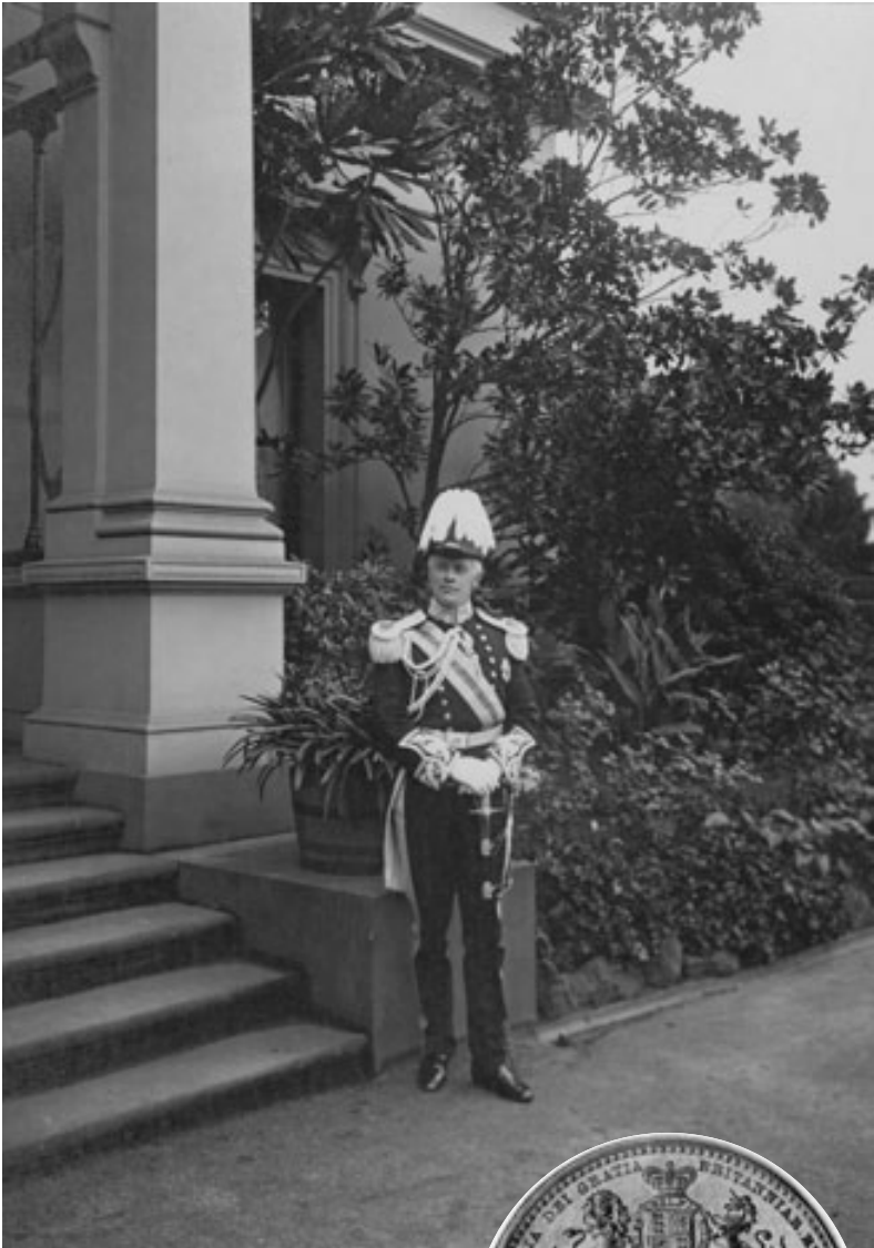
Portrait of Sir Ronald Munro Ferguson PIC/6690