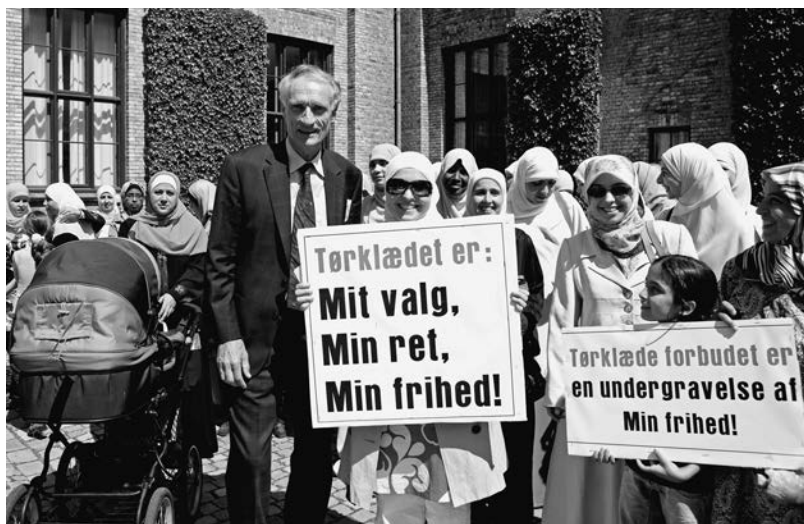
Ill. 9.1 Danish Muslim women demonstrate for the right to veil. The sign says, 'The headscarf is my choice, my right, my freedom'. The man in the picture is the liberal Bertel Haarder, who was Minister of Integration at the time.

The right thing is therefore to ban the veil and live accordingly to our customs here in Denmark. 15