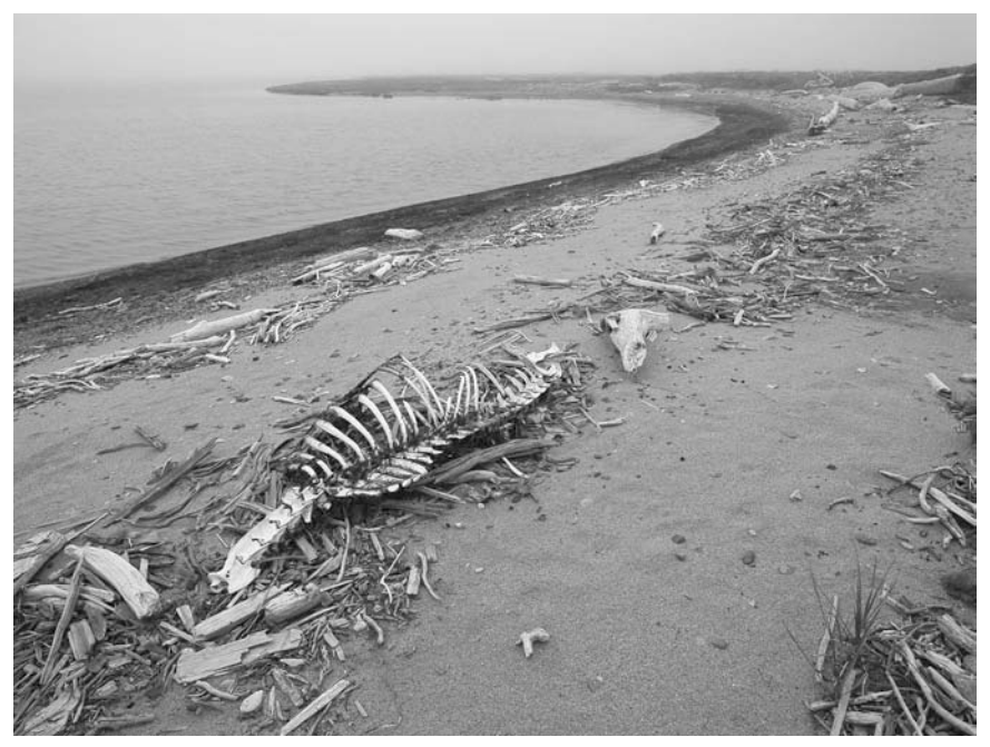
Figure 2: Subhankar Banerjee, Caribou Skeleton , Barter Island in the Arctic National Wildlife Refuge, 2006

conditions that mark the circulation, display, and reception of the photograph on the other.