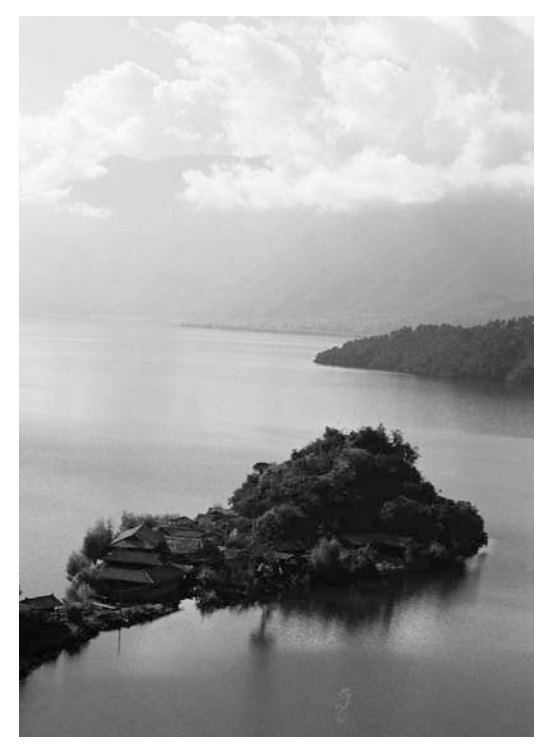
Figure 8: Lige peninsula in Lake Lugu, October, 2000.

corporations in North America, which produced cancer medicine. In this chain, all links made money. But the later the link in the chain, the more money it earned. The peasants stripping the yew gained the least money; and the medical corporations, the most. Which link, however, will bear the biological consequence of stripping yew? Of course, it is the local peasants, the lowest link of the "food chain."