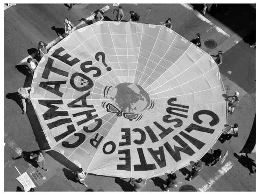
Figure 7: "Climate Justice or Chaos?"

campaign associated with the Live Earth concerts and its accompanying Global Warming Survival Guide-indigenous activists have recoded survival as a biopolitical rights-claim that seeks redress for the uneven allocation of climate-related vulnerability along already-existing lines of marginality and disenfranchisement.<sup>17</sup> As Banerjee himself puts it during a presentation of his work with Gwich'in activist Sarah James at Klimaforum09, "climate change is a great human rights issue ... right to survival is one of the first rights people should have—access to their food, access to their water—and that's being seriously threatened up in the Arctic" (Interview with Amy Goodman). The right to survival invoked by Banerjee is irreducible to a question of sheer material resources, for the latterhunting for instance—are themselves inscribed in specific cultural repertoires, technical practices, and ecological knowledges that make up a kind of ethnomnemonic archive that is itself threatened by climate-related displacements such as that with which Shishmaref is currently undergoing (Sutter). Thus a certain survival of historical memory is inextricable from the survival of living beings. However, historical memory is not only a matter of a cultural tradition in the limited sense; it is also a kind of bear-