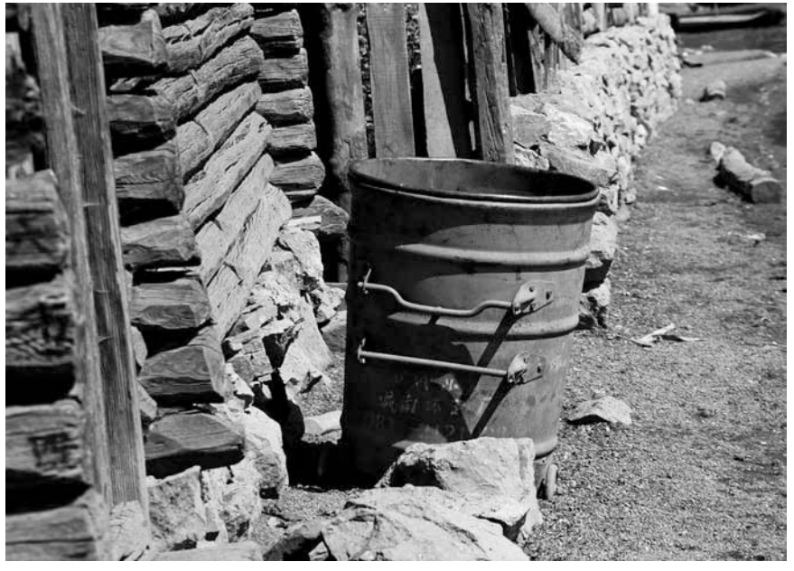
Figure 10: Garbage can at the center of the previous photo.

Lake Lugu. I asked her to find the places where Lige and Luoshui (<math>h) dump their garbage. Luoshui is another Nari village close to Lige. It is the first village there that developed tourism, and therefore is the richest village around Lake Lugu. It had Internet bars even before 2000.