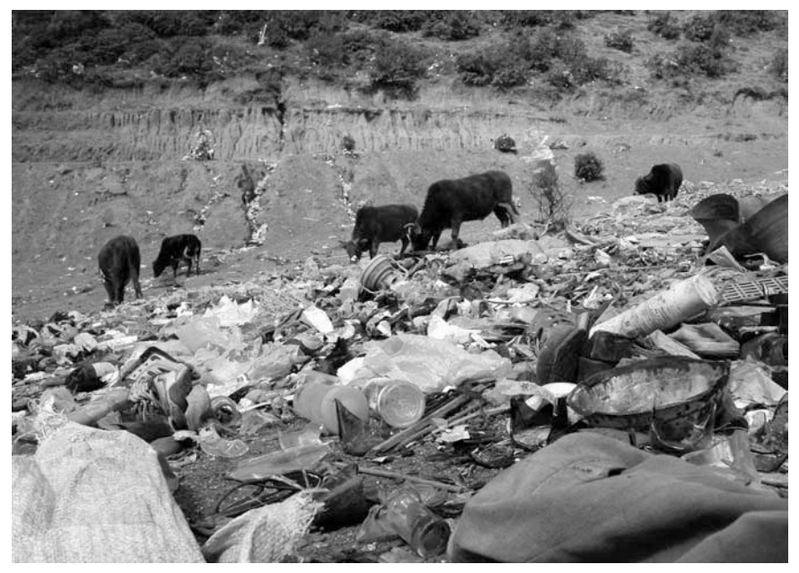
Figure 11: Garbage dumped by Liege Village.

made more and more money, and they began to use more and more industrial products in their daily lives, such as washing powder, shampoo, plastic shoes, etc., which are signs of civilization, development, progress, and so on. As a consequence, more and more non-biodegradable garbage appeared. The villages are at the bottom of "food chain"; they can't find their own downstream for dumping their own garbage, and can only dump their garbage on their own mountain.