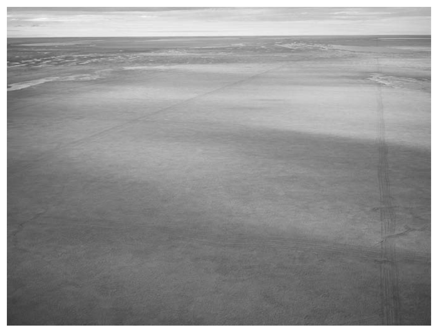
Figure 4: Subhankar Banerjee, Known and Unknown Tracks, Teshekpuk Lake Wetland, 2006