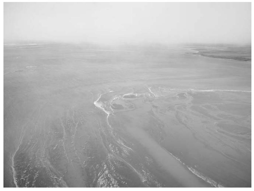
Figure 6: Subhankar Banerjee, Storm over Kasegaluk Lagoon, along the Chukchi Sea coast, 2006

the suspension of presence." Nancy continues, "this suspension is always a question of passage, or a passing on. A landscape is always a landscape of time, and doubly so: it is a time of year (a season) and a time of day (morning, noon, or evening), as well as a kind of weather [ un temps ] rain or snow, sun or mist. In the presentation of this time ... the present of representation can do nothing other than render infinitely sensible the passing of time, the fleeting instability of what is shown" (Nancy, "Vestige" 94). Among other things, what is "shown" in its fleeting instability is depopulation itself, the voiding of human presence as the condition of landscape—a point echoed by Banerjee in his attention to the complicity of traditional landscape photography with a dialectic of colonial expansion and aesthetic preservation of "untrammeled wilderness." Thus depopulated, landscape projects itself as a realm of purely natural temporality; but it is nevertheless frozen or suspended into a singular moment by artistic representation, arresting the very temporality to which it would bear witness in its claim to be devoid of human presence. The uncanniness of landscape identified by Nancy in the very origin of the genre—both its originary "depopulation" of the country and its paradox-