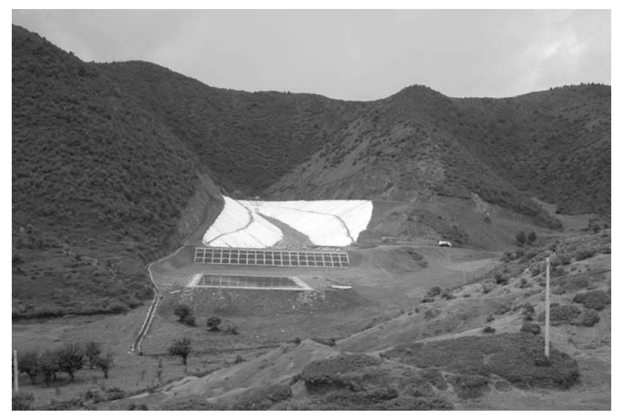
Figure 14: The garbage dump of Yongning in a mountain valley near Lake Lulu. Photographed on August 19, 2008

originally people's way of life. When these were made into the resources of tourism, people began singing and dancing for money, with the result that these activities became not life itself, but a performance of life. When people make money, they want to live in increasingly modern ways; they no longer live as before, but as people in modern areas far from the village. Their singing and dancing lose authenticity and become a staged performance. This means that the deepest resources they used for development are actually lost. This is a palpable shrinking at the "spiritual" level.