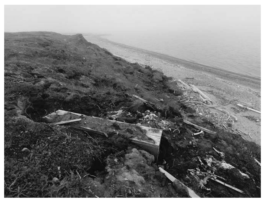
Figure 3: Subhankar Banerjee, Exposed Coffin , Barter Island in the Arctic National Wildlife Refuge, 2006

we confront today. In an exemplary analysis, Banerjee writes, "this photographic approach ... did as much to destroy the land as it did to preserve it." First of all, such a fetishization of isolated sites of aesthetic beauty contributed to the intensification of touristic visitation of these very sites, thus contributing to the further disintegration of the putative purity that made them attractive to visitors in the first place. More urgently, however, the fetishistic isolation of such "natural sites" enforced an ideology of wilderness as a sacred zone of purity set over and against the realm of the human, thus implicitly marking such places as outside history, and other places as "unnatural" and thus unworthy of consideration in ecological terms. Echoing the environmental historian William Cronon, Banerjee suggests that this ideological framing of wilderness resulted in more than two decades worth of environmentalist campaigning devoted to the preservation of wilderness as an aesthetic amenity defined over and against the menace of "human intrusion" while ignoring the intensification of local, regional, national, and global ecological crises related to unsustain-