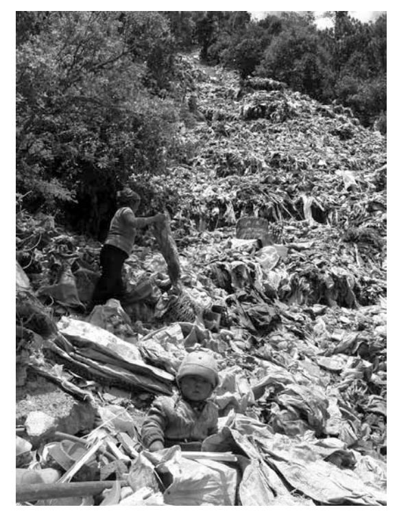
Figure 13: Garbage hill: six years of garbage from Luoshui village. Photographed by Zhao Hua, May 21, 2004.

nasty, and they always drank lake water directly. But in 2000, I was told in Luoshui that the water close to shore was not drinkable, and people had to draw a boat to the center of the lake to take drinkable water.