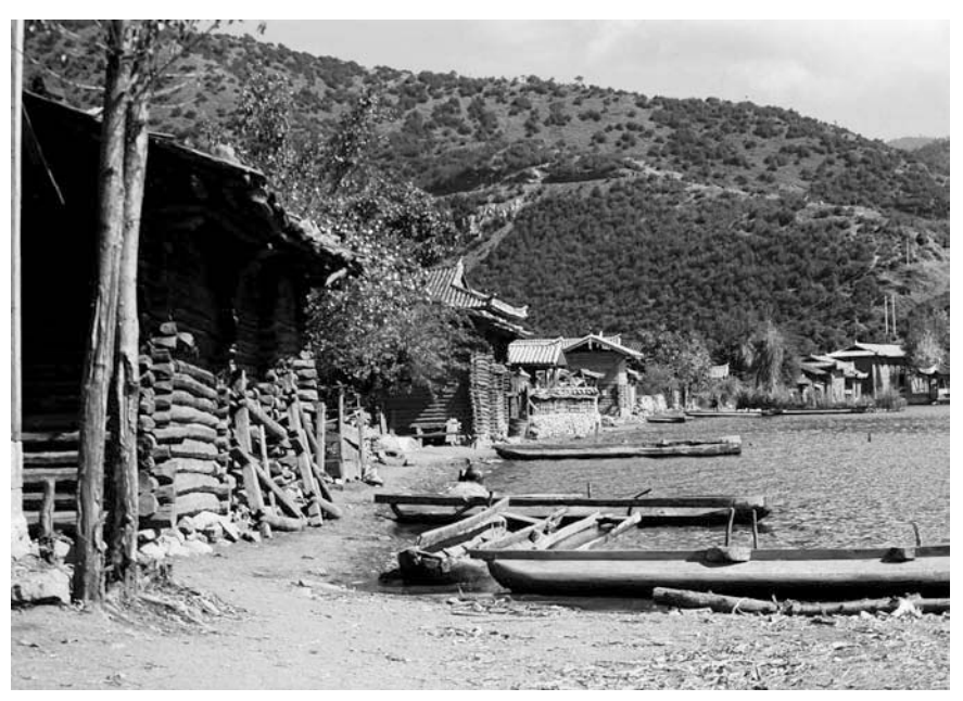
Figure 9: The entrance of Lige. Note that there is a garbage can in the center of the photo. October 2000.

and energy. Being located in the downstream or mid-stream of the global modernization "food chain" is the background of all problems in non-modernized or sub-modernized countries and areas.