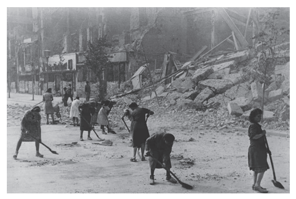
Figure 2.1 – Berlin, 1945, clearing the ruins