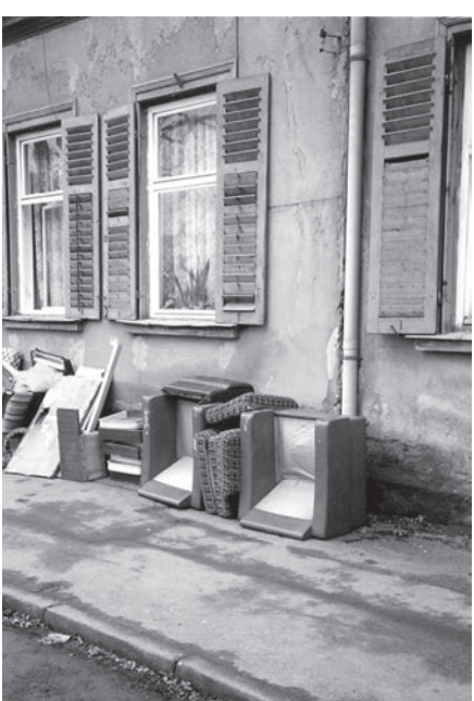
Figure 4.1 and 4.2 – Rudolstadt, 1994, pile of rubbish

libraries and town halls, the decoration in the few shops not yet renovated, and the little East German neon signs that were still there. I happened to visit Weimar on the day when the municipal rubbish collectors picked up large items, thus allowing me a glimpse of the remnants of people's interiors that were now piled up on the side of the street. The overall scene left an impression similar to the ones I had encountered in the waiting rooms of public buildings. The colors were rather dreary. Most objects were rectangular, hardly adorned or plain, and rather drab. As far as the objects were decorated, these decorations did not seem to match the overall rectangular shapes of the objects. When I returned home, my general impression was that the GDR had had a rather severe material culture. When I later bought a catalogue with pictures of former East German consumer goods, this impression was confirmed.<sup>2</sup>