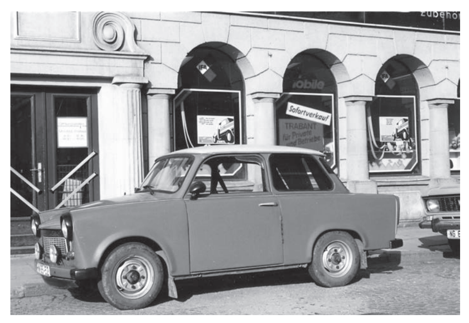
Figure 8.1 – Rudolstadt 1989/90, Trabant – instant sale

A West German furniture salesman who had opened a business in Rudolstadt right after the Wall fell, selling remnants bought up in the FRG, explained that it did not matter what he brought, it all sold anyway, "the people wanted everything, as long as it came from the west." When traders from Bayreuth, a relatively nearby West German town, brought their wares to the market in Rudolstadt, everything sold like hot cakes, despite the fact that a pineapple cost 24.95 DM and a bar of chocolate 7.50 DM. With wages many times lower than in the FRG (even at the fictitious exchange rate of 1:1), these prices were indeed "überteuert [exorbitant]," but as the residents of Rudolstadt asked a local journalist: "Wann habe ich einmal die Möglichkeit, das Alles einzukaufen [when will I be able to buy all this?]." 12