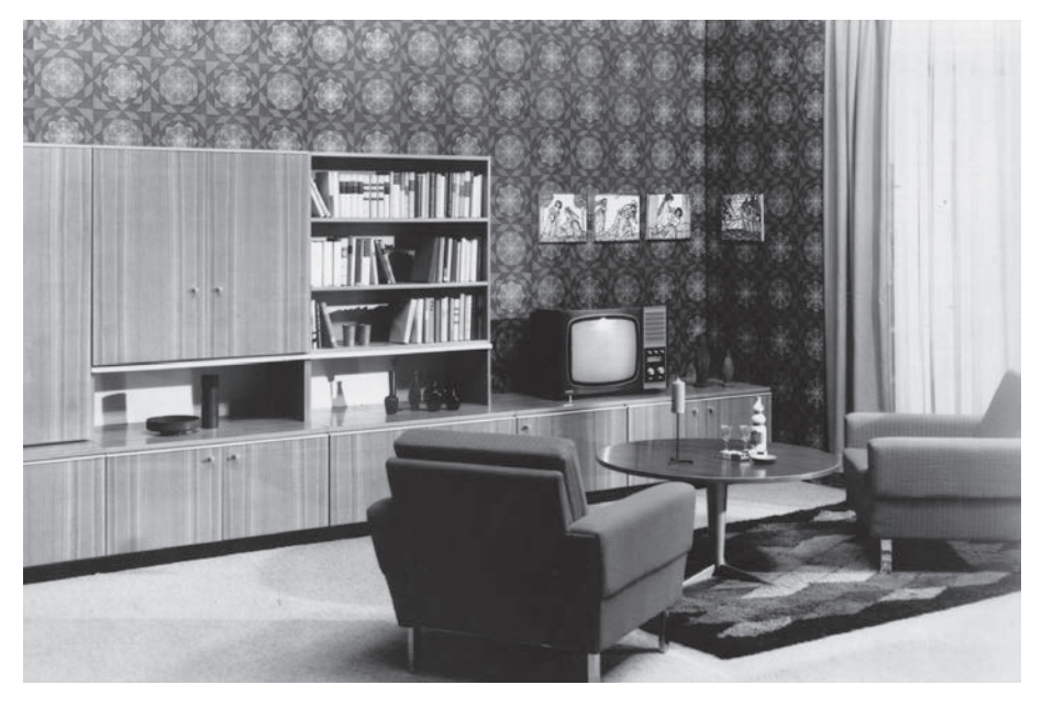
Figure 4.9 – East German living room interior with wall system 'Carat,' 1972