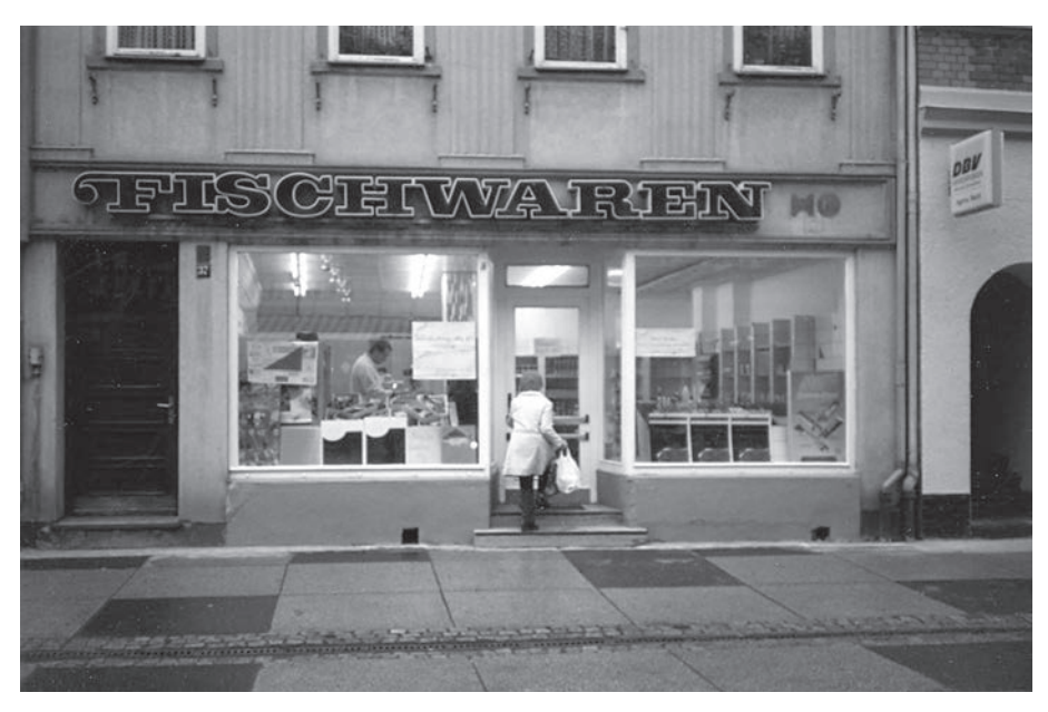
Figure 4.3 – Rudolstadt, 1993, fish-shop