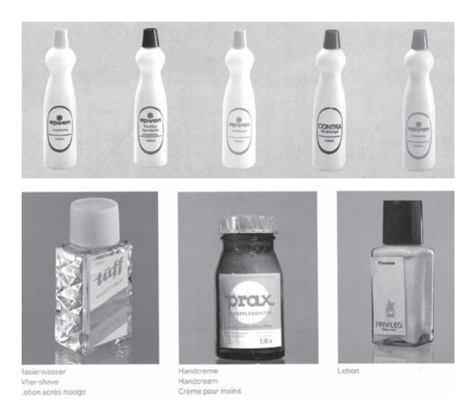
Figure 4.11a and b – East German drugstore products

from creative accounting, understatements and other forms of beautification were frequently used to flatter developments. If it was impossible to leave out a negative development, people often enveloped it in beautiful-sounding phrases. A confidential archive document from 1963 about trading and supplies in Rudolstadt mentions the following: "The women of our area are still very much engaged in all the issues pertaining to the maintenance of peace and the problems of the Moscow Agreement, but also in matters of supply."<sup>32</sup> The document is telling: twenty-six positive words, followed by an almost negligible six-worded remark. The same applies to the following message on the state of affairs concerning food supplies, which dates from the year 1983 and has a positive ring: