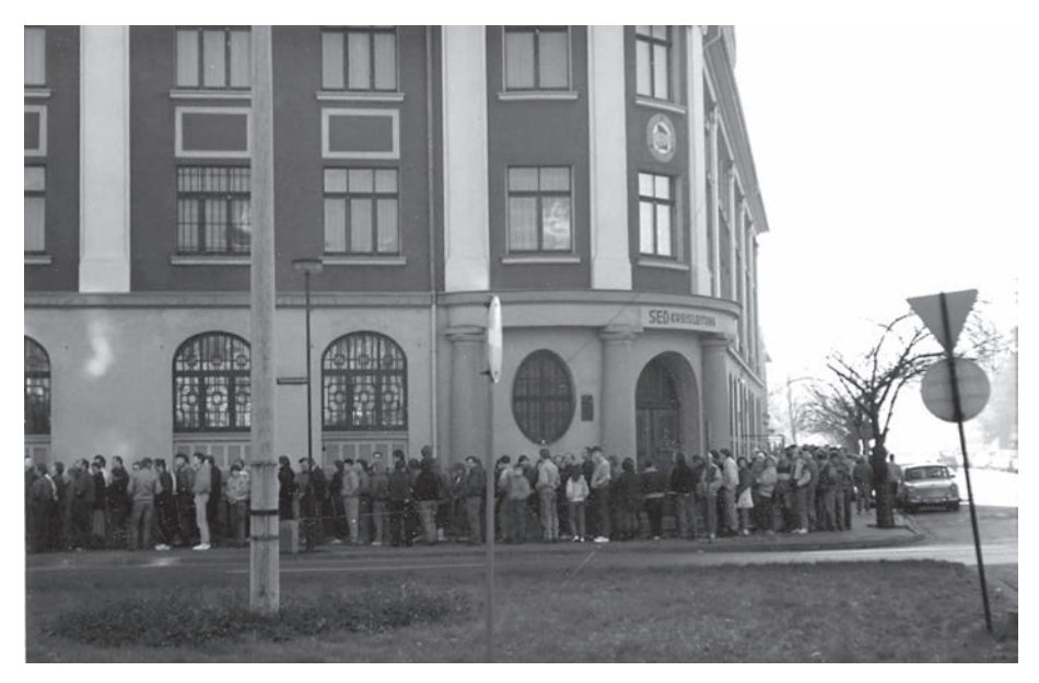
Figure 8.2 – Rudolstadt, July 1, 1989: Währungsunion [monetary union], queue in front of Rudolstadt's bank