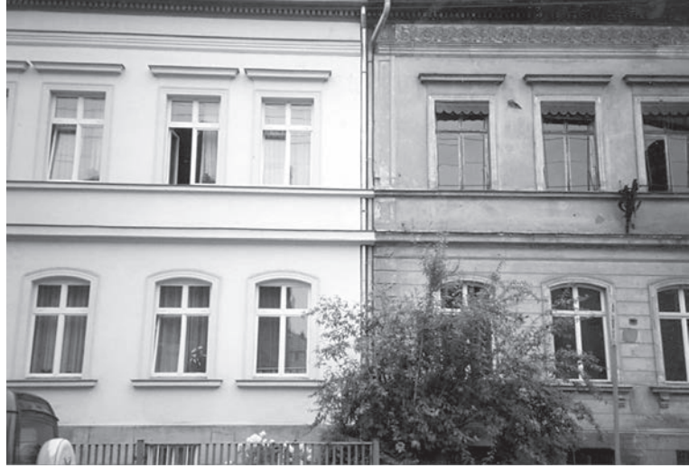
Figure 8.4a and b – Rudolstadt, 1994, houses

a divided society, one half of which scarcely seemed to matter, while the other half appeared to be fully in control.