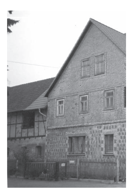
Figure 4.14 a and b – Houses in (the vicinity of) Rudolstadt, 1994

in the children's wear shop, for instance, who could have a seat in exchange for babies' nappies.