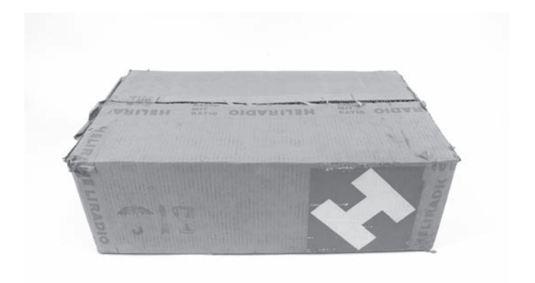
Figure 4.12 – Packing of a Heli-Radio reciever. Regular corrugated card board was used in combination with a tag showing the company's brand label. Heli-Radio, a private company until 1972, was famous for the professionally designed corporate design of the mid-1960s as well as for their functionalist radio designs. Undated, probably 1970s or 1980s

Besides quality, the appearance of most consumer goods also suffered from the poor economic circumstances, the director of Gera's Museum of Applied Arts explained, while showing me the museum's East German packaging and consumer goods collection. Going past the material remains of the old days, he repeatedly drew my attention to the poor and loveless appearance of the products. "And then always this serial production," he sighed, pointing to the drugstore products.