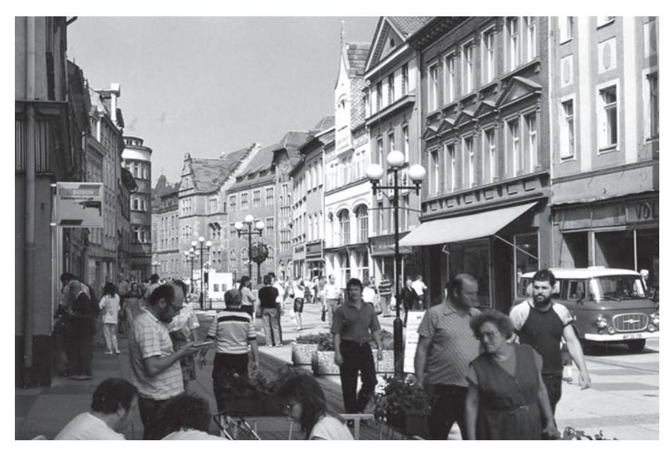
Figure 1 – Rudolstadt, 1994, main shopping street

looking world of the west came to be seen as the place of "fulfillment and ultimate arrival."