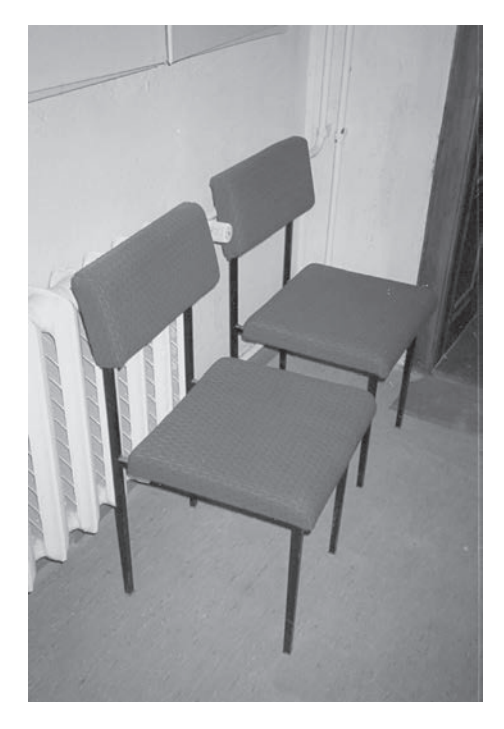
Figure 4.13 – Chairs in a waiting room in Rudolstadt, 1994

The GDR had insufficient financial resources to produce vibrantly colored paint, good paper, or a variety of packaging.<sup>35</sup> Sometimes the overall shortages were such that extreme measures were necessary. An inhabitant of a hamlet near Rudolstadt told me that one day, when the Soviet Union was unable to deliver the agreed amount of maize, the whole country was ordered to plant maize. Even the garden of the small local school did not grow anything but maize that year.