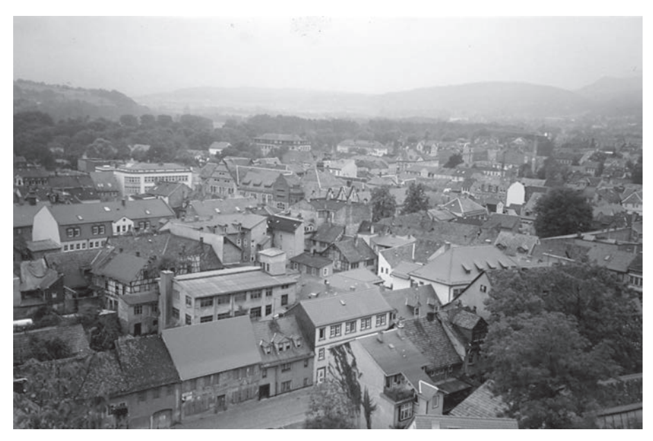
Figure 8.3 – Rudolstadt, 1994, the city as seen from the Heidecksburg (castle on Rudolstadt's hill)

differences were visible between the buildings and streets that had been renovated, and those that had not. Whereas some shops were identical to the shiny, garishly colored shopping paradises that overshadow the shopping streets in the west, others had not changed visibly in forty years. If you looked down from the castle that towers above Rudolstadt to the town below, you see a similar picture unfolding. Buildings that had obviously not been touched for forty years stood next to those that had recently been given a complete make-over. Similar contrasts between old and new, neglected and renovated were visible everywhere: at parking places and on motorways, where next to the shiny, brightly colored Mercedes and four-wheel drives, a great many old Trabants were still chugging along. Comparable differences could be seen in the interiors of houses and public areas. In chapter seven, I described the visible differences between the decoration and interior design of the houses that had undergone an entirely new refurbishment and those which showed no sign of having being changed in the past forty years. Whenever I visited people at their place of work, the same picture was evident; there was often a great contrast between the rooms where the managers worked and those that could be accessed by everyone or where subordinates worked. The differences in outward appearance were so obvious that people going to work everyday became aware of