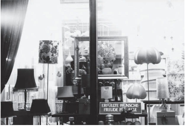
Figure 4.4 - Rudolstadt, 1994, pile of rubbish Figure 4.5 - Eisenhüttenstadt, Leninallee, lamp and electric appliances shop, undated, 1970s