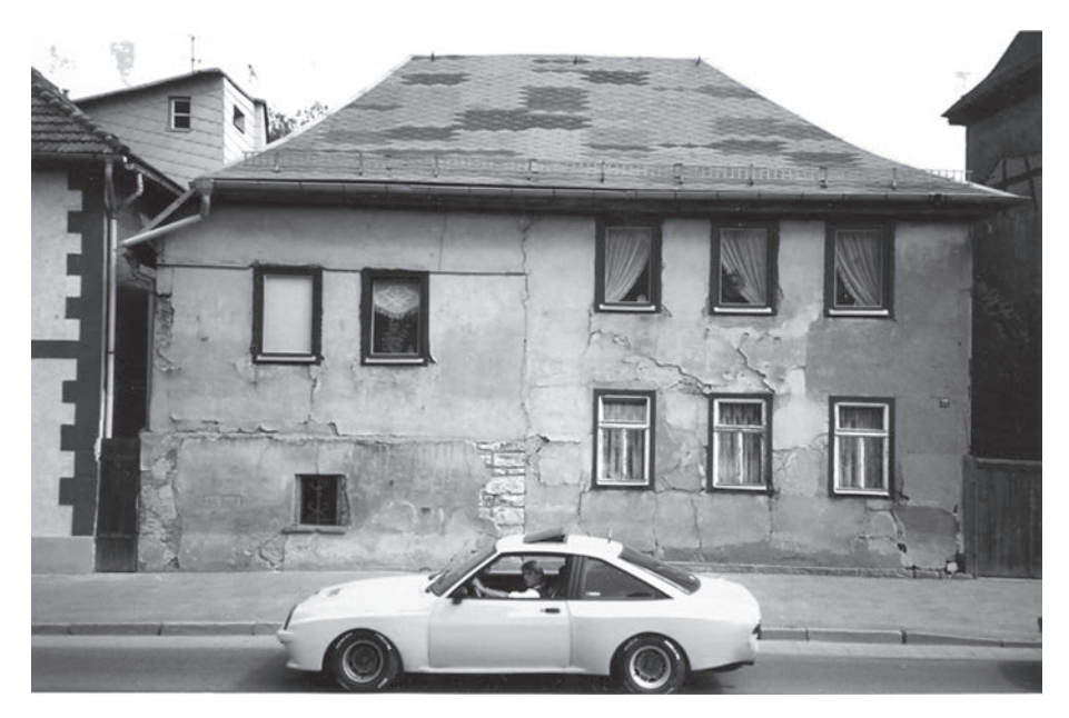
Figure 8.5 – Saalfeld (neighboring city, 6 miles away from Rudolstadt), 1994

the cheap lace blouses, plush animals, "crystal" glasses, bright flowery "porcelain" dinner services, "real leather" jackets for 10 DM, and jeans recommended as "real Live's Strauss [sic]: there is nothing more American."