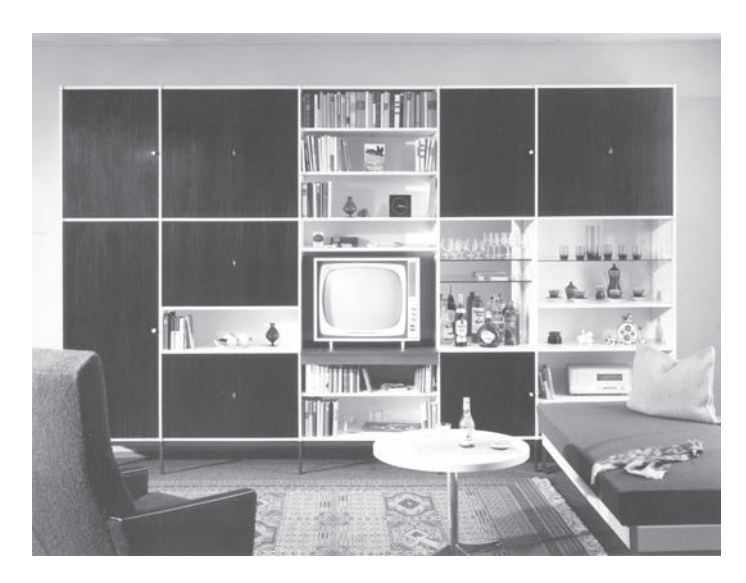
Figure 4.7 – East German living room, undated, late 1960s

In time, objects came to be merely recognized as parts of a larger whole, and the highest praise was reserved for objects that were perfectly able to "adjust – to an ensemble, an assortment, a collection, a kit, a room." Because it would not work to combine a straight bed with a curved cabinet, more and more object forms were adjusted to suit each other. The possibility to stack objects became a form quality in its own right, and ever more designers opted for straight, clear lines and forms, and for a neutral and plain color: grey.<sup>25</sup>