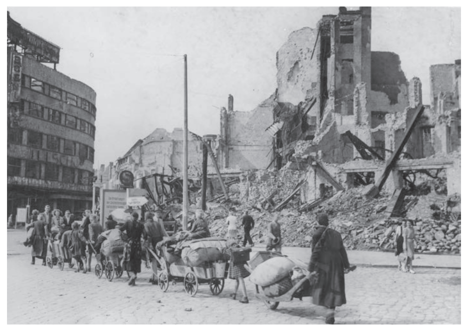
Figure 2.2 – Berlin, 1945, refugees