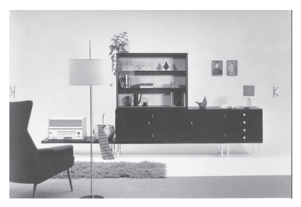
Figure 4.6 – East German living room, late 1960s

Uneconomically designed objects in general tended to overwhelm and belittle their users.<sup>21</sup> In time, a material culture of frugality developed in the GDR. Both for economic reasons and inspired by an idealistic search for honest forms in line with present-day reality, designers tried to find forms and objects that were little more than their function's packaging. Because an object's appearance had to be subordinate to the people who used it, the ideal form resembled a wrapping or cover. Then the object could show what it was meant for: for closing, sealing and covering (technical) functions.<sup>22</sup> This perspective gave rise to an economically inspired aesthetics.