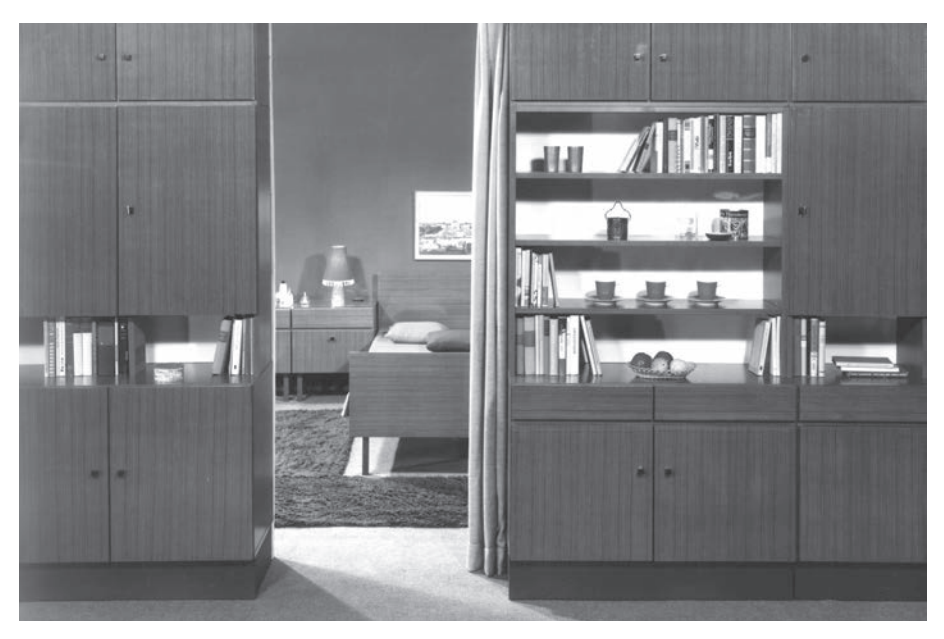
Figure 4.8 – Multiple room wall system 'Frankfurt,' undated, early 1970s