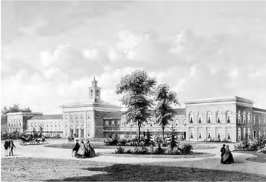
1. Meerenberg Asylum, 1861.