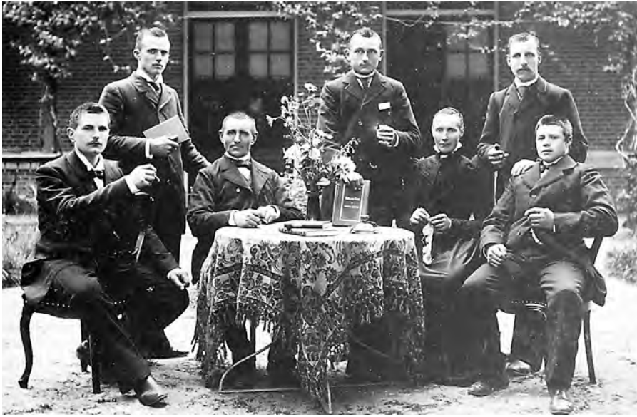
10. Pavilion father, mother, and five male nurses, Veldwijk Asylum, ca. 1890