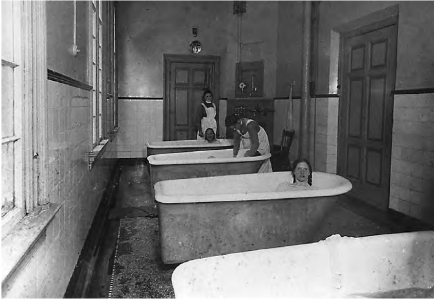
4. Patients and nurses in the department for prolonged bath treatment, Endegeest Asylum, 1907.

to calm and sedate a patient or to provoke a frightening, mental shock that would change a patient's train of thought. In the 1890s a new variation of hydrotherapy emerged: doctors began to prescribe hydrotherapeutic wrappings or wet packs. In this therapy, patients were wrapped in dry or wet sheets from top to toe, like a mummy, and then rolled in a blanket, either for short or extended periods of time. Wrapping a patient for fifteen minutes to two hours was often sufficient to calm them. However, if the goal of treatment was to control agitated behavior, the sheet could be applied for an entire night or longer – sometimes for days, with periodic changing of the sheets. 65 This therapy was widely used to sustain bed rest. Decubitus was a great risk, particularly because wrapped patients had to release their urine and feces, which caused the skin to break down. Moreover, patients wrapped in sheets were at risk of congestion because of a disturbance of the body's temperature regulation. 66