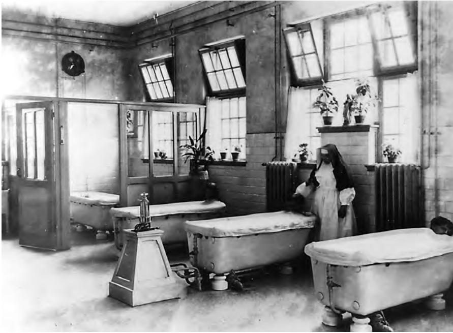
12. Female nurse attending patients receiving prolonged bath treatment, Voorburg Asylum, 1928.

ing the most capable sisters from training, only approving those who would consequently not be of much help to the physicians. 155