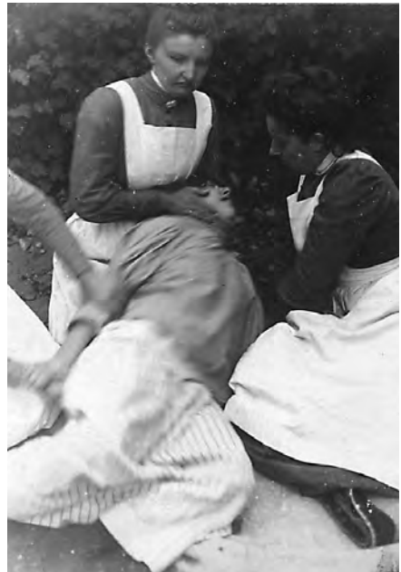
6. Three nurses attending a patient suffering an attack of hysteria, Pavilion III, Wilhelmina Gasthuis, Amsterdam, 1907.