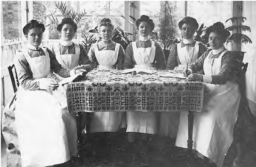
11. Female mental nurses at the Veldwijk Asylum, 1910.