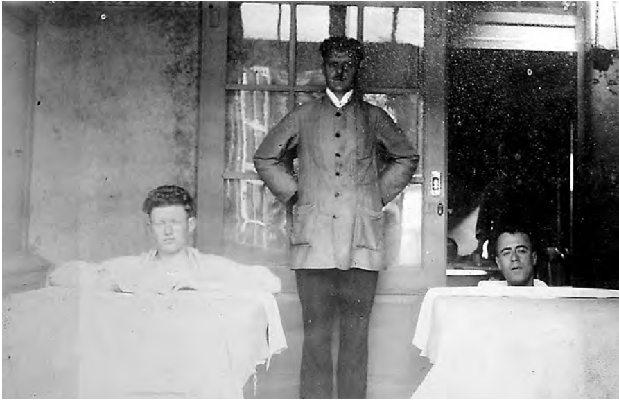
13. Male nurse attending patients receiving prolonged bath treatment, Meerenberg Asylum, ca. 1910.