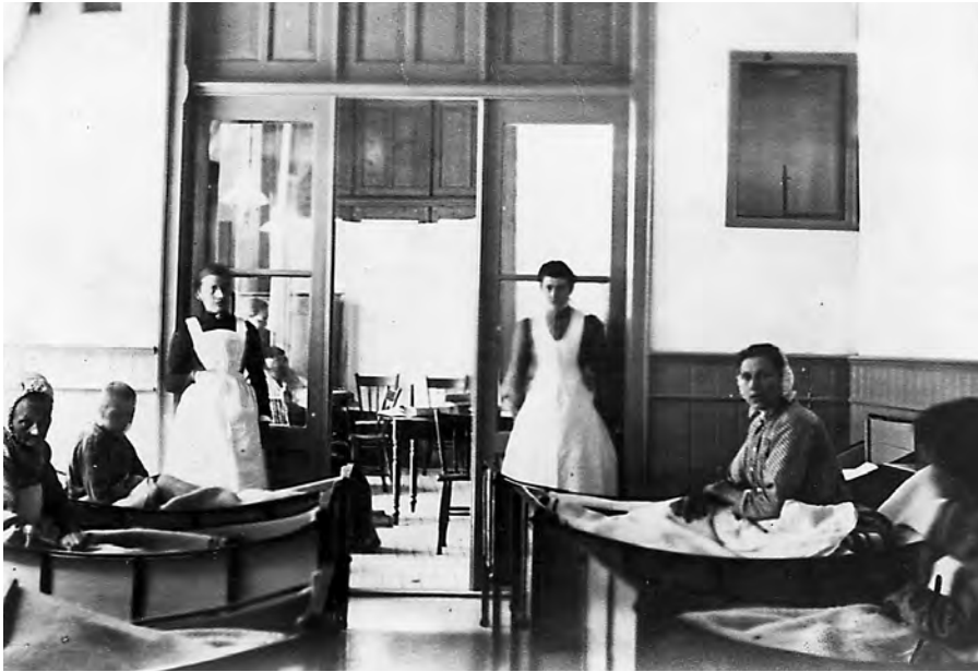
2. Patients on bed rest in the observation ward with two nurses. Female department at the Franeker Asylum, ca. 1900.

rooms as sick wards for bed rest. Likewise, bed rest was initiated in the wards on which disturbed patients were managed. In theory all patients could be treated with bed rest – including melancholic, manic, and disturbed patients as well as patients suffering from delirium or with epilepsy, paralysis, or imbecility – and thus remain on the ward rather than being put into isolation. According to Van Deventer, the antisocial behaviors diminished, and he also noted how traditional forms of coercion such as isolation in cells and the use of straitjackets and gloves were hardly used anymore. Single rooms were only used for very disturbed patients, preferably with an open door and only rarely in a final resort, did physicians order isolation in cells. 49