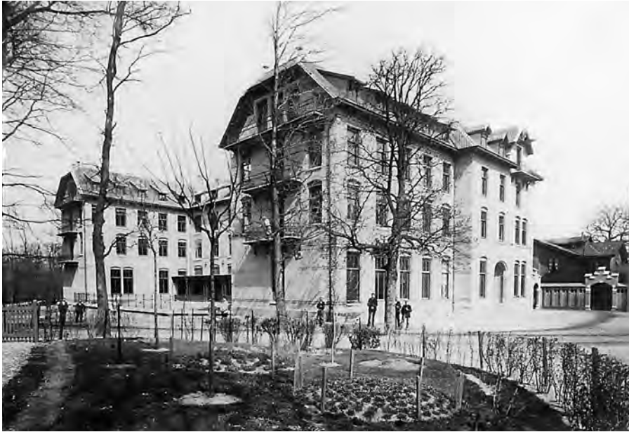
9. The Meerenberg nurses home for female mental nurses, Meerenberg Asylum, 1904

nurses. Living in was obligatory for nurses. Traditionally, attendants had shared their lives with patients and slept on the same wards. In Meerenberg, Van Deventer considered this situation to be inappropriate for the new female nurses. They obtained sleeping quarters separate from those of the patients, to provide them with proper rest and leisure. In 1898, a prestigious nurses home for female nurses was created. It illustrated the new status and prestige of the female nurse within Meerenberg. 33 Significantly, Van Deventer considered such measures unnecessary for male nurses; their sleeping quarters remained on the same wards as the patients' quarters. In 1904, Van Deventer's successor, Van Walsum, created a male nurses home for single male nurses. 34 Similarly, the new middle-class nurses in Franeker no longer slept on the patients' wards and were eventually given their own conversation room. 35