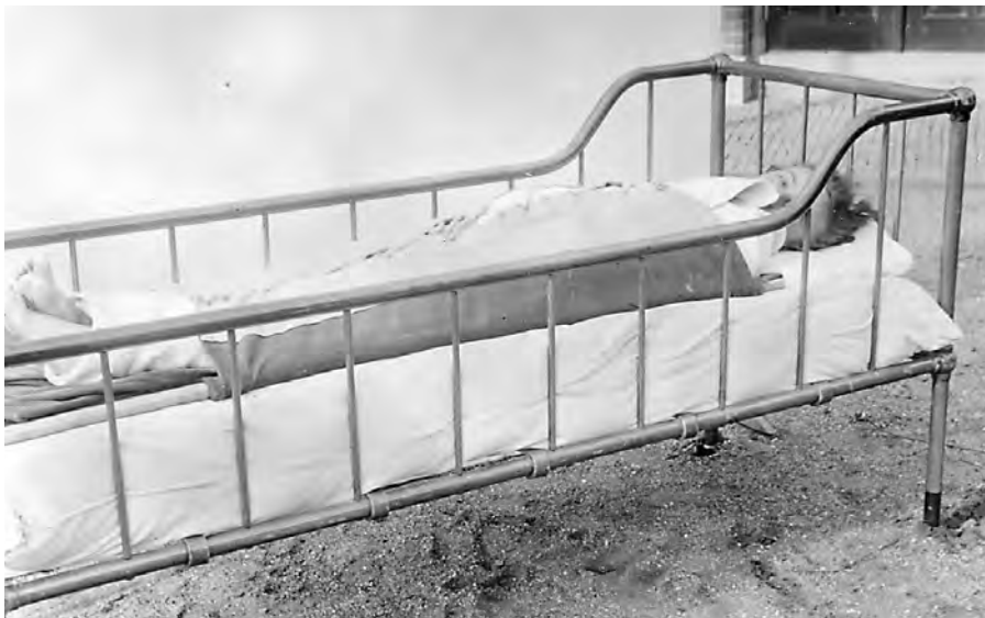
3. Patient in a hydrotherapeutic wet pack, Meerenberg Asylum, ca. 1900.

The therapeutic use of water has a long history in medical and psychiatric treatment. Warm or cold baths, sponge baths, and showers had been applied