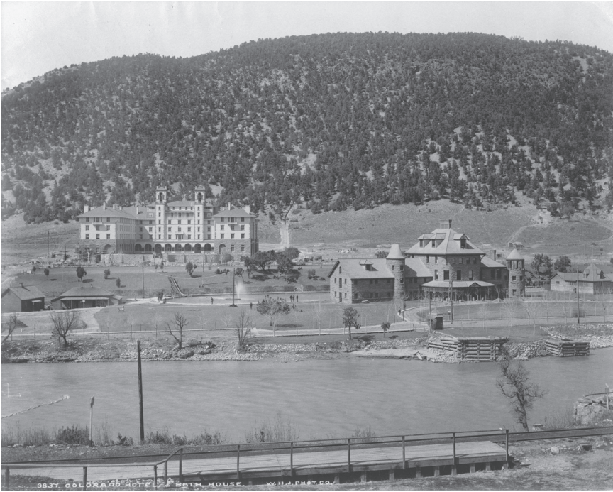
FIGURE 2.1. Railroads eagerly courted invalids, promising them health and rejuvenation in fine resorts throughout the West. While people debated whether the West's climate would be beneficial to Anglo-Americans generally, there was little debate about the vivifying effects of the West's climate on tuberculosis patients and others with debilitating ailments. View of the "Colorado" Hotel and hot springs bathhouse built by the Denver and Rio Grande Western Railway in Glenwood Springs.