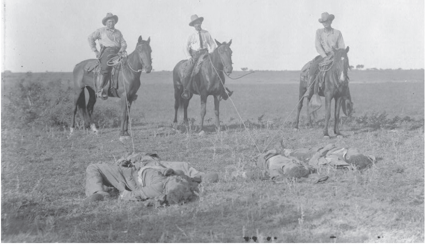
FIGURE 8.1. Texas Rangers with dead bandits, October 8, 1915. The famed Texas Rangers straddled more than the US-Mexico border. They also patrolled borders of race and ethnicity, protecting Anglo-American values from challenges by Hispanics, Indians, and African Americans. At no point did the challenge become greater than in the years of the Mexican Revolution, when the border became a very violent place. Their legacy as either gallant and fearless heroes or the tools of white supremacy continues to be contested today.

therefore turned to violence to solve the challenges posed by the presence of Indians and Tejanos in the republic/state.