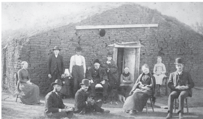
FIGURE 6.1. Attracted by climate and promises of cheap land, thousands of Northern European immigrants, like this group of Norwegian immigrants in front of a sod house near Madison, South Dakota, came to America for a better life. Railroads coveted and competed for these groups, believing their experience as farmers and their unquestionably white race made them ideal Americans.

of this population represented a massive and largely successful effort at social engineering.