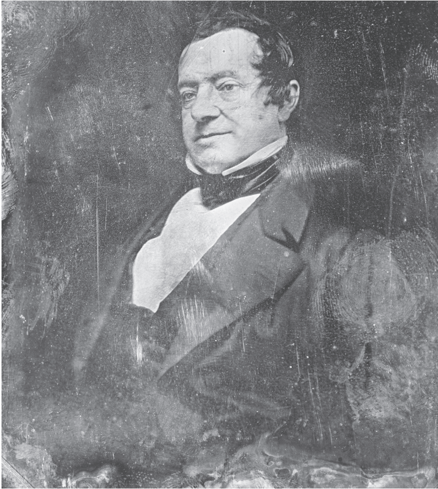
FIGURE 1.1. The writer Washington Irving, touring Indian Territory in the 1830s, warned that western expansion could lead to white racial decay. He worried that the vast spaces of the West could never truly be settled by Anglo-Americans and would instead be populated only by bloodthirsty Indians and outlaws. Within a decade, however, his uninhabitable plains would become the center of a continental nation.

the Arkansas River, a rope clenched in his teeth, while towing the rather effete writer in a makeshift raft), but Irving refused to see him as anything other than a “braggart and a liar of the first water.” 29 Applying his experience