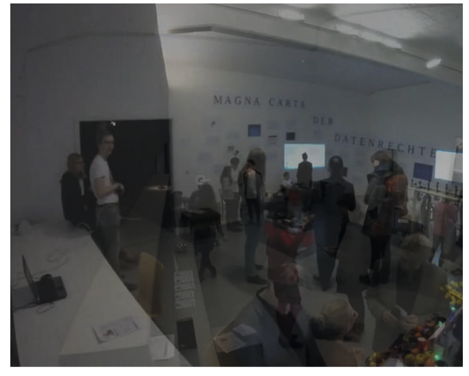
[Fig. 1] Exhibition: Dysfunctional Things. Photography: Martina Leeker & Laila Walter, Lüneburg 2016.

Interfaces, through which human agents gain access to technological environments, are important in digital cultures. Interfaces enable not just control of technological operations; they shape, through their design, the behavior of users. They are therefore a sensitive gateway to the technological worlds and models and regimes of human-machine interaction. The exhibition asks what would happen when, assuming a radical equality of things, interfaces are disrupted and cannot be thrown away? In this context, a workstation was created that had a defective computer mouse, which performed self-willed movements enabling the production of strange drawings.