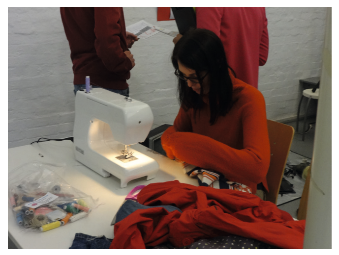
[Fig. 6] Exhibition: Dysfunctional Things. Project: Kleiderflüsternde Nähwerkstatt / Clothes Whispering Sewing Room (Nadine Teichmann). Photography: Martina Leeker & Laila Walter, Lüneburg 2016.

(1) The discourse-on-things and on techno-ecology were taken on seriously and experienced in an exaggerated manner. Nonknowledge and incomprehensibility generated by these discourses, which emerged from the complex agencies and the technological environments, became new possibilities of (non-) knowledge. This knowledge from non-knowledge, and its effects, were clear and concise in the "Kleiderflüsterin" (clothes whisperer). New levels and forms of sensibility were reached by listening to damaged clothes and hearing of their desire for repairs.