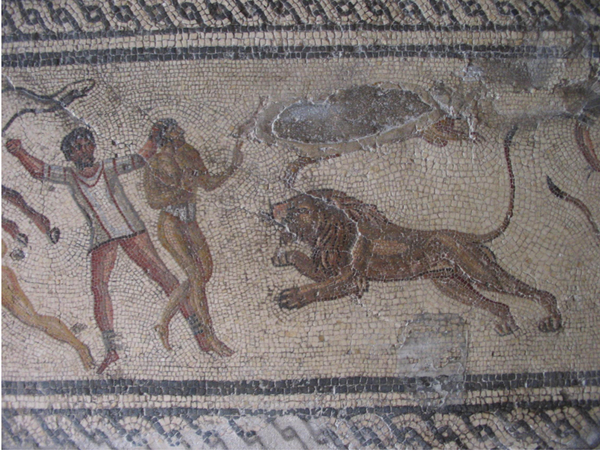
FIGURE 12.2B Zliten, Villa, mosaic of amphitheatre scenes: detail illustrating man pushed towards a lion

fugitive slaves, forgers, abductors, and murderers. 16 However, the representation of the barbarian type was more visually accessible: the viewer was able to recognise the barbarian origin of the figure depicted on the mosaic from a few stock details and immediately read his execution as the just punishment that members of the rebellious barbaric tribes deserved. Moreover, the figure of the barbarian as the more immediately recognisable type of non-Roman served to assure the house-owner and his wealthy guests that capital executions in the public were reserved only to non-Romans or Romans of inferior rank. Roman modes of punishment, in fact, were a matter of social status.