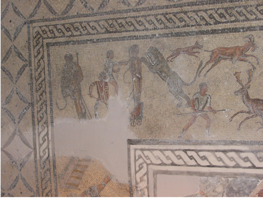
FIGURE 12.2A Zliten, Villa, mosaic of amphitheatre scenes: detail illustrating man tied to a stake and mauled by a leopard

trast to the pinkish-brown skin of the nearby gladiators and their passive position in contrast to the dynamic action of the surrounding figures (gladiators, venatores , and musicians, and indeed animals) visualise the social and moral distance between the Romans and the 'Other'. Ancient viewers of these two mosaics would have immediately recognised the convicted criminals as barbarian invaders who deserved to be subject to Roman justice for their attack against the Roman insiders. However, the representation of spectacular killing in the arena may have reminded the viewers of other types of criminals that were commonly executed during the shows in the amphitheatre for their being 'Other', not only barbarian outsiders but also home-grown criminals, that is, individuals who could not be integrated in the Roman social structures because they were did not accept and perform those values on which Roman morality and identity were.