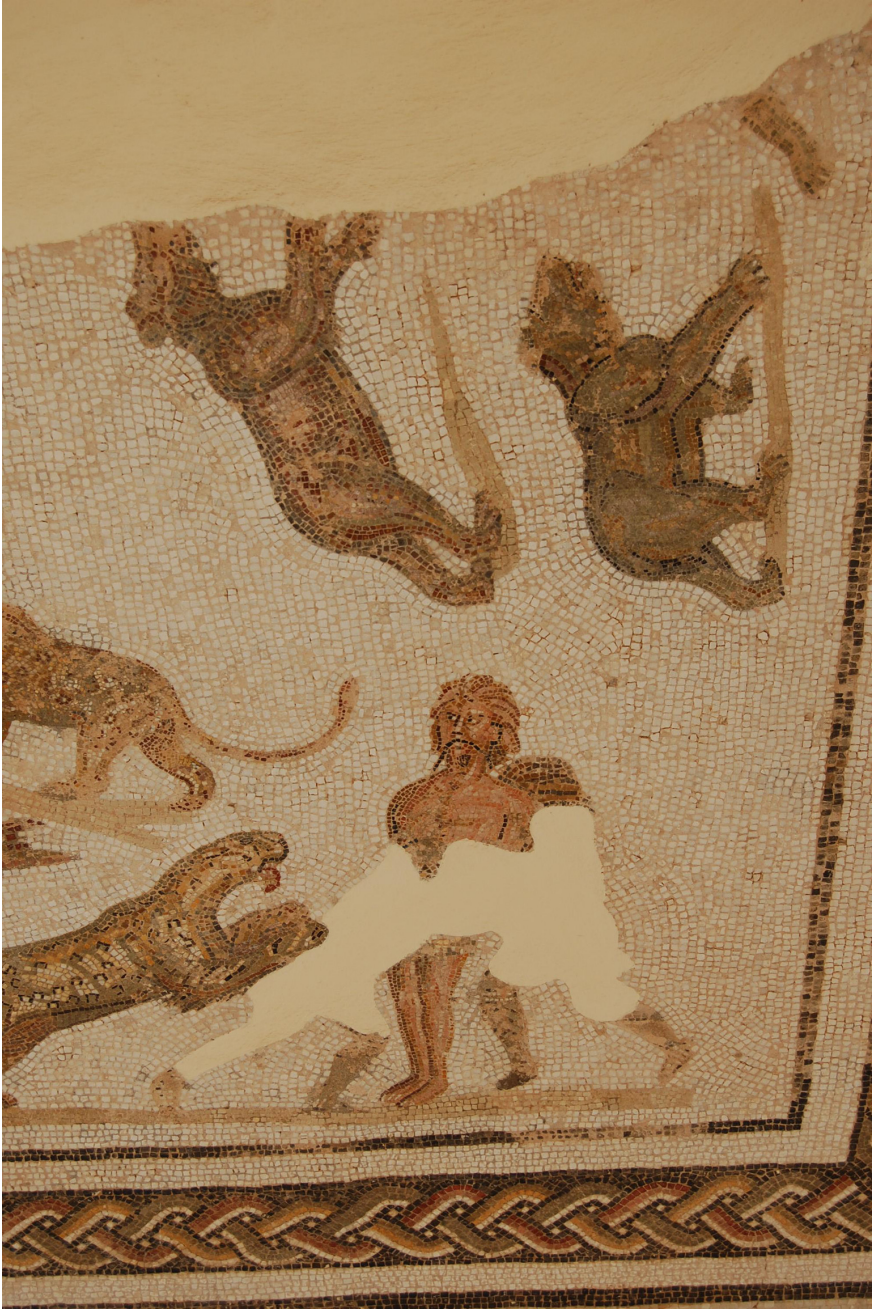
FIGURE 12.1A El Jem, Sollertian Domus, mosaic of amphitheatre scenes: at corners scenes of damnati ad bestias devoured by leopards