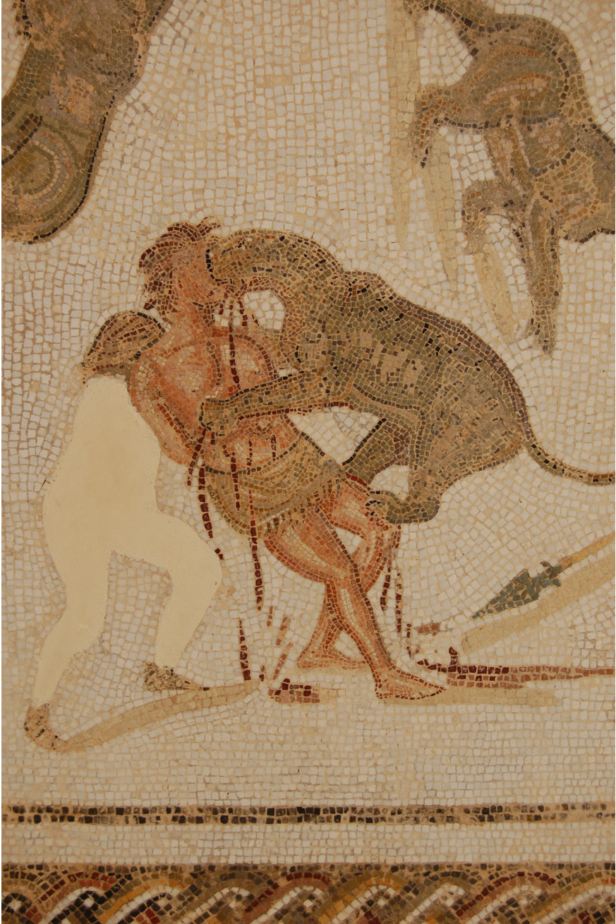
FIGURE 12.1B El Jem, Sollertiana Domus, mosaic of amphitheatre scenes: at corners scenes of damnati ad bestias being attacked by a leopard