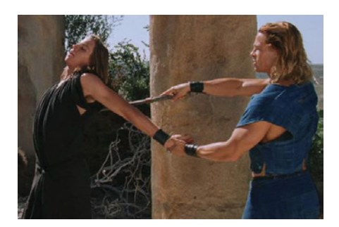
Figure 2 Achilles and Patroclus fighting.

Achilles: Patroclus, my cousin. Odysseus, king of Ithaca. Odysseus: Patroclus. I knew your parents well. Patroclus: I miss them. Odysseus: Now you have this one watching over you, eh? Patroclus: Learning from Achilles himself. Odysseus: Kings would kill for the honor.