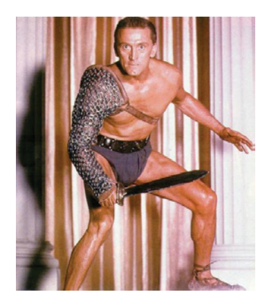
Figure 1 Kirk Douglas as Spartacus in Stanley Kubrick's Spartacus (studio photograph)

"the myth of antiquity" just as ancient cultures employed their myths as the stuff from which stories for the present were shaped.