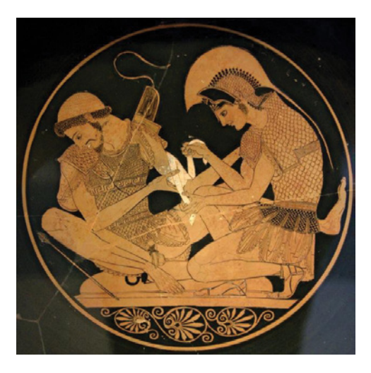
Figure 1 Achilles and Patroclus (Antikensammlung Berlin F2278).<sup>19</sup>

In Aeschylus' fragments the attractive thighs function as a pars pro toto for the beloved friends. A similar notion is represented in a painted bowl made in Greece around the year 500 BC – the very time when Aeschylus would have been writing the Myrmidons . The painting shows Achilles dressing the wounds of his friend: