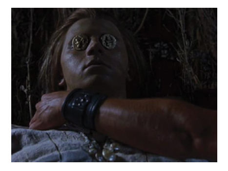
Figure 4 Achilles removes the seashell necklace from Patroclus' neck.