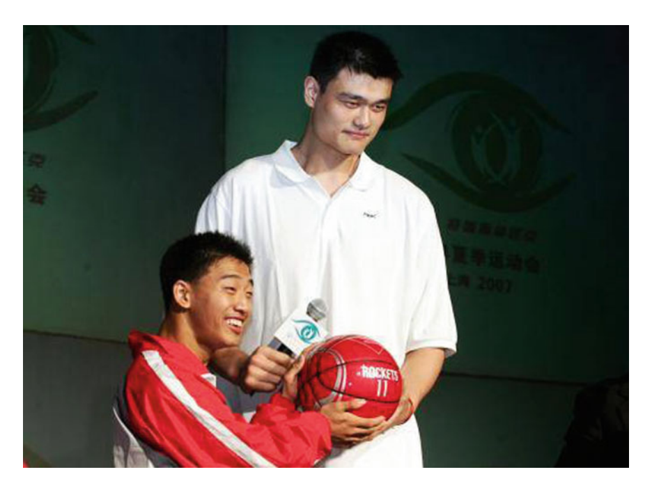
Fig. 1 Fangmiao Wu and NBA player, Ming Yao, 2006

Q: Wow, really nice. Just now we talked about going to Beijing to attend the press conference. Any details?