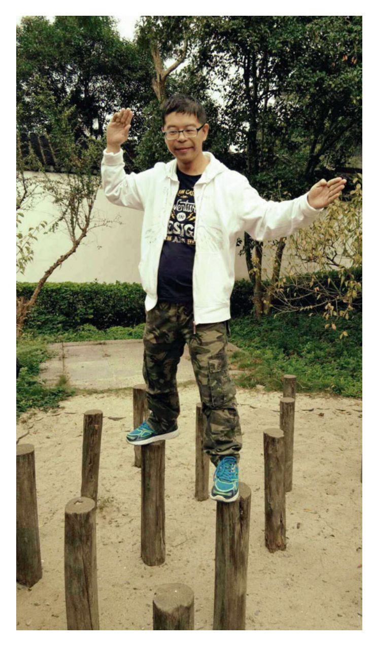
Fig. 1 Mr. C exercising on stakes