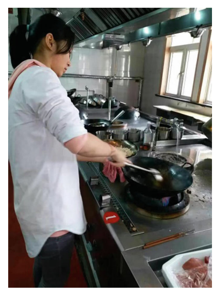
Fig. 2 Miss F in cooking class