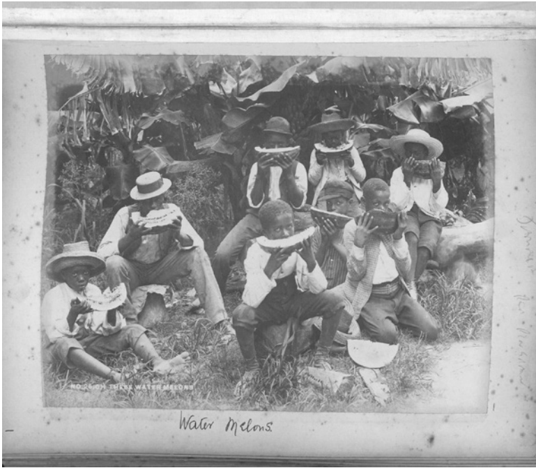
5 'These water melons', c.1860.

The second time I encountered the image was in the Bristol Museum gallery in a display on Empire through the Lens , a display of twenty-seven images describing the impact of the British Empire. This time, the image was accompanied by a reading by Anderson and Mortimer Evelyn (2019). They highlight the racist composition of the image but also argue that in these labourers 'look' is a recognition that they are being caricatured. Within this look, they argue, 'resides a testament to endurance'. The children's stare, which could be tiredness and exhaustion – as in my reading – is posed instead as oppositional. There is a knowing in this reading, one that suggests a subversion of the colonial masculine gaze and an excess of this regime of visibility which I initially saw as dominating and dehumanising.