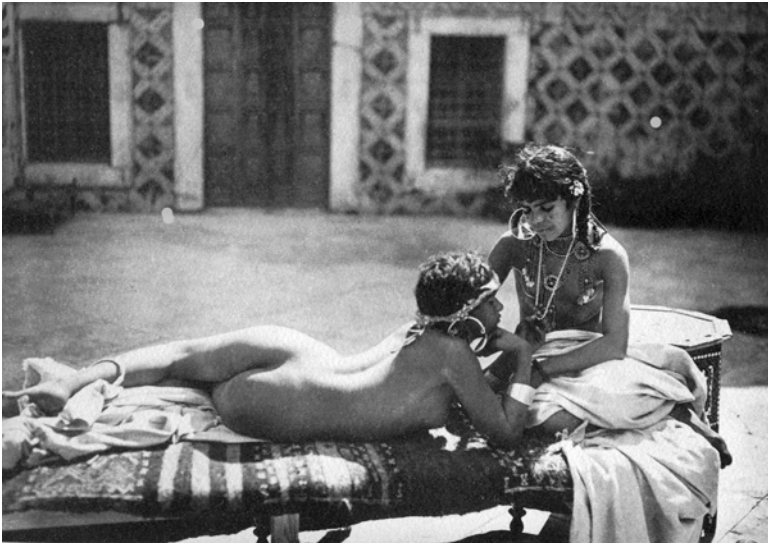
1 ‘In the harem’, Lehnert & Landrock postcard, 1900s–1910s

Said (1978) proposed that orientalism was a visual as well as textual regime. Colonial power required the construction ‘of a sort of Benthamite panopticon’ from whose watch-towers ‘the Orientalist surveys the Orient