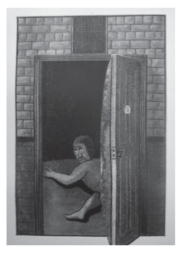
Fig. 3.5 James Scott's drawing of a seclusion room (James Scott, Sane in Asylum Walls [London: Fowler Wright, 1931], facing p. 102)