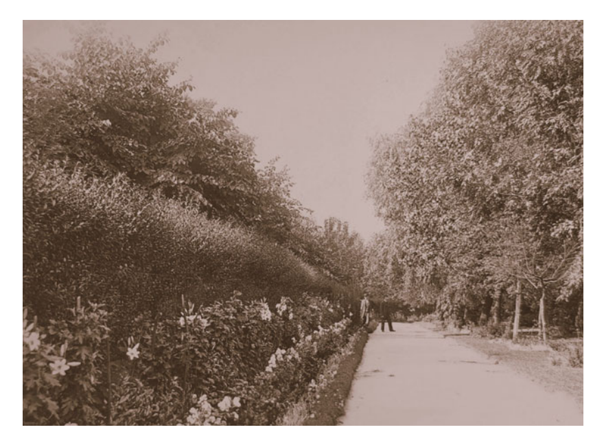
Fig. 6.1 Patients' garden at Claybury, before 1917

of the sexes".<sup>49</sup> Occasionally a sexual assault occurred, but those reported in minutes identified staff as perpetrators, not patients. One male staff member was sentenced to six months hard labour for a sexual assault on a woman patient.<sup>50</sup> This sort of offence reinforced the asylum authorities' determination to "prevent the association of the sexes" except under "complete and careful supervision".<sup>51</sup>