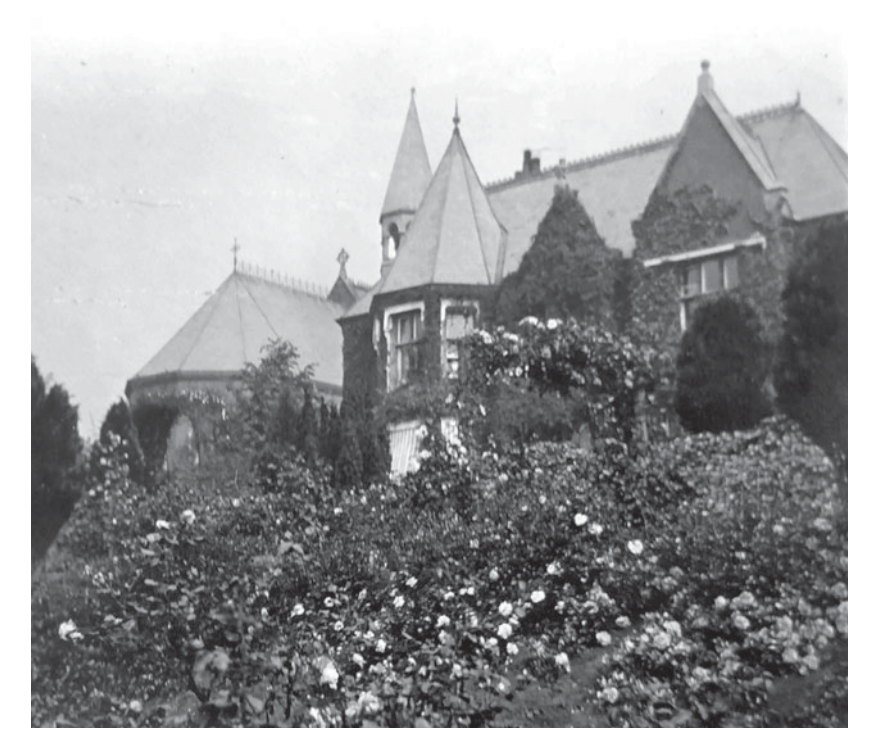
Fig. 4.1 The medical superintendent's house at Claybury, photographed from the rose garden, before 1917. The chapel is behind the house, to the left

of things as they are,' not of 'things as they should be'", in the words of Montagu Lomax, whose book about his wartime asylum work subsequently triggered the Cobb Inquiry into asylum practices.<sup>58</sup> With the risk of being dismissed for criticising the authorities, Lomax was aware that he had to take a difficult ethical decision: either to complain and risk being dismissed, or to continue to observe while part of the asylum system for long enough to write about his experiences at a later date.<sup>59</sup>