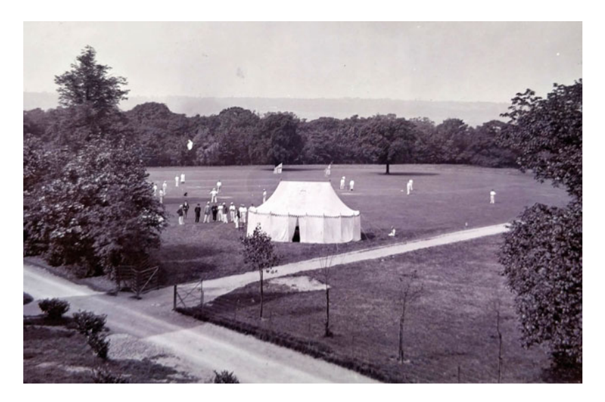
Fig. 5.1 Cricket pitch at Claybury, before 1917

Land usually used for recreation in asylums (Fig. 5.1) was ploughed