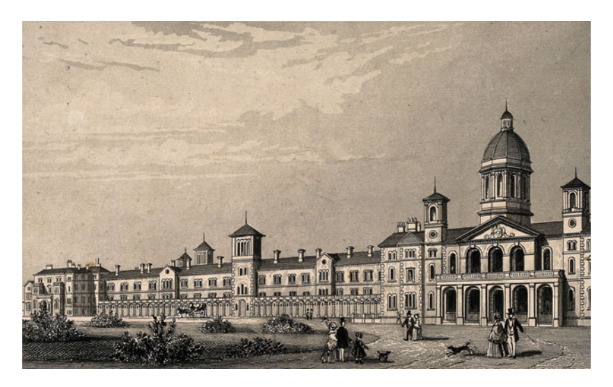
Fig. 1.2 Colney Hatch Lunatic Asylum, Southgate, Middlesex: panoramic view, undated

The architecture of the asylums, the palatial façade of Colney Hatch (Fig. 1.2) or the prison-like central towers at Hanwell (Fig. 1.3) were emblematic of the diversity of the asylums in terms of practices and