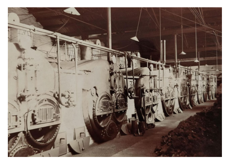
Fig. 6.7 "Claybury – making shells, 1915"

sustained a fracture when his arm caught in the hair-picking machine,<sup>190</sup> the device used to separate out different sorts of horsehair for stuffing mattresses. Laundry work was also dangerous: inadequate training before using the machinery, unhygienic processing of soiled linen, and lack of opportunity or encouragement for hand washing after handling it, all contributed.<sup>191</sup> Following Henrietta S's death in the laundry at Wake-field Asylum by scalding, the Board criticised the "persistent disregard" of laundry safety regulations.<sup>192</sup>