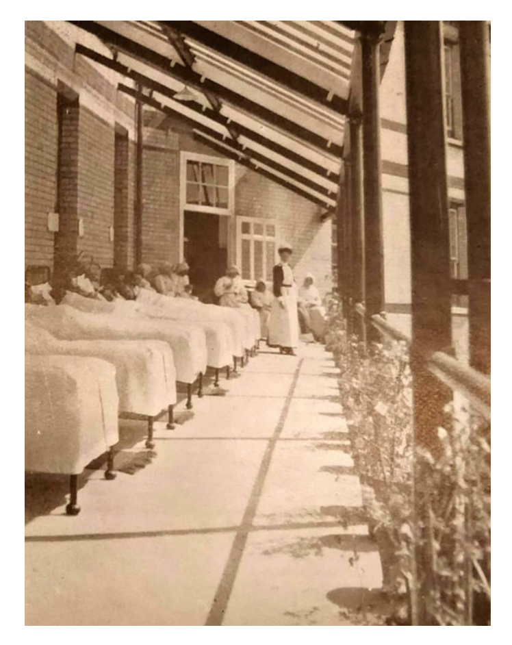
Fig. 7.1 Verandah for nursing patients with tuberculosis in the open air, at Horton Asylum. Given to Mott by the medical superintendent. Photographer unknown (Mott, "Tuberculosis in London County Asylums": opposite, p. 116)

during the war, the need to regularly weigh patients, as Crookshank and others had advised, but implementation varied.<sup>35</sup> Also in the war years, most experts recommended physical examination rather than X-ray screening to detect lung tuberculosis, but with medical staff shortages the standard three-monthly physical health checks for patients were abandoned, with the risk of overlooking new or emerging cases.<sup>36</sup>