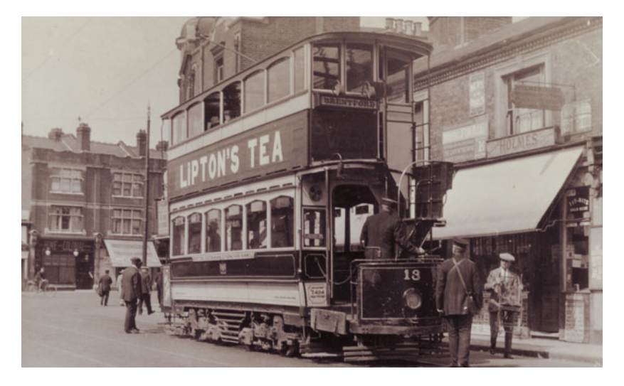
Fig. 6.2 Tram, a few minutes' walk from Hanwell Asylum c.1910

Since asylum activities were part of treatment, Mercier cautioned against punishing patients by preventing them from joining in, as participant, performer or spectator.<sup>55</sup> On the other hand, activities were used as rewards, such as tram outings to Uxbridge for working patients at Hanwell (Fig. 6.2).<sup>56</sup> Entertainment programmes continued as usual in the early months of the war, including the annual patients' fancy dress ball at Claybury and a Vaudeville show at Colney Hatch. By Christmas 1914, celebrations faced disruption because of night-time lighting restrictions and risk of cancelation at short notice in the event of an air raid