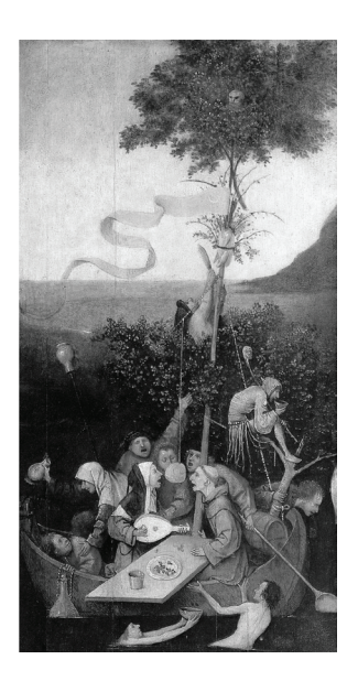
Fig. 1. Hieronymus Bosch, Ship of Fools (1490–1500)