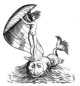
HIC SVNT MONSTRA