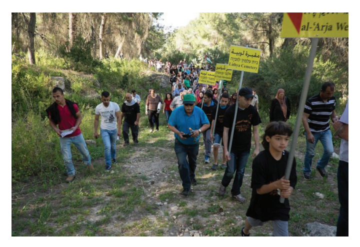
Fig. 1. Procession.

and that were recalled and re-inscribed through our movement, from one stop to another through the ruins of Lubya (fig. 1).