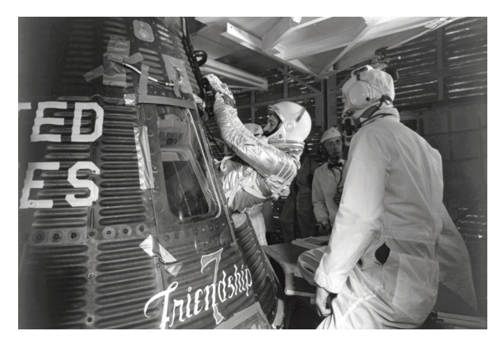
Fig. 1. Glenn enters Friendship 7, the capsule in the Mercury-Atlas 6 spaceflight (1962).

The textual form that fits these thoughts best and can grasp the cacophony around the memory of the Mercury-Atlas 6 rocket in the space of this chapter is the list. We thus chose to first offer a provisional list and will return at the end of the chapter to reflect on where this list takes us, politically, ethically, methodically, joyfully, multidirectionally, and, and, and.<sup>18</sup>