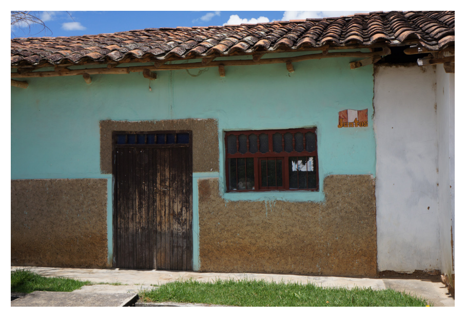
FIGURE 16. Shadow condition 1: A painted Juntos flag signals that recipients of social assistance live here.

a variable combination of the following: attending meetings; growing a garden ( biohuerta ); giving birth in a health clinic; keeping hygiene instruments (toothbrush, soap) organized; cooking for the school lunch program, Qali Warma; having a latrine; using the state day care, Cuna Más; participating in political parades and parades for local cultural events; painting the Juntos flag on the outside of their house (figure 16); contributing to the medical costs of a neighbor's broken leg; using a cocina mejorada (smokeless stove); attending hygiene trainings; participating in a regional cooking fair; attending a literacy workshop, and "doing whatever the [local manager] tells me to."<sup>3</sup>