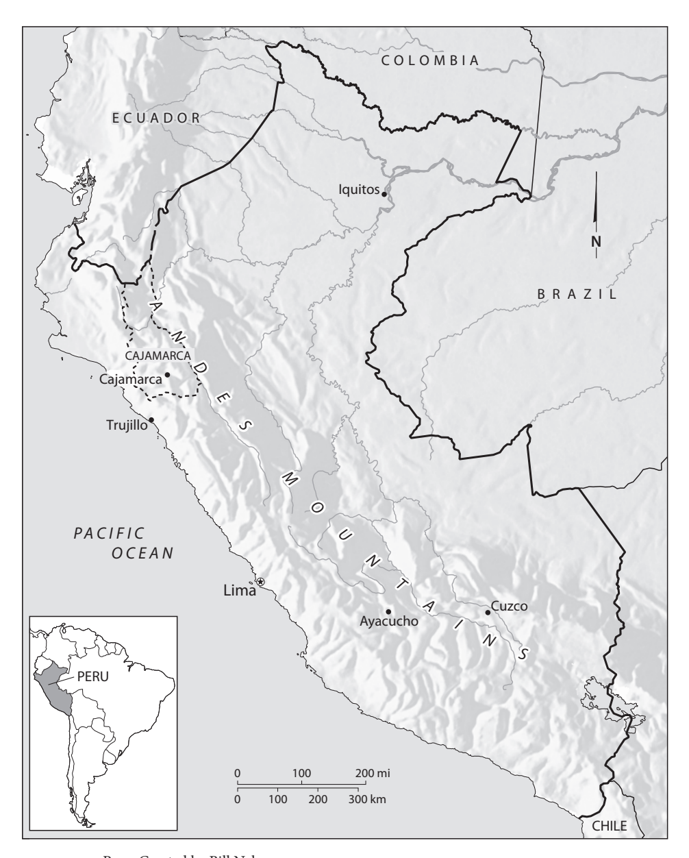
MAP 1. Peru. Created by Bill Nelson.