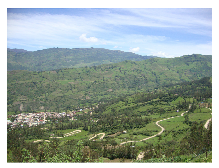
FIGURE 3. Villages where Juntos recipients lived were often connected to the services in larger populated centers by a single road or by footpaths.

nutrition, corresponding to full exercise of their citizenship, and to improve their quality of life and human capital development, thereby reducing the intergenerational transfer of poverty" (Juntos 2015a). Juntos is meant to achieve this vision through two central functions. The first is through the direct transfer of monetary incentives to poor households in rural areas. The second is through use of conditions related to accessing health and education services (MIDIS 2012c). The policy-making and centralized administrative functions of Juntos take place in Lima, either at program headquarters or within the Ministry of Development and Social Inclusion, where Juntos has been housed since 2012.