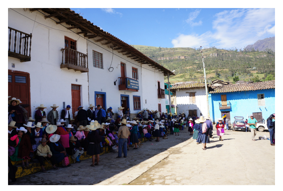
FIGURE 8. Waiting.

skirts distinguish them from the handful of state and municipal employees in Western-style jeans and windproof jackets. A bright blue armored Hermes truck is parked out front, and a uniformed armed guard stands by. It carried the Juntos payments up into the mountains [figure 9]. Other than the municipal authorities, entrepreneurs, and security guards, there are very few men around. Large white posters labeled "Juntos Current Registry" are fixed to the wall on either side of the municipality doors. The registry lists the first name and surname, identity document, village, and institutional identification number of every Juntos recipient [figure 10]. The door to the municipality remains shut, and municipal employees stand guard. Local managers give queuing mothers paper tickets that will eventually allow them to enter the hall in small groups. It is hot, bright, and chaotic; every time a group of mothers is allowed through the doors, there is a lot of pushing and shoving, and the local managers yell: "Understand! There is nowhere to sit!" and "Get in line!" The queues are patrolled by a vigilant female municipal worker in Western dress who informs local managers when she notices a mother cut in line. As they enter the building, mothers are filmed by a male security guard who points the camera at them and tells them to remove their sombreros.