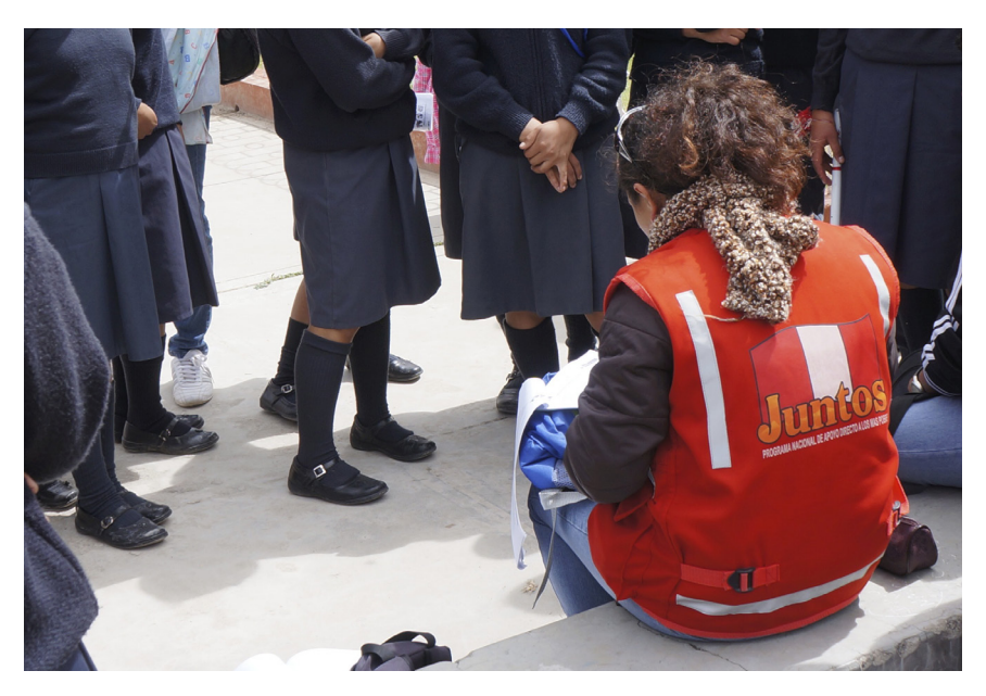
FIGURE 13. Monitoring conditions in education.

Local managers deployed a number of creative strategies in order to accomplish this mass-processing. When staff at clinics and schools did not cooperate in producing the attendance records and medical records that local managers required, the local managers worked around them. For example at a high school in Santa Ana District, the school administrator was upset that her own children did not qualify for Juntos. As a result, she refused to facilitate the local manager's monitoring work. In response, the local manager deployed what other local managers confirmed was a common strategy—soliciting the attendance information from the students themselves. On one such instance, I observed the local manager ask a small group of students in the school courtyard to summon their peers, and we sat on a bench and waited for them to crowd around us. The local manager pulled the large paper verification-of-coresponsibility forms from her backpack and, taking up a pencil, proceeded to call out the students' names one by one (figure 13). She operated methodically. After calling out a name, she would wait for the students gathered around us to confirm whether that individual was enrolled and attending class. Depending on their response, she would check "yes" or "no" in the corresponding box.