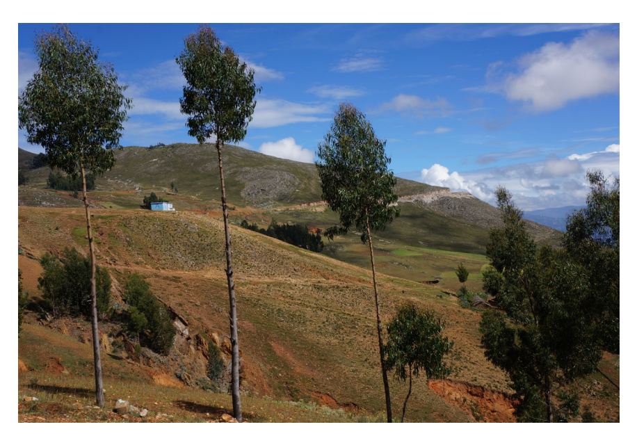
FIGURE 2. Public services do not reach all Andean households.

poorest regions in the country. While Cajamarca city has benefited from a new private health clinic and international school, these perks are largely accessible only to the families of mine employees and those in the city who have in some way profited off the mine's existence. I attended the health clinic as a patient once, but none of the Juntos mothers who participated in my study were able to, owing to their low incomes and lack of health insurance.