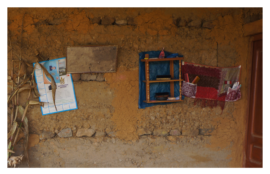
FIGURE 18. Shadow condition 3: Keeping hygiene instruments organized (note the Juntos flag).

the schedule upon which the monitoring would occur. When I asked mothers what tidy meant, they usually said that it meant "not dirty," and that they housed their small animals outside of the sleeping quarters. This was not always a simple task, because many houses consisted of only one or two rooms. Women raised small animals like cuyes, chickens, and rabbits to feed their families or sell at the market. They were valuable and had to be protected against cold, loss, and theft.