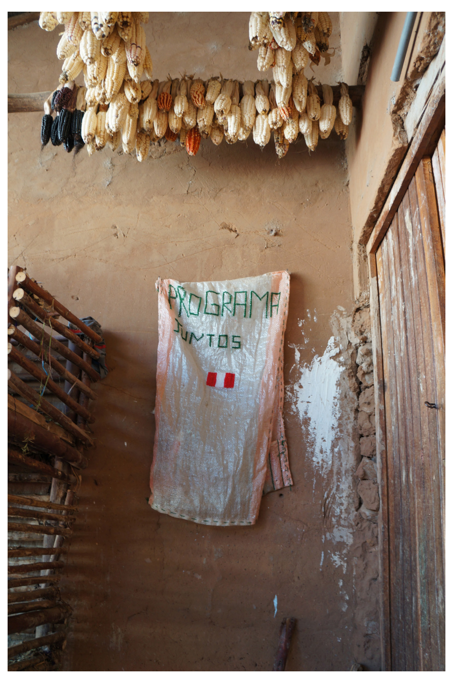
FIGURE 17. Shadow condition 2: Producing handicrafts.