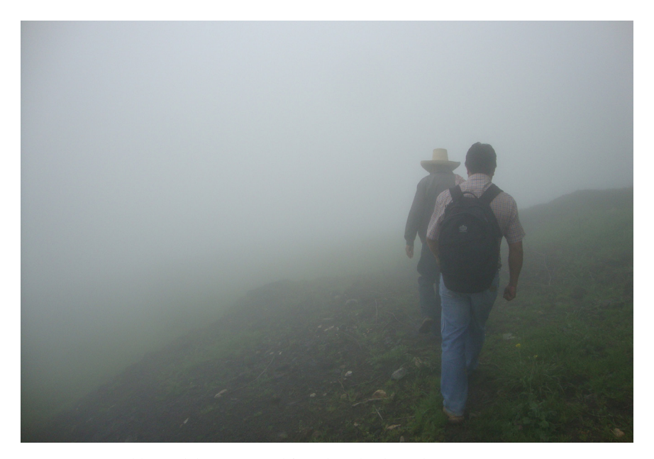
FIGURE 7. A sudden and dense seasonal fog.

hours. The meeting itself lasted just shy of three hours. At its close, the local manager and I exited the small, electricity-less community building into a fog so dense it was impossible to see three feet ahead. The mountains, the district capital below, and the house a short way down the hill had all disappeared, entirely whitewashed by the weather. The fog was disorienting. It had become impossible for the local manager and me to successfully (not to mention safely) make our way down the mountain on our own. Cliffs, streams, and animals were unidentifiable until you were already upon them. The teniente (village lieutenant, or elected chief) offered to lead us. I recall at one point stumbling into the path of a large bull, whose presence and proximity I was made aware of only through its arresting moo (figure 7).