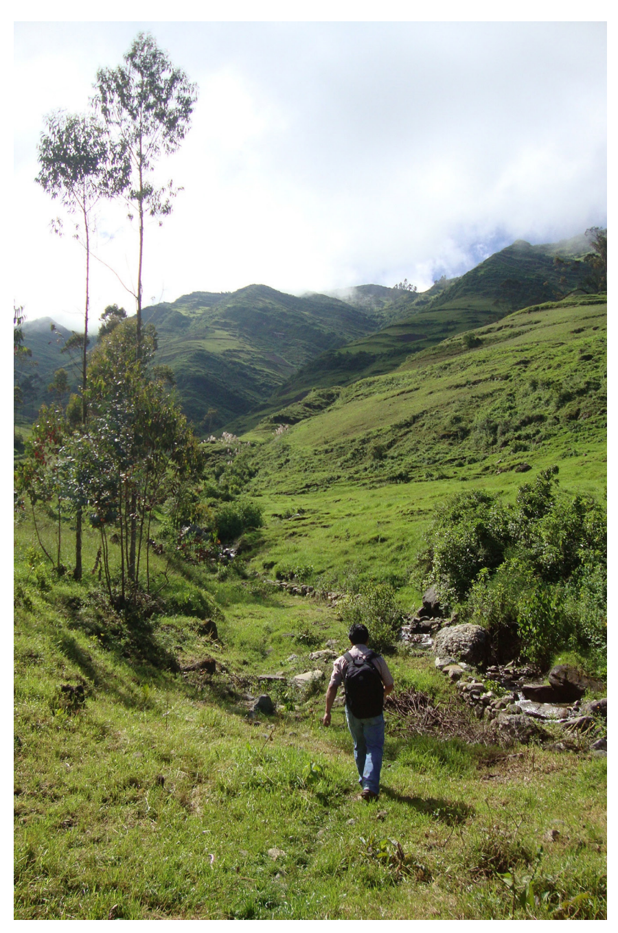
FIGURE 6. Local manager Paulino ascends the hill on foot.