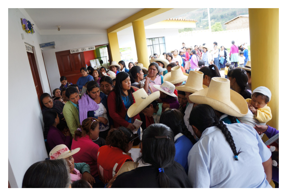
FIGURE 12. Juntos recipients "managing up."

for local managers to summon women to a central health clinic or municipal office, where local managers would fill out the coresponsibility forms on the spot. Such strategies, while helping local managers meet their own professional responsibilities, wasted women's time. The following vignette describes a scenario in which mothers were required to manage up. Over the course of two and a half ten-hour days, Juntos mothers queued in the courtyard of the health clinic in the district capital of Santa Ana. Directed by their Mother Leaders, who had been instructed by the local managers, to walk down to the clinic, women collected their medical histories from inside the building and stood waiting for the two local managers to input their information into the large coresponsibility forms (figure 12).