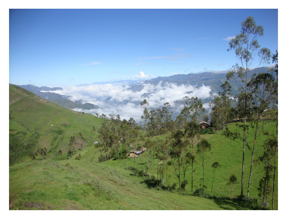
FIGURE 5. It was a three-hour walk to reach the health clinic in the valley below.

extensive and significant, even if they are largely unpaid. Fulfilling the conditions Juntos imposed upon them constituted additional hours of labor. The time women wasted attempting to meet program conditions was time reallocated from subsistence agriculture, tending flocks, caring for sick and elderly dependents, helping children with schoolwork, or engaging in economically productive activities. These largely caring activities not only buffer families' experiences of acute poverty but also contribute to building and maintaining human capital—Juntos' explicit aim. The irony, and tragedy, of this situation was that CCTs were deployed to organize women's caring labor in a way that development experts—who do not share rural women's predicaments—deemed preferable to women's own arrangements.