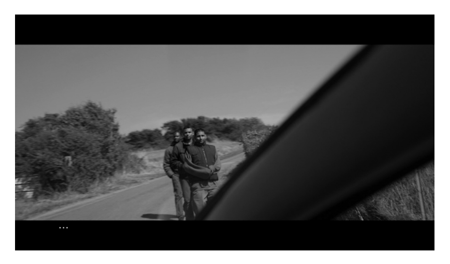
Figure 12.1 Returning the look: the police car transporting Ève and Corinne skirts another group of migrants in Coincoin et les z'inhumains (2018)

This brief, silent, accidental, mutual (non-)encounter between migrants and queers is over before it has even begun, yet Corinne is moved to give