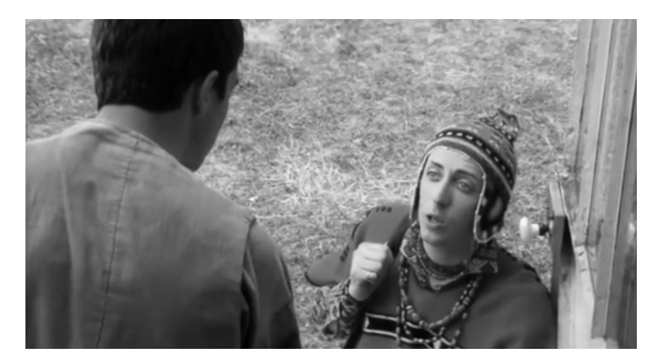
Figure 3.2 Chouchou (Gad Elmaleh) arriving in Paris in Chouchou (2003) Source: Chouchou (2003), directed by Merzak Allouache © France 2 Cinéma, Fechner Productions, KS2 Productions, and Warner Home Video France (2002).