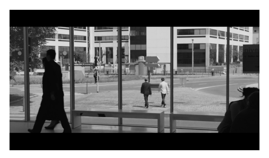
Figure 8.4 Daniel (Olivier Rabourdin) and Marek/Rouslan (Kirill Emelyanov) leaving the courthouse in Eastern Boys (2013)