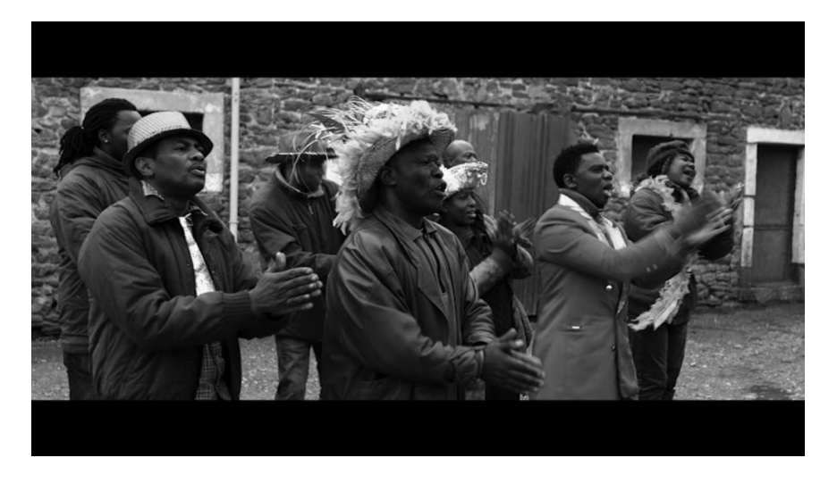
Figure 12.5 Coming together in song in the final, all-encompassing procession of Coincoin et les z'inhumains (2018)

of togetherness and reconciliation sweeping everyone up in the warmth of human song. Such an impromptu celebration of human emotion and oneness through mutual difference (social, racial, cultural, sexual) is arguably for Dumont the only really valid form of identity. The vortex of human movement gradually starts to empty itself out at the end, directly resisting expectations of narrative closure and political recuperation – an impression sealed by the final, random shot (confected by CGI) of a seagull smashing directly into the camera with a desublimating splat. Hence, fixed notions and preconceptions, not just of migrancy and non-normative sexuality but also of nationhood and Frenchness, are thrown into the air and temporarily shattered in the alienated territory of the Pas-de-Calais, revealed now in the summer light as a transcultural, carnivalesque, queer space beyond identity.<sup>13</sup>