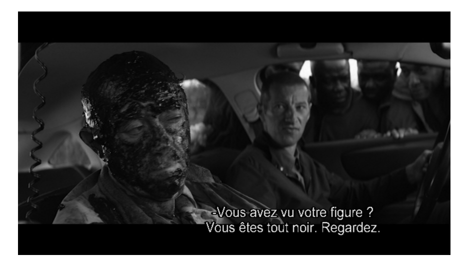
Figure 12.3 'Have you seen your face? You're all black, look!': Carpentier to Van der Weyden while surrounded by migrants in Coincoin et les z'inhumains (2018)

Source: Coincoin et les z'inhumains (2018), directed by Bruno Dumont © Taos Films/Arte Editions, and Blaq Out (2018).