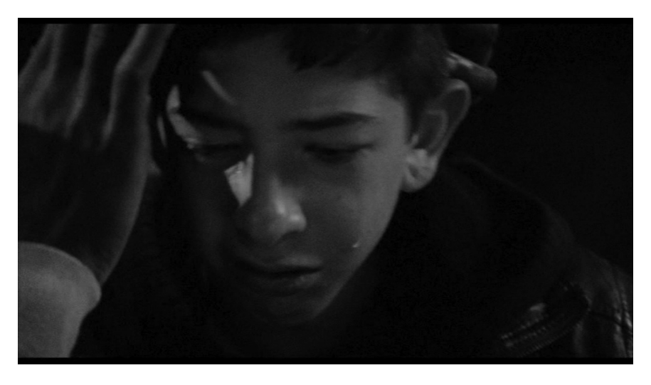
Figure 13.2 Aviya's hand, Pio's tears, in A Ciambra (2017) Source: A Ciambra (2017), directed by Jonas Carpignano © Stayblack, RT Features, Rai Cinema, Sikelia Productions, and Academy Two (Italy) (2017).

into male adulthood. The camera dwells on Pio's face as the white prostitute performs oral sex. The film's subsequent and concluding sequence sees Pio welcomed into the space of adult men and leaving behind the women and children, no longer stuck in the marginal, queer space in-between. While this experience symbolically marks Pio's entry into normative adult masculinity, it also recalls a very brief scene in Mediterranea when Ayiva sees one of his black female friends performing oral sex on a white man. A relaxed social evening had been interrupted by the arrival of white Italian criminals who force the women to leave. Visibly uncomfortable, Ayiva and some of the other men decide to go. Their disempowerment is confirmed by his fleeting glimpse of his friend. Their common subjection to the prejudicial logics of race and citizenship is palpable through the interstices of this queer optic.