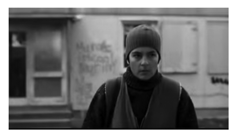
Figure 3.1 Fariba/Siamak (Jasmin Tabatabai) in Fremde Haut/Unveiled (2005)

the German 'fremde Haut' signifies 'in orbit', a term that is also used in the U.N.'s description of asylum seekers. Jack Halberstam elaborates: 'Asylum seekers are spoken about as "fremde Haut" or "in orbit"... because they can actually find legal domicile nowhere at all.... [T]his notion, of asylum seekers as "in orbit", as lost in space or in perpetual motion frames the film quite differently than the English title' (Halberstam 2012: 349–50). The title's reduction to 'unveiled' obscures the double meaning of 'fremde Haut', which emphasises the film's thematic threads: the body – the skin – as well as the perpetual motion, in-betweenness, and transition of the main character.