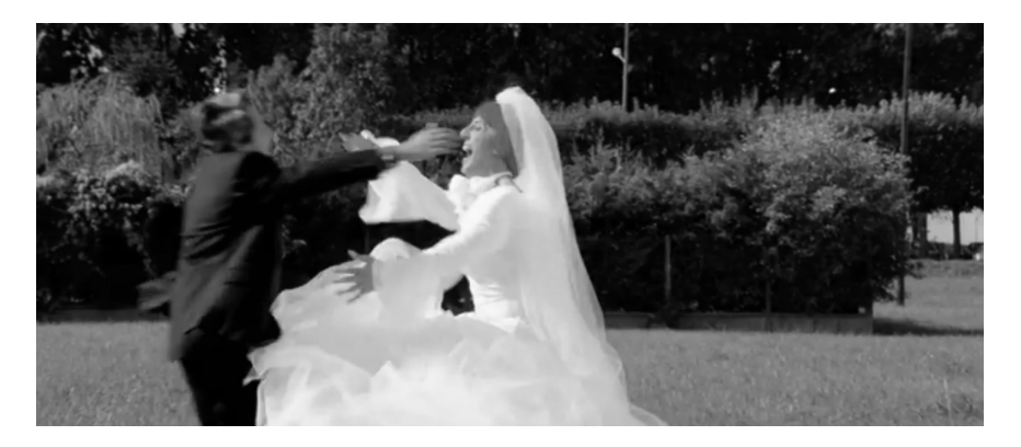
Figure 3.3 Marriage of Chouchou (Gad Elmaleh) and Stanislas (Alain Chabat) in Chouchou (2003)

Source: Chouchou (2003), directed by Merzak Allouache © France 2 Cinéma, Fechner Productions, KS2 Productions, and Warner Home Video France (2002).