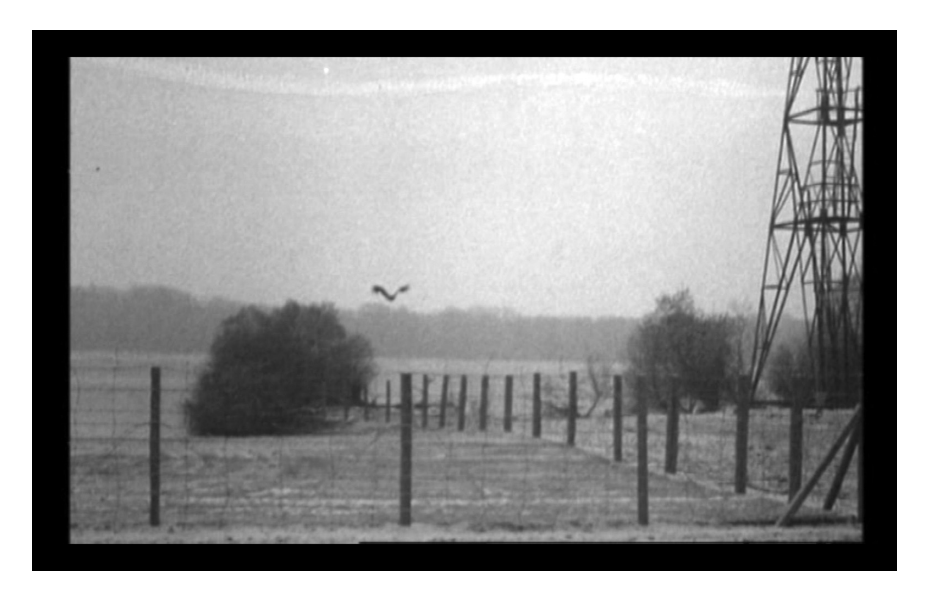
Figure 7.1 Flying towards the imaginary West in Another Way (1982) Source: Another Way (1982), directed by Károly Makk © Mafilm Dialog, and Connoisseur/Meridian Films.

In isolation, the fantasy of the West can only be constructed through inference: the real West is unknown, but if this (Eastern Europe, Hungary) is not the West, then it must be just the opposite. These two components in the film attribute the fantasy of the West with rights, freedom, and truth. First, the policemen should not have the right to treat Éva abusively, but they do – so they would not be authorised to proceed in such a manner in the West. It would be her, the queer woman, who would possess basic human rights. Second, the barbed wire on the border marks the freedom lacking (of mobility, choice, sexuality, speech, etc.), so there must be a lack of barbed wires in the Western dreamland. Part of the opening and closing montage is a bird symbolically flying across the Iron Curtain – as opposed to Éva's motionless dead body – fortifying the freedom of the land beyond. Third, truth (be that sexual or political truth) being silenced in 1958 Hungary is a central issue of