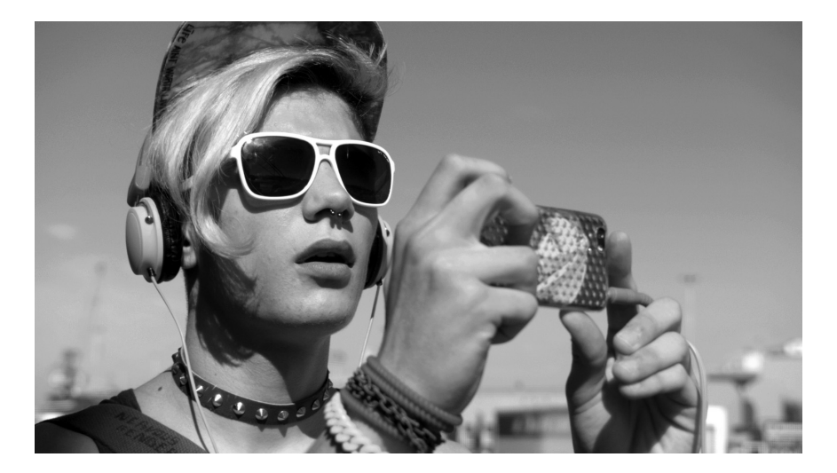
Figure 10.1 Dany (Kostas Nikouli) watches, and photoshops, as he is being watched walking around Athens in Xenia (2014)