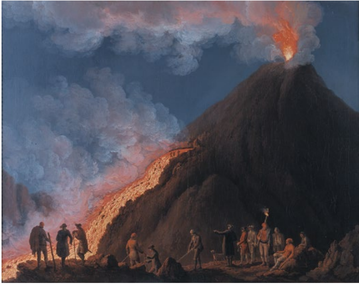
Figure 4.5. Jakob Philipp Hackert, 'An Eruption of Vesuvius in 1774,' (Neg. Nr. M10111, c.1774-5).