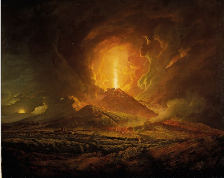
Figure 4.1. Joseph Wright of Derby, 'Vesuvius from Portici' (97.29, c.1774–6).

Courtesy of the Huntington Library, Art Collections and Botanical Gardens, San Marino, California. Purchased with funds from the Frances Crandall Dyke Bequest.