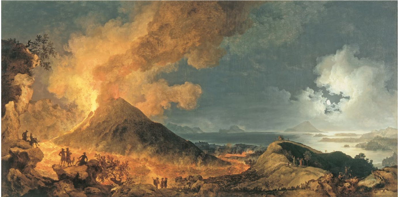
Figure 4.3. Pierre-Jacques Volaire, 'An Eruption of Vesuvius by Moonlight' (CVCSC:0259.S, 1774).