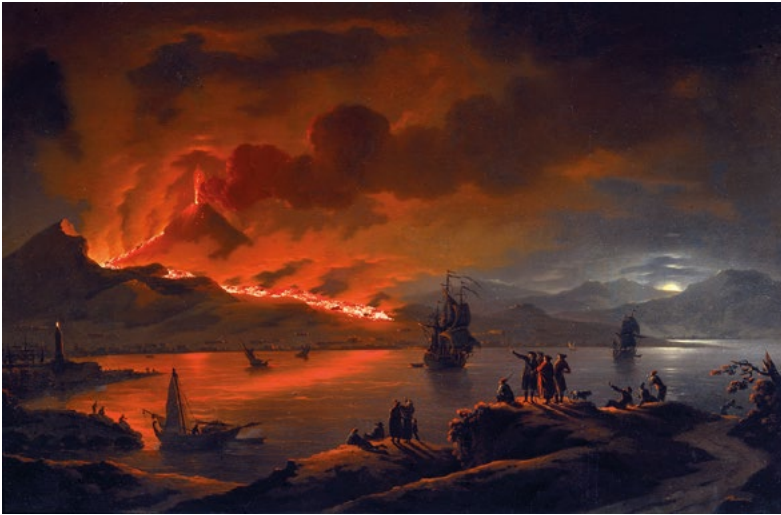
Figure 4.2. Michael Wutky, 'Eruption of Vesuvius, seen across the Gulf of Naples' (GG-742, c.1790/1800).

Courtesy of the Huntington Library, Art Collections and Botanical Gardens, San Marino, California. Purchased with funds from the Frances Crandall Dyke Bequest.