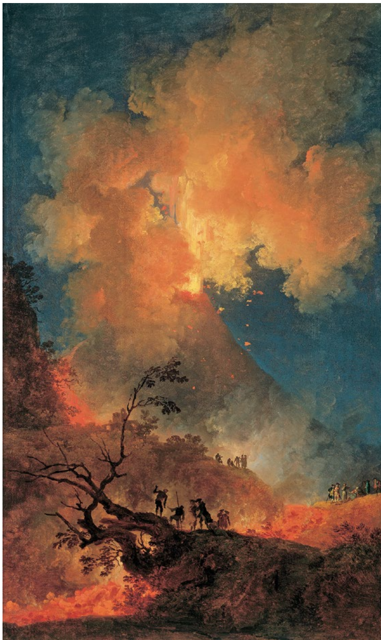
Figure 4.4. Pierre-Jacques Volaire, 'Vesuvius Erupting at Night' (CVCSC:0343.S, 1771).