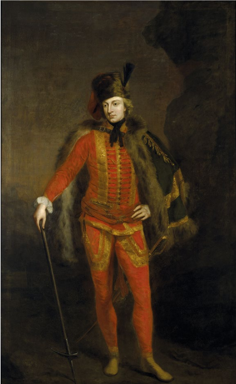
Figure 4.11. John Shackleton or James Dagnia, 'William Windham II (1717–61) in the uniform of a Hussar' (NT 1401251, Felbrigg, Norfolk, 1742–67).