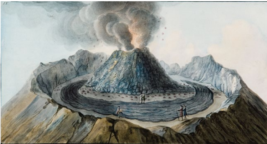
Figure 4.10. Pietro Fabris, 'Interior view of Crater of Mount Vesuvius ... plate IX', from William Hamilton, Campi Phlegraei (Naples, 1776).

Yale Centre for British Art, Paul Mellon Collection.