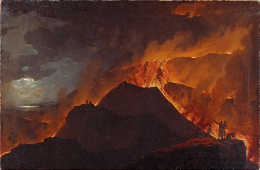
Figure 4.7. Michael Wutky, 'The Summit of Vesuvius Erupting' (GG-390, c.1790/1800).