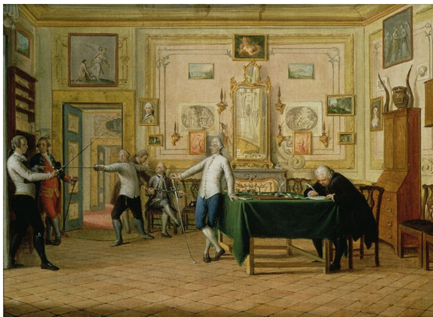
Figure 3.3. Pietro Fabris, 'Kenneth Mackenzie, 1st earl of Seaforth 1744–1781 at Home in Naples: Fencing Scene' (PG 2610, 1771).

Purchased 1985 with the assistance of the Art Fund.