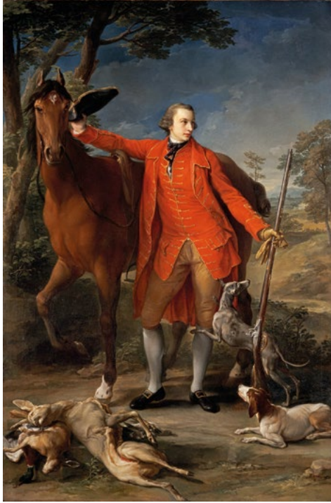
Figure 3.1. Pompeo Batoni, 'Alexander Gordon, 4th duke of Gordon (1743–1827)' (NG 2589, 1763–4).

Purchased by Private Treaty with the aid of the National Heritage Memorial Fund and the Art Fund 1994.