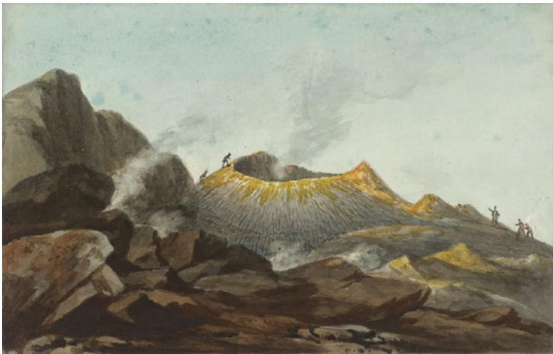
Figure 4.8. John 'Warwick' Smith, 'from Album of Views in Italy, [24] Crater [of Vesuvius]' (T05846, 1778).