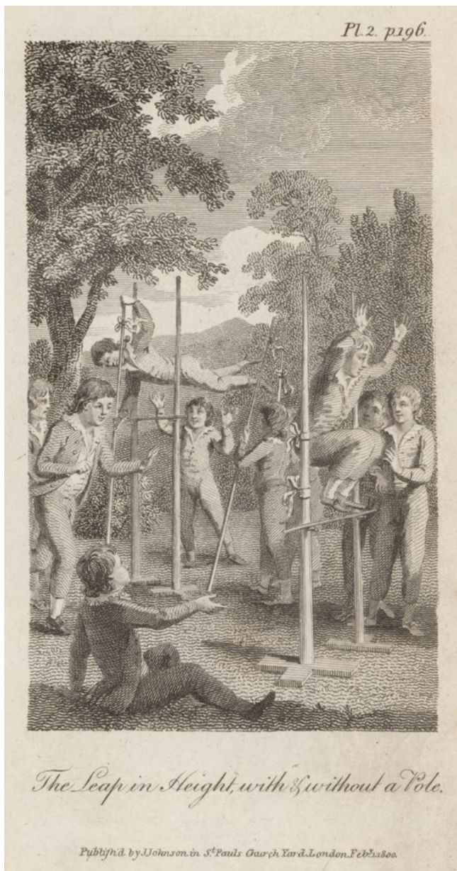
Figure 3.2. Anon, 'The leap in height with & without a pole' from Christian Salzmänn, Gymnastics for Youth... (London, 1800), p. 215.