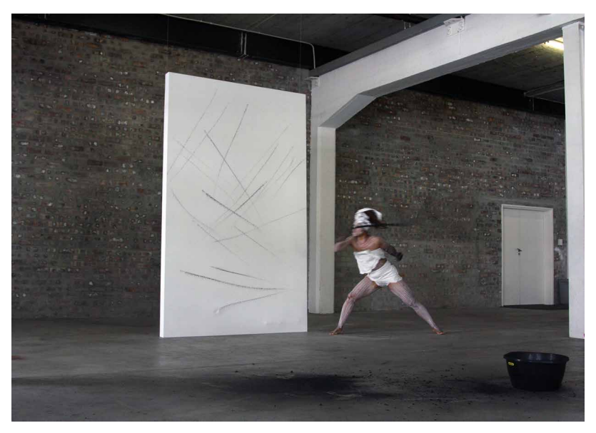
Figure 5.2. Whip It Good was first commissioned by Art Labour Archives and Ballhaus Naunynstrasse, Berlin, 2013.

and brutal act carrying multiple layers of traumatic referencing. Ehlers herself was struck by the fact that that not only the willingness of the spectators to take the whip, but also the whipping gesture of those who accepted the invitation, varied considerably depending on whether they were a woman, a man, a white or a black person.