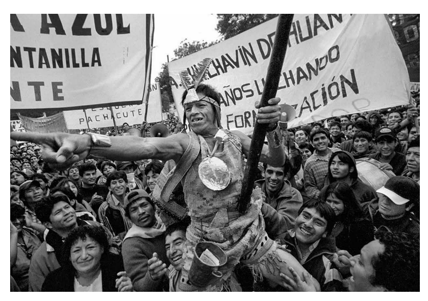
Figure 3.1. 'Pachacutec' by Adrián Portugal from the series 'Retratos de peruanos ejemplares', 2005 (by permission of the artist).