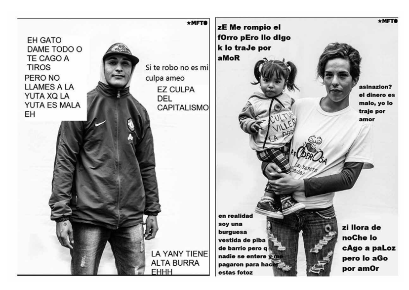
Figure 3.3. The two portraits by Colectivo Manifiesto, as altered by anonymous Facebook users.

while framing them with a text that would leave no room for ambiguities. The message on the public street should be as clear as possible. The choice was a text written in the plural first person: 'El miedo que te venden lo pagamos nosotros' [we have to pay for the fear they sell to you]. A few days before and during the march of 2015, six different images reproduced around ten times each, were carefully displayed in different spots in the city, mainly downtown, on bus stops and walls, in different sizes and formats (panels of 3 \times 2 metres or 0.8 \times 0.6 metres). The framing aimed at establishing a dialogue between passers-by and the photographs on the walls. The installation transformed the city into a palimpsest where a complex set of gaze exchanges could take place: high definition images of young people staring straight at the camera, the eyes of the spectators, and the gaze of the person behind the camera.