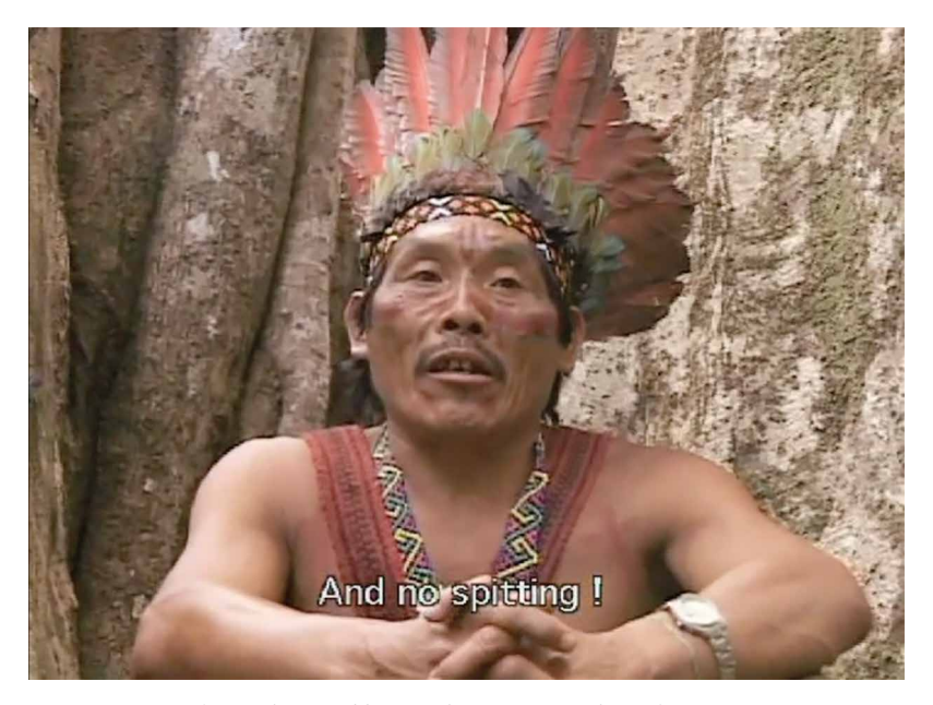
Figure 4.1. Hunikui authority addressing the spectator in the prologue to Já me transformei em imagem (2008).

on Indigenous point of view and authorship in these videos reclaims the medium for the community's own purpose and self-fashioning. Though this reflexivity is not new in documentary praxis, the opening invitation of Já me transformei ascribes authority to the Huni Kui elder (and later the filmmaker when we hear his voiceover) and crucially reverses the economy of the gaze associated with outmoded ethnographic film. Here, the observed of the past become the observers looking and speaking back at the spectator.