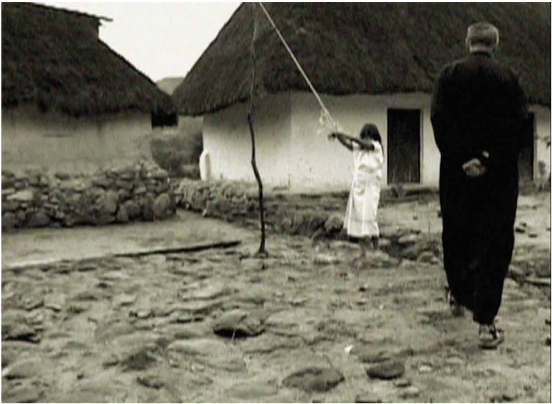
Figures 4.2 and 4.3. Bolinder photo and re-enactment in Nabusímake (2010).