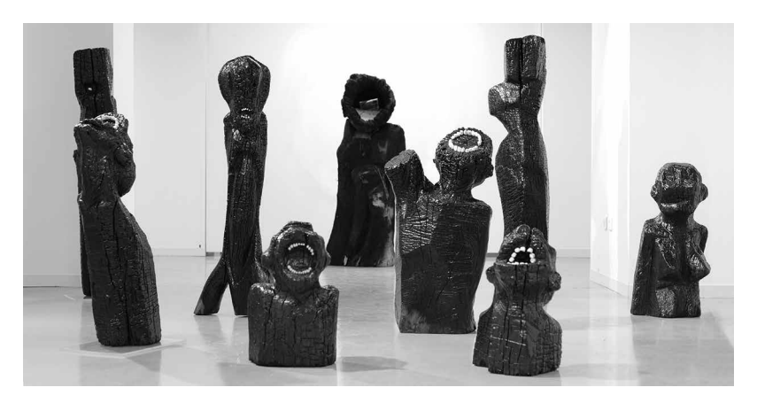
Figure 5.1. Moun Brilé by François Piquet, 'Réparations', Fonds d'Arts Contemporains, Guadeloupe, 2016 (by permission of the artist).

he cannot ignore the fact that racism is the template that structurally informs agency in his country. Therefore, through his art he aims to ignite feelings of indignation against racism and all forms of crime born from and justified by racist ideologies, leaving us with the urgent need to unite against human rights violations in the present, out of our emotional empathy and connection with crimes committed in the past. In 'Réparations', Piquet experiments with agency as an embodied power for repairing, mending, adapting or adjusting damaged materials to give them new life as 'repaired' objects. Through the invention and making of sculptures, he questions what it can mean to do reparations, with his own body force, instead of claiming them on the basis of moral principles.