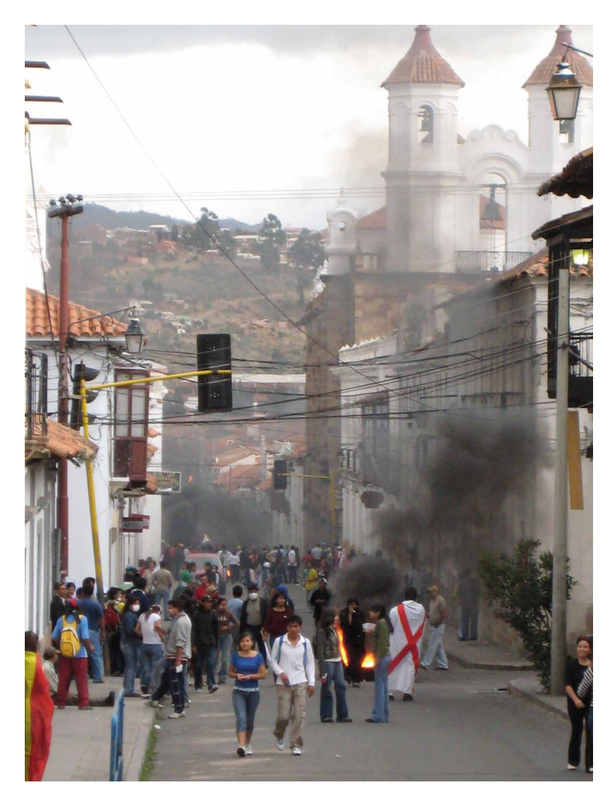
Figure 9.1. Burning tyres on the streets of Sucre on 25 November 2007 on the morning after the deaths of three capitalía protesters.