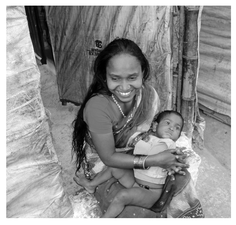
1 Mother and child, Topsia