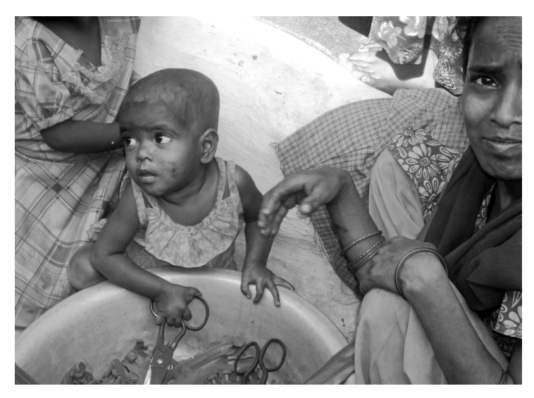
2 A future foretold