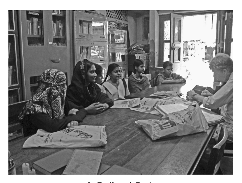
3 The library in Topsia