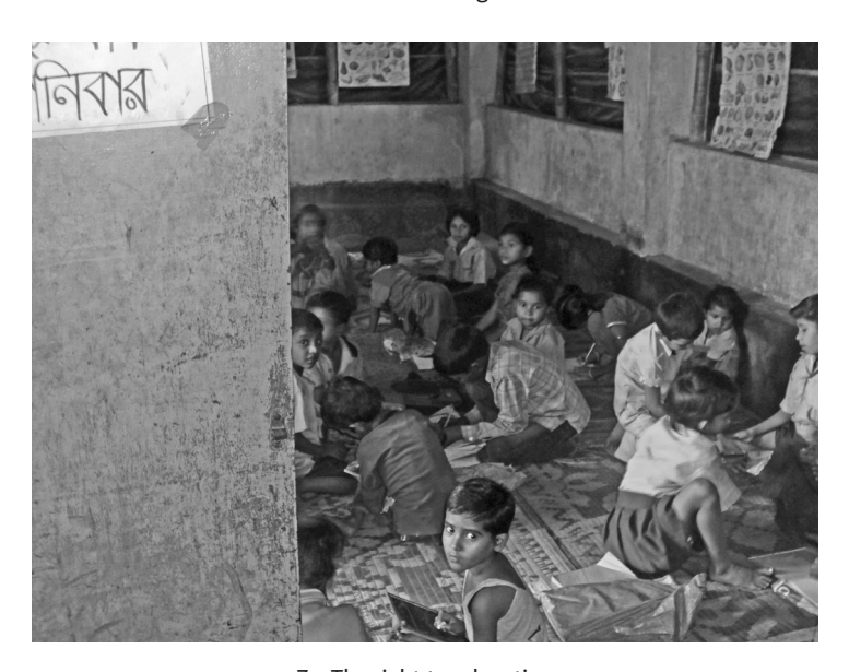
7 The right to education