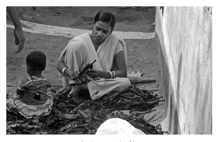
9 An apprenticeship