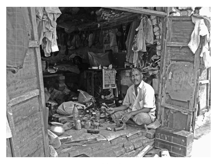
11 A sandal-making unit