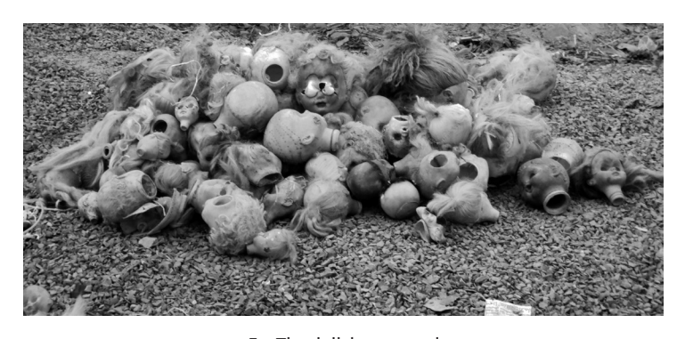
5 The dolls' graveyard