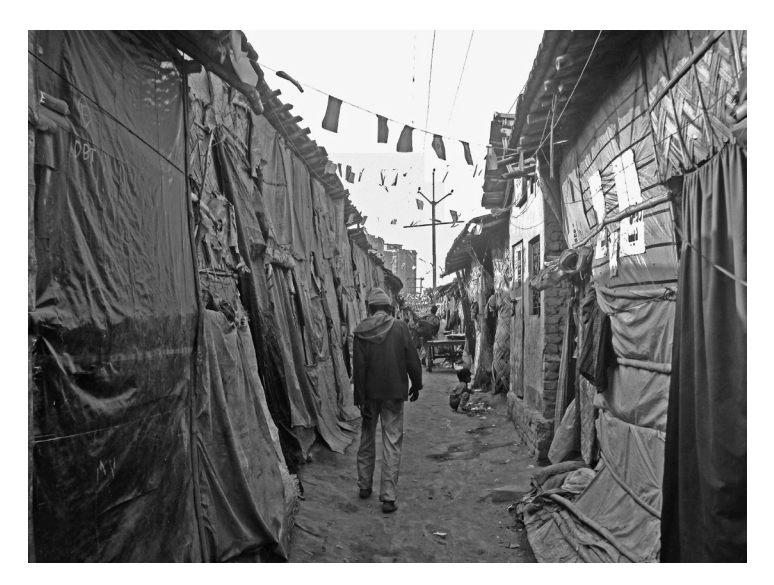
10 Street scene