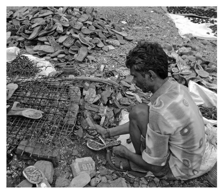
4 Unmaking shoes