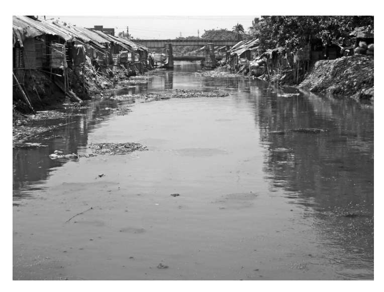
13 The canalside at Topsia