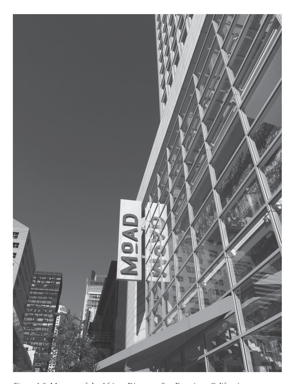
Figure 1.9 Museum of the African Diaspora, San Francisco, California.

the remaining mainly members of committees or friends groups. I identified the majority of participants from publicly available lists of supporters such as annual reports. The semistructured interviews typically took place in participants' offices, though in some cases I also met them in other places, such as museums, homes, and restaurants. Most often the interviews began