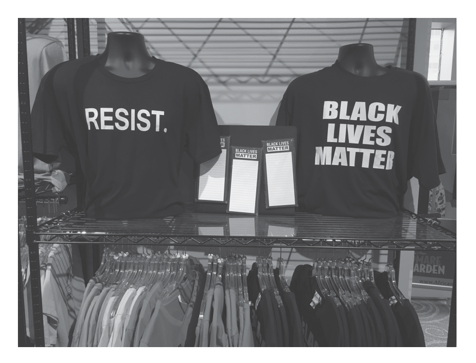
Figure 5.5 Black Lives Matter t-shirts for sale at the Reginald F. Lewis Museum of Maryland African American History and Culture, Baltimore, Maryland.

Just creating spaces for black people where they are safe is a crucial component to Black Lives Matter. I don't think that we all have to protest police brutality in order to be effective and work towards preservation of black lives.