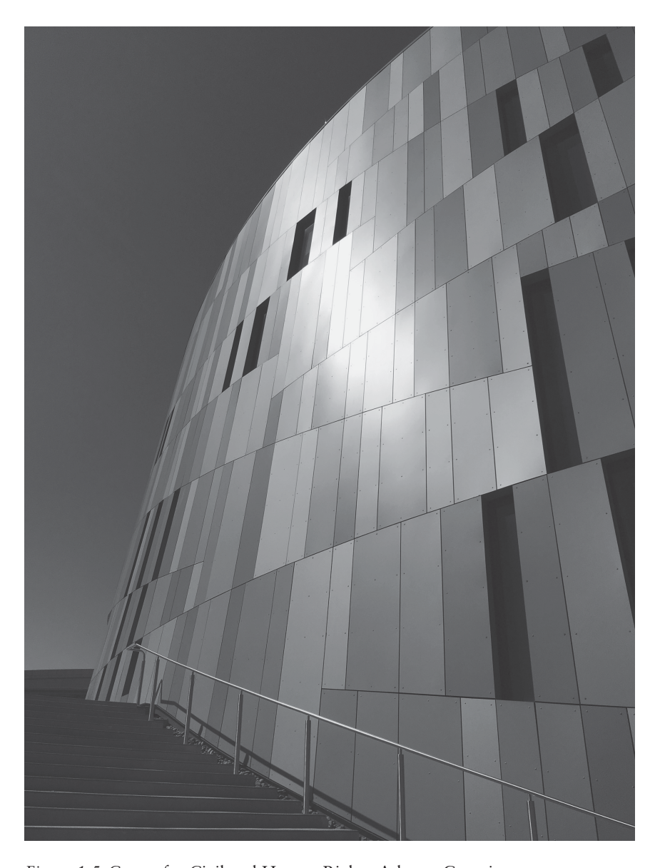
Figure 1.5 Center for Civil and Human Rights, Atlanta, Georgia.

Slavery Museum still have not gotten off the ground despite years of efforts (Manly 2016). Others had noteworthy capital campaigns yet quickly ran into financial challenges after opening. For example, soon after the National Underground Railroad Freedom Center opened, it faced a $5.5 million deficit (Post Staff Report 2007). Similarly, four years after the August Wilson Center in Pittsburgh, Pennsylvania, opened to wide acclaim in 2009, it went