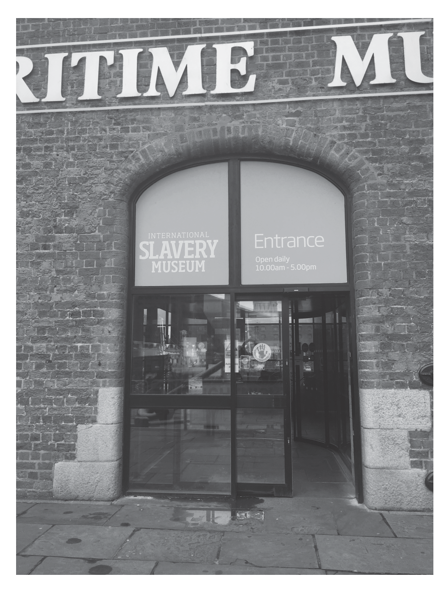
Figure 6.2 Entrance to the International Slavery Museum, London, England.

Given that there are museums across the globe focused on the history and culture of people from the African diaspora, cross-national research of museum values is an important area for future inquiry. The rich comparative scholarship examining values across different national contexts suggests that museums values would also not be static across the globe. This broader