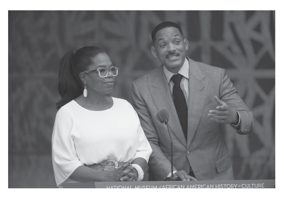
Figure 1.1 Oprah Winfrey (left), who donated over $20 million to the National Museum of African American History and Culture, at the museum's opening ceremony, with the actor Will Smith (right).

view black museum philanthropy as a means to not only "do good" but also "do well" through promoting their careers, while supporters who work in other sectors are less likely to view giving as having direct professional benefits. Cultural connoisseurs typically see art and history as the lifeblood of black museums, yet cultural appreciators are often less interested in black museums as purely cultural institutions. And, although supporters across the generations share a concern with positioning African American museums as 21st-century institutions, it is often Generation Xers and Millennials who are the most committed to a focus on contemporary culture, politics, and technology.