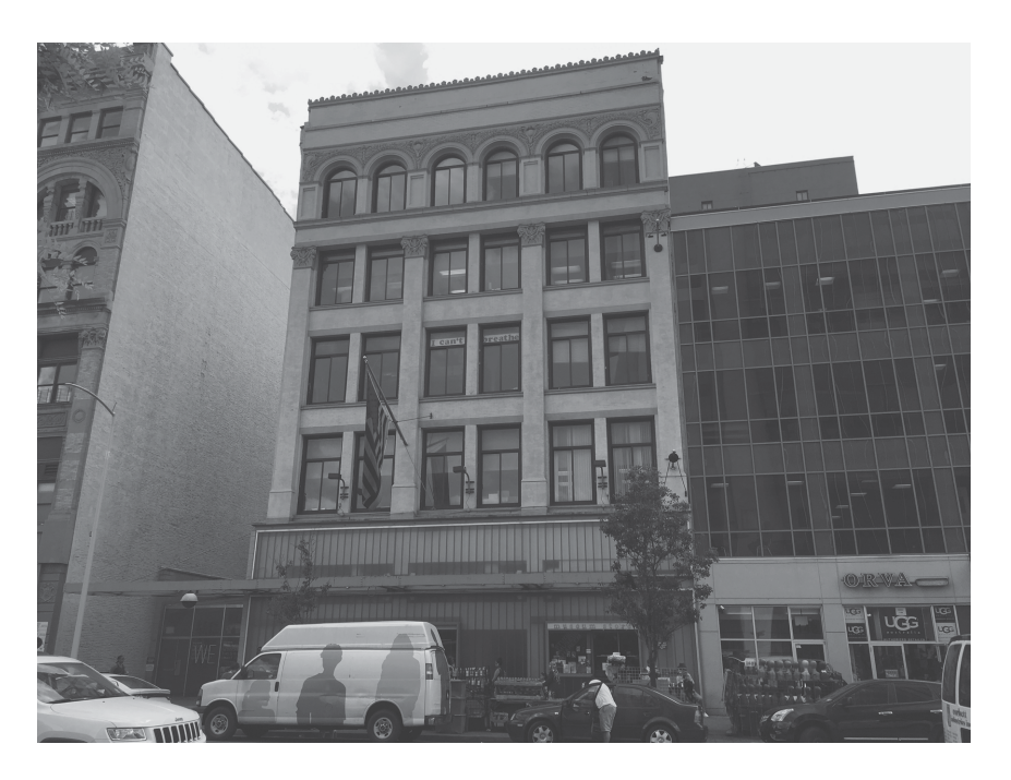
Figure 1.6 The Studio Museum in Harlem, New York.

into bankruptcy and closed. It reopened in 2014 after foundations in the city formed a consortium to raise funds and purchase the center (O'Toole 2015). Even old guard museums like the Charles H. Wright Museum of African American History have faced financial difficulties. In 2004, the Detroit institution needed emergency funding from the city to remain open (Montagne 2004).