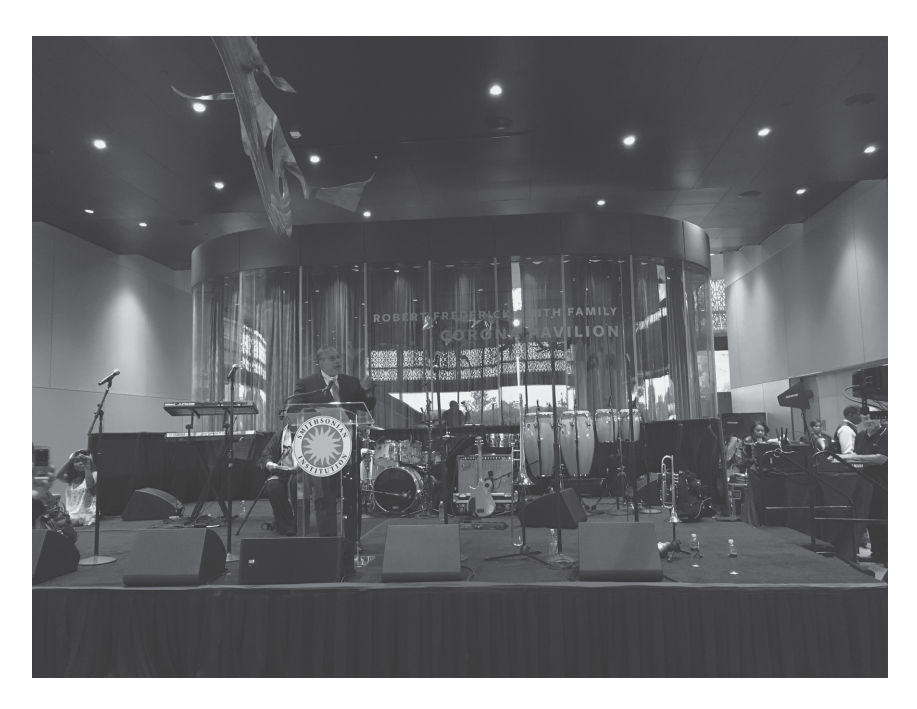
Figure 6.1 Lonnie Bunch, director of the National Museum of African American History and Culture, speaking at the Association of African American Museums annual meeting, 2017.

In Chapter 3, I elaborate how patrons' museum values vary based on profession. I show how supporters who work in the private sector, especially entrepreneurs, executives, and lawyers, more commonly value black museums as institutions that are tightly linked to their careers. For members of this group, supporting black museums is often valued as a practice that provides them with the opportunity not only to use the resources of their profession to give back, but also to advance their careers by building and nurturing professional ties. I propose that the higher emphasis placed on the career value of giving to black museums among patrons who work in the private sector is partly due to structural factors, such as the higher level of embeddedness of their workplaces in museum philanthropy and their exposure to business ideologies like the ethos of corporate social responsibility.