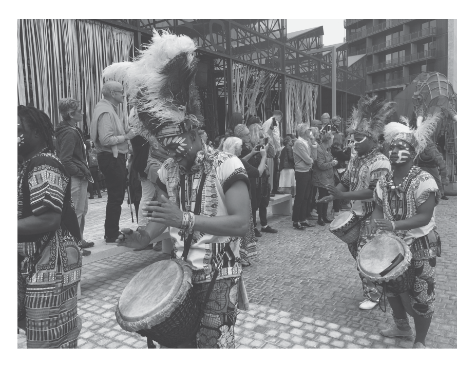
Figure 6.3 Opening of the Zeitz Museum of Contemporary Art Africa, Cape Town, South Africa.

cross-national literature on values shows how structural factors, such as the degree of racial and ethnic diversity in a country, and cultural factors, such as national ideologies about equality, shape how residents assess worth (Lamont and Thévenot 2000; Lamont 2000). Given the distinct structural and cultural conditions of the nations in which various African diasporafocused museums are located, future research should compare how local patrons define the value of museums in their respective countries.<sup>7</sup> For example, we need to know more about how patrons in the United States and South Africa understand the worth of history museums in their home countries.