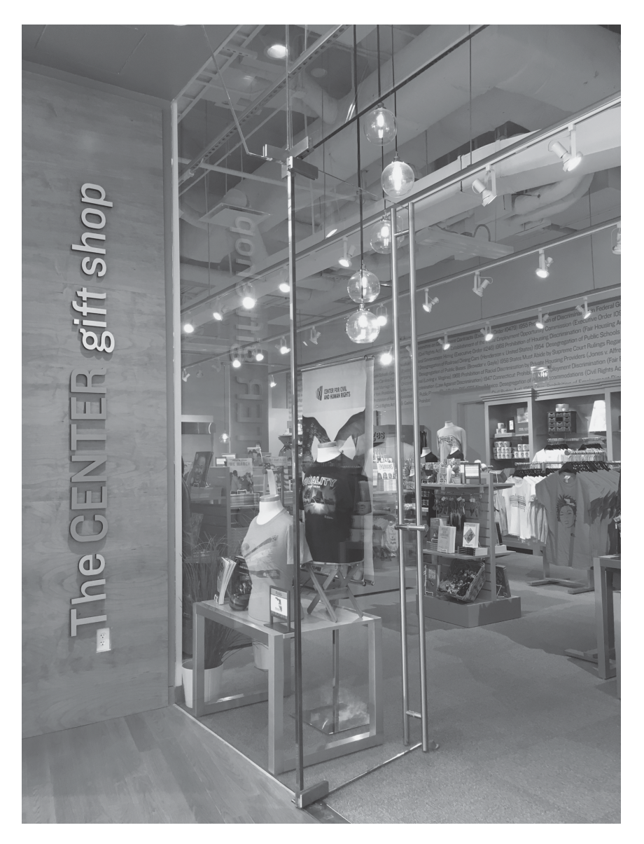
Figure 3.1 Gift shop at the National Center for Civil and Human Rights, Atlanta, Georgia.

all about the customer—tracking data on our visitors and how many visitors we are going to get the next time."