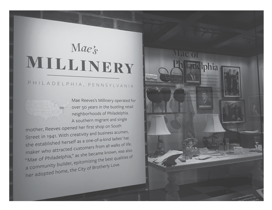
Figure 2.2 Mae's Millinery Exhibition, the National Museum of African American History and Culture.

Black supporters often describe the value of black museums in relationship to preserving personal histories characteristic of the black experience. While they may be intimately familiar with family histories and have held onto cherished family heirlooms, they view black museums as spaces that can protect and publicly memorialize these legacies. Donating or loaning family artifacts to, and providing financial support for, African American museums allows them to help preserve these legacies. The Boyd family not only gave a million-dollar gift to the NMAAHC, but they also donated artifacts from their family business started by Richard Henry (R.H.) Boyd in the 19th century. The family history is documented in an exhibition in the museum's Community Galleries. At the top of the exhibit case there is a quote from the family patriarch, the publishing magnate R.H. Boyd, that reads, "Will you help the young Negro be a self-respecting man by putting the Periodicals of his father's organization in his hands?" The display holds objects such as a black-and-white family portrait from the 1890s, a metal printing plate used from 1959 to 1979, and a printed Baptist Sunday school lesson from 1926. T.B. Boyd III, R.H.'s great-grandson, describes the personal and broader cultural significance of his family's heirlooms and philanthropy at the NMAAHC (Smithsonian Campaign n.d.): "We need a repository for African American