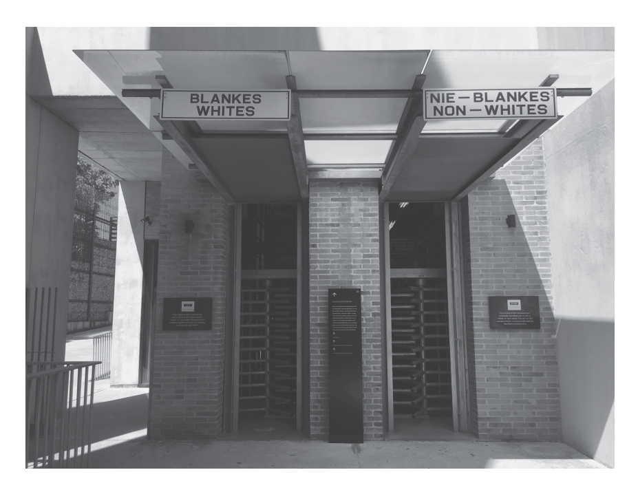
Figure 6.4 Entrance to the Apartheid Museum in Johannesburg, South Africa.

United States, Europe, and other parts of Africa are patrons of the new Zeitz MoCAA, and billionaire families based in Nigeria and London have given to the recent campaign by the Africa Center (formerly the Museum for African Art) (The Africa Center 2017). We need to know more about how the museum values of patrons who are local residents of a nation differ from those of patrons whose primary residence is outside of the country or those who have multiple residences. Also, given the finding in this study that, relative to native-born blacks, immigrant blacks place more emphasis on African American museums having an international focus, it is particularly important to undertake comparative research on how native-born and immigrant blacks in African and Caribbean countries, as well as blacks who reside within and outside of those nations, define the value of museums there. Comparing how African Americans and black Africans think about the place of African American art and artifacts in the collections of African museums could offer important insight on this issue. <sup>10</sup>