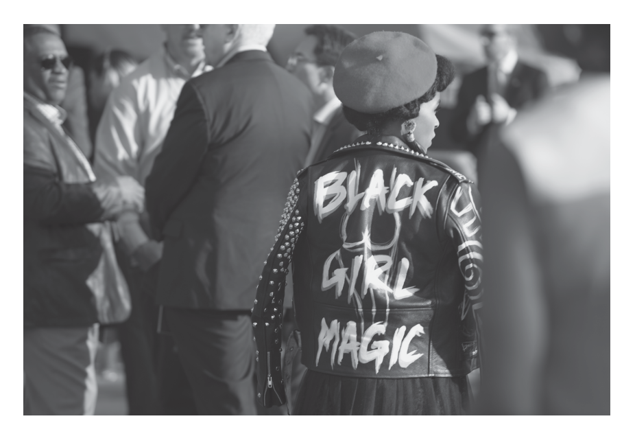
Figure 5.1 The Millennial singer, rapper, and actress Janelle Monáe in a Black Girl Magic jacket at the opening ceremony for the National Museum of African American History and Culture.

Indeed, fans of rap music are more concentrated among younger arts audiences (Peterson et al. 1996, 114). In the case of black museum philanthropy, younger patrons often place a heightened emphasis on hip hop and other forms of contemporary culture being inside the walls of African American museums (see Figure 5.1). As sociologists like Andreana Clay (2012) theorize, the cultural touchstones of various generations differ. For example, whereas baby boomers came of age during the birth of the Motown Sound, Generation Xers and Millennials came into their musical maturity when hip hop ruled the national and global airwaves. While older supporters do not reject the notion of African American museums as contemporary cultural spaces, their concern and interest in the contemporary is typically not as great as with their younger counterparts. Similarly, while cultural forms that were at their height in earlier periods interest younger supporters, in balance they are typically less enamored with them than are older patrons. Generational gaps in experience and knowledge mean that