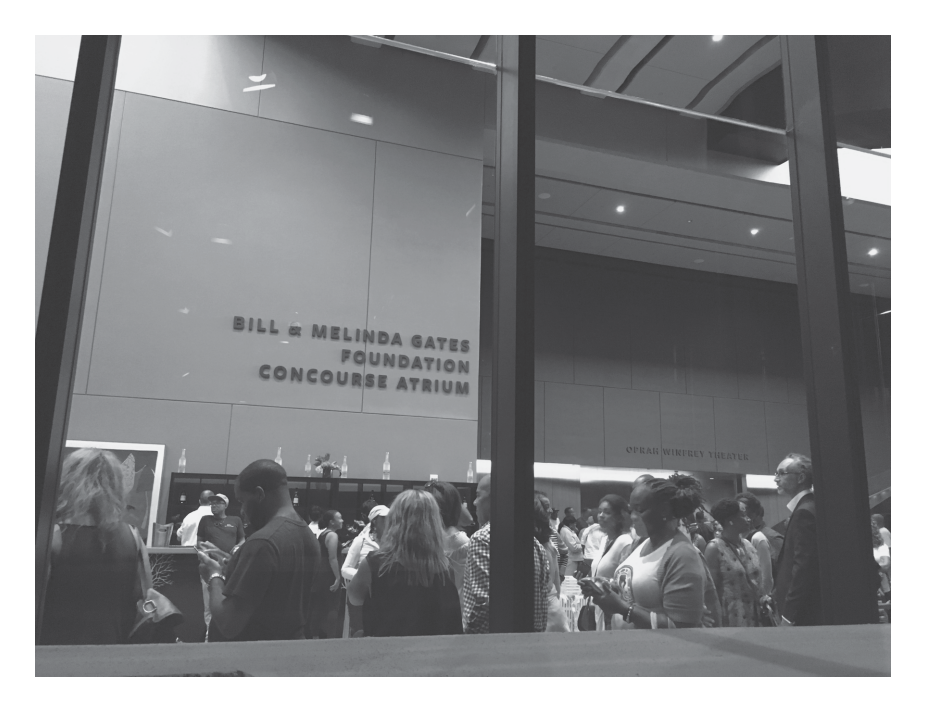
Figure 2.1 Bill and Melinda Gates Foundation Concourse Atrium and Oprah Winfrey Theater, National Museum of African American History and Culture, Washington, DC.

museums for the years 2005 to 2016. I found that black donors were far more likely than white donors to give to the NMAAHC. Looking at funding for the NMAAHC among the wealthiest Americans offers further insight on racial patterns of support for the museum. In 2016 just two African Americans— Oprah Winfrey and Robert Smith—were among the 400 wealthiest people in the United States. Both were founding donors of the NMAAHC. White billionaires, such as Bill Gates, were also founding donors to the NMAAHC, but their rate of giving to the museum—about 3 percent—was smaller than the 100 percent rate of support among the infinitesimally population of blacks in the group. Similarly, of the 20 wealthiest Black Americans in 2009—the most recent year this particular grouping was compiled by Forbes magazine—six, or 30 percent, ended up being founding donors of the NMAAHC. These patterns of funding suggest that wealthy blacks may be more likely than their white counterparts to donate to black museums. Yet, there is also evidence that whites are an important funding base for black museums. 11 Even in the case of the NMAAHC, where the majority of large donations by individuals, families, and family foundations appear to have come from blacks, gifts from whites, such as gifts in the $10 million and above category from the financier David Rubenstein and the Bill and Melinda Gates Foundation, amounted to a significant share of overall funds raised (see Figure 2.1).