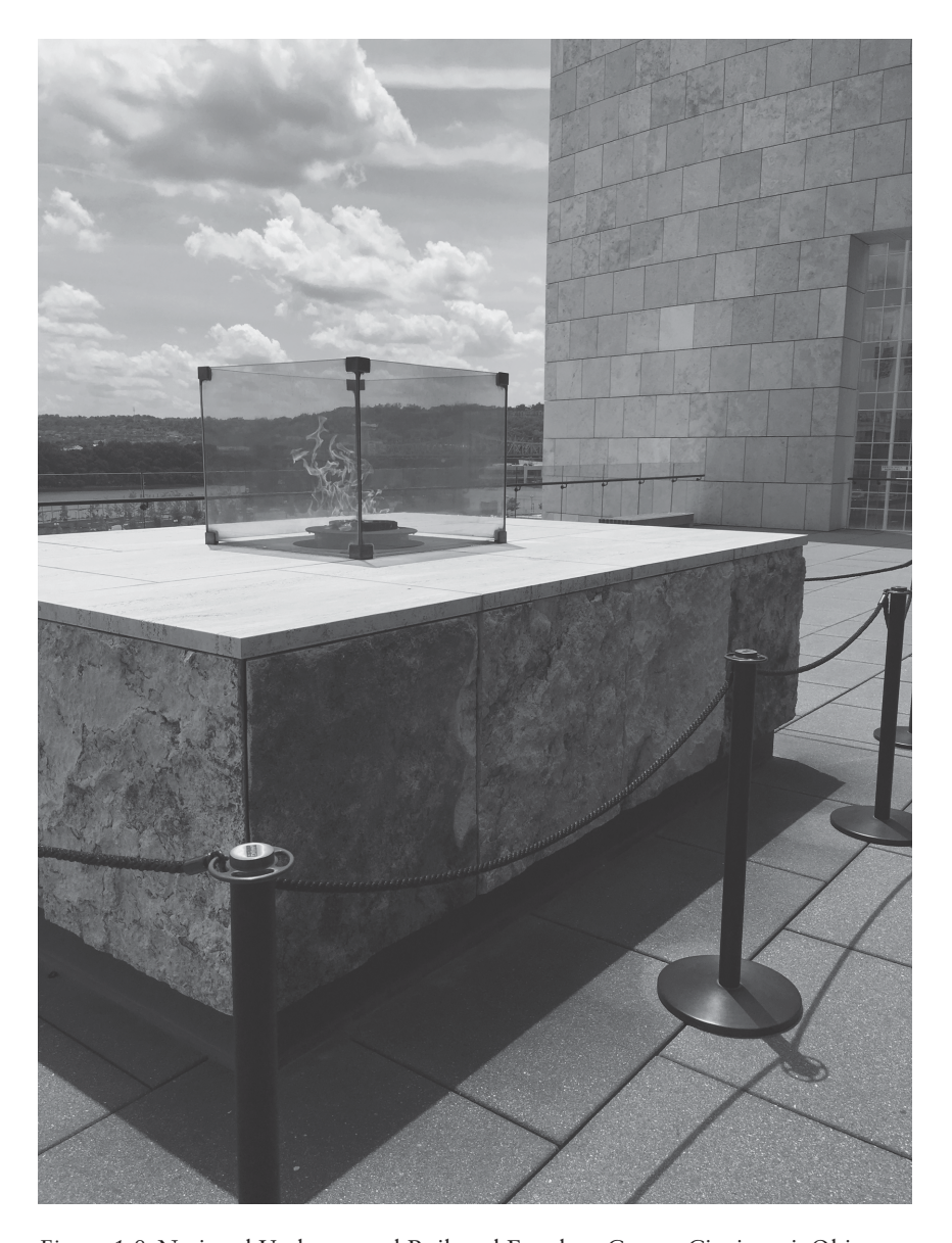
Figure 1.8 National Underground Railroad Freedom Center, Cincinnati, Ohio.