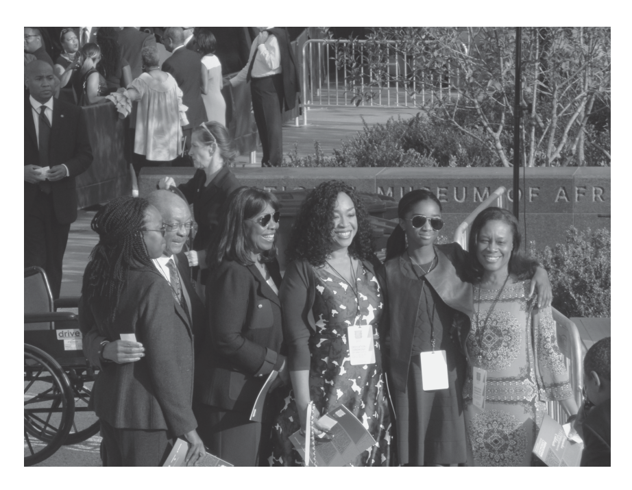
Figure 1.2 The television producer Shonda Rhymes (center), who donated $10 million to the National Museum of African American History and Culture, at the museum's opening ceremony.

among the upper-middle and upper class. By elaborating how subgroups within the upper-middle- and upper-class value black museums in distinct ways, Diversity and Philanthropy at African American Museums sheds light on the intraclass divisions that mark museum patronage. It also offers new theoretical insights on the interconnections between social boundaries and cultural participation more broadly. Before delving into the world of philanthropy at black museums, it will be helpful to understand their trajectory of growth. In the next section, I provide an overview of the development of the field of black museums.