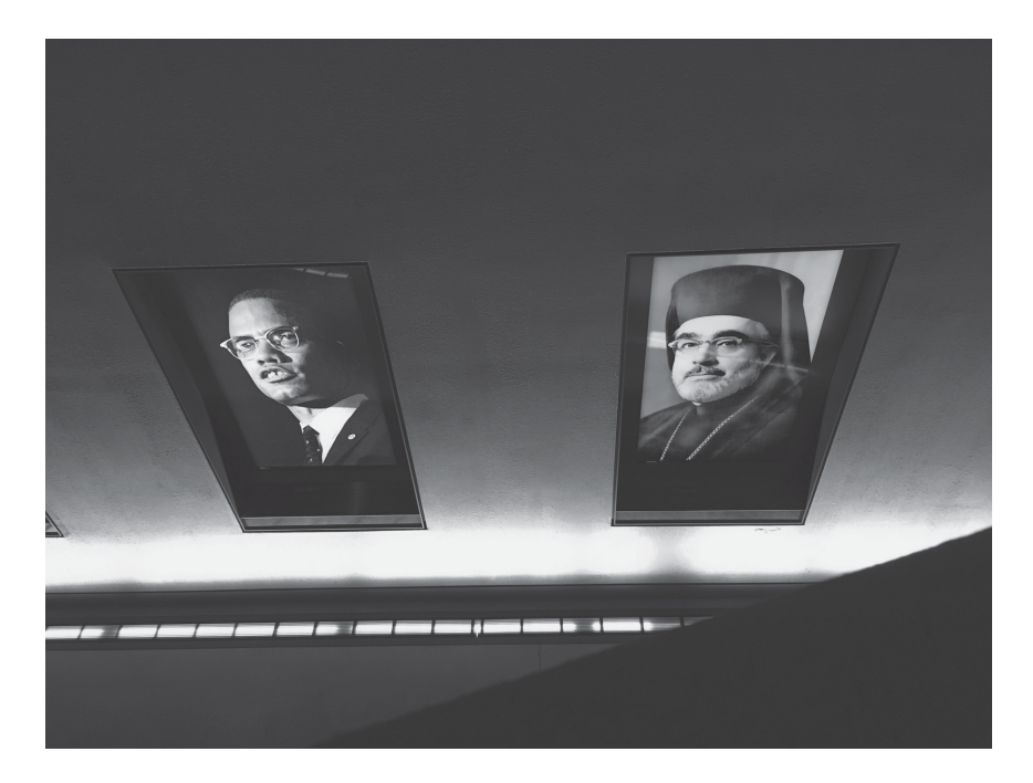
Figure 2.3 Photograph of Malcolm X (left) and Archbishop Iakovos of America (right) at the National Museum of African American History and Culture.

march alongside Dr. Martin Luther King Jr. in the 1965 Selma, AL, civil rights march." The Greek Orthodox Archdiocese of America also released a statement heralding the donations noting, "These grants were made in honor of Archbishop Iakovos' leadership and legacy in the area of civil and human rights ..." (Greek Orthodox Archdiocese of America 2015).