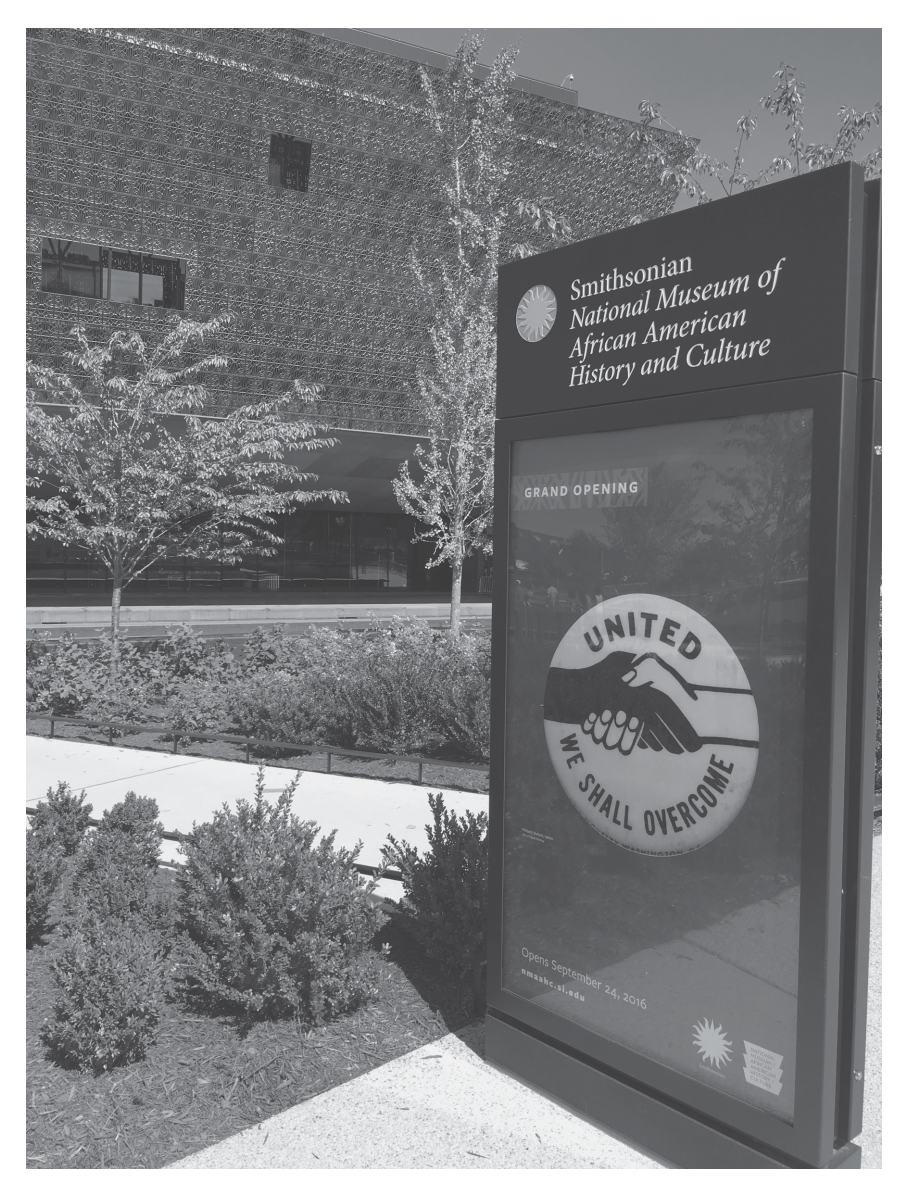
Figure 1.4 National Museum of African American History and Culture, Washington, DC.

build new black museums in states such as Florida, Georgia, and California (Harris 2018; McMorris 2018; Prabhu 2018).