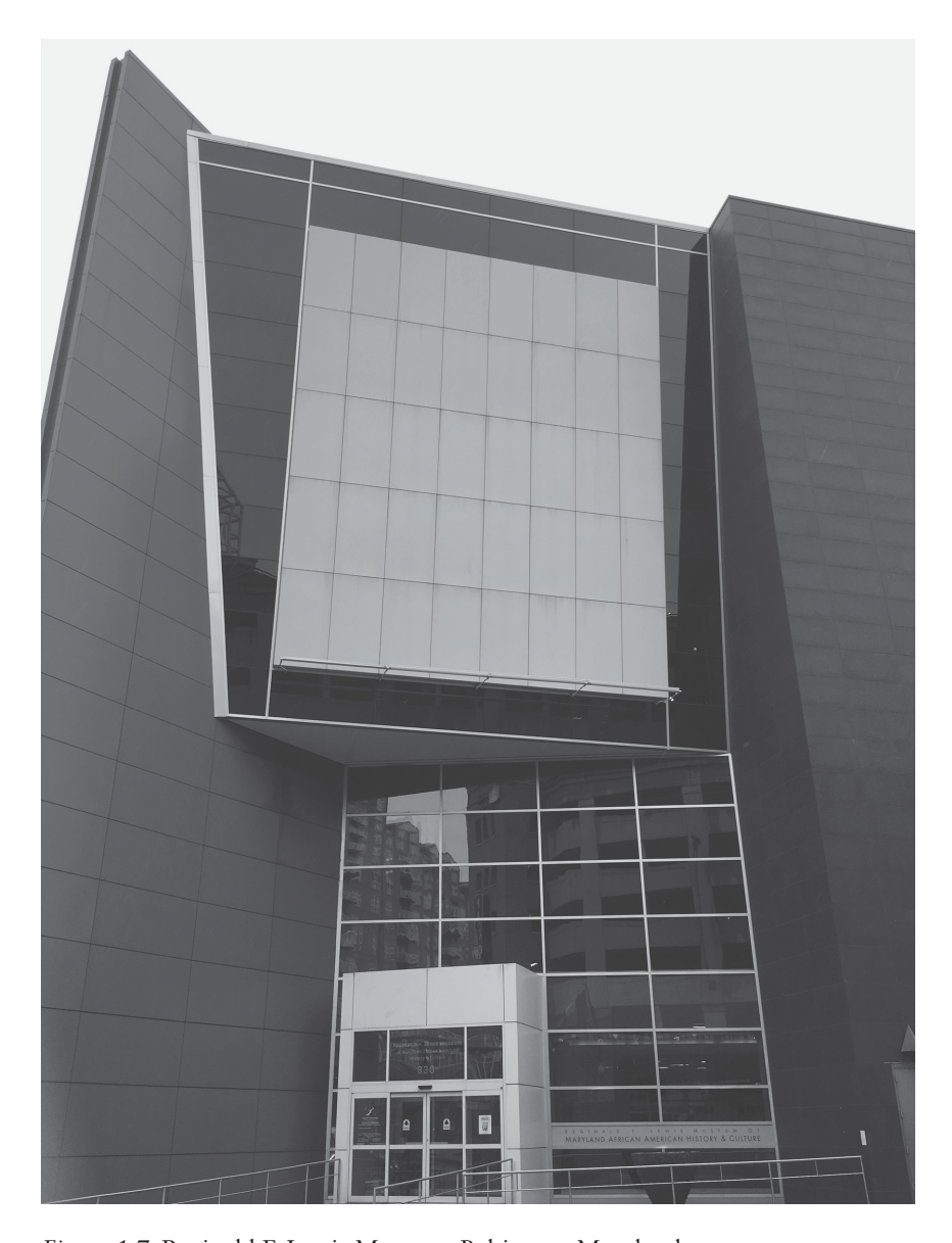
Figure 1.7 Reginald F. Lewis Museum, Baltimore, Maryland.

institutions. Understanding the meanings and motivations underlying their philanthropy can help us gain both insight into the development of this field of museums and broader perspective on social boundaries and cultural patronage. This line of inquiry can also offer practical insights that are important for the sustainability of black museums. 12