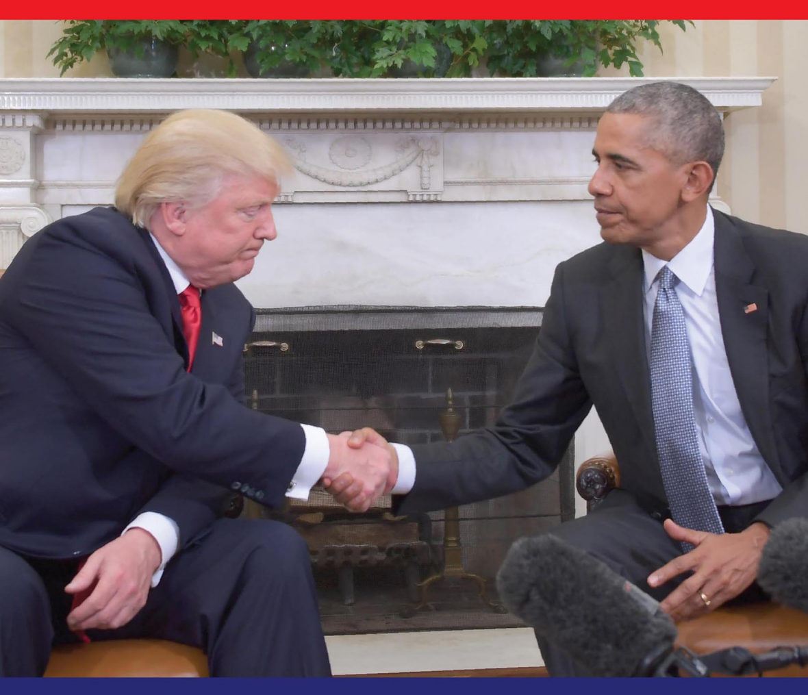
New Perspectives on the American Presidency

The Politics of Presidential Legacy and Rollback