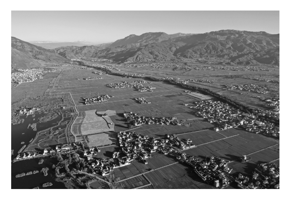
Figure 2.1 Villages in the Dengchuan basin located along the banks of the Miju River 瀰苴河 (the line of trees in the centre).

From this basin the river empties into Lake Erhai, a part of which is visible at the front left. Aerial photograph: Li Shiyang 李仕陽, 2019.