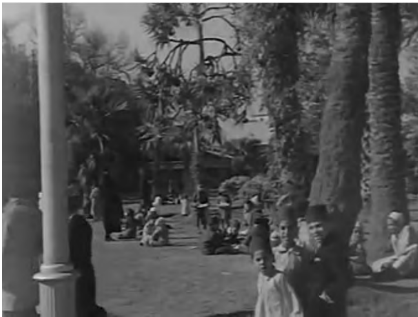
FIGURE 1. Alexandria residents relaxing in a park. Screenshot from Mistreated by Affluence (Togo Mizrahi, 1937).

The footage shows what appear to be Alexandria residents engaging in leisure activities in identifiable locales. None of the credited actors appear in the montage. Children display curiosity about the camera. The viewer is invited to read these images as authentic—even as we recognize the constructedness of the montage. Social codes of dress give the viewer cues to categorizing the individuals included in the footage. Members of the rising middle class—the effendiyya —are shown seeking entertainment and diversion alongside members of the popular classes. 2 This carefully edited montage constructs a festival day in which Alexandrians across the socioeconomic spectrum celebrate in public spaces together.