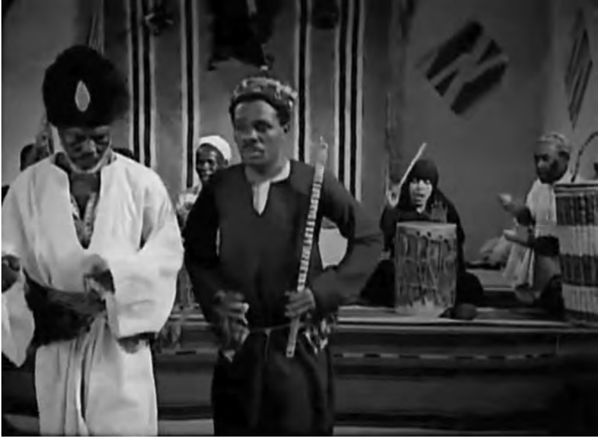
FIGURE 32. Performers at a wedding celebration in Aswan. Screenshot from Seven O'Clock (Togo Mizrahi, 1937).

blackface stage persona, he may here, too, implicitly lay claim to Sudanese ancestry. But we also can't ignore the way this footage exoticizes Nubia for the urban Lower Egyptian viewer, and fails to distinguish between distinct Afro-Muslim cultures.