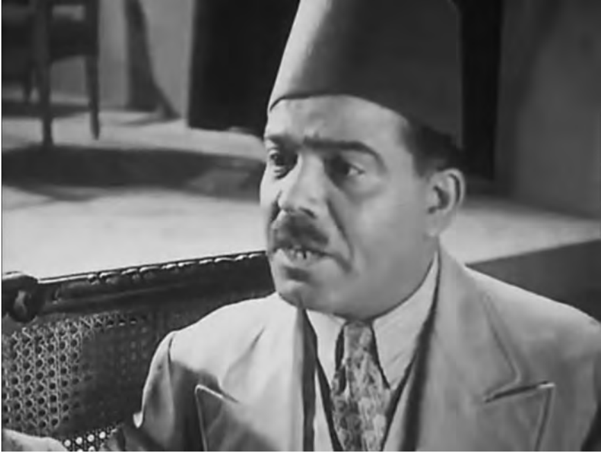
FIGURE 14. 'Ali al-Kassar in his double role as the crime boss. Screenshot from The Neighborhood Watchman (Togo Mizrahi, 1936).

comprehend that they are helping to circulate counterfeit bills printed by the gangsters. They are unwitting agents of exchange.