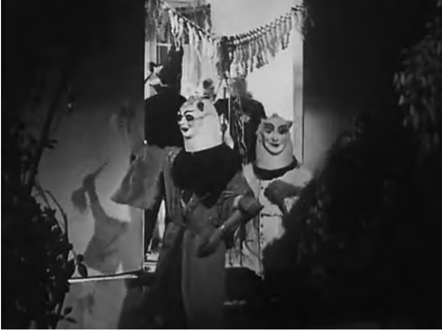
FIGURE 12. Revelers leave a costume ball. Screenshot from The Neighborhood Watchman (Togo Mizrahi, 1936).

out, vice versa, upside down, such is the direction of all of these movements. All of them thrust down, turn over, push headfirst, transfer top to bottom and bottom to top, both in the literal sense of space and in the metaphorical meaning of the image.” 56 The conclusion of the masquerade scene may cross the boundaries of good taste. But, following Bakhtin, we can read this elevation of the vulgar and debasement of the cinema as an embrace of the subversiveness of carnivalesque farce.