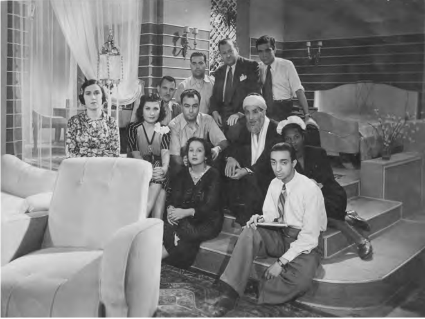
FIGURE 6. Togo Mizrahi (center) with the cast and crew on the set of Layla the Country Girl (1941).

masterpiece.” 95 Another, anonymous reader of the newspaper wrote in as well to congratulate Togo Mizrahi on the film’s “dazzling success”: “The success of Layla the Schoolgirl is attributable both to the mastery of its director, Mr. Mizrahi, as well as to the performance of film and music stars Yusuf Wahbi and Layla Murad. 96 “Mizrahi’s films,” he concludes, “are epitomes of creativity, and their success is unrivaled.” 97