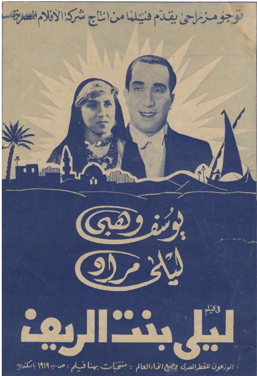
FIGURE 40. Pressbook for Layla the Country Girl (Togo Mizrahi, 1941).