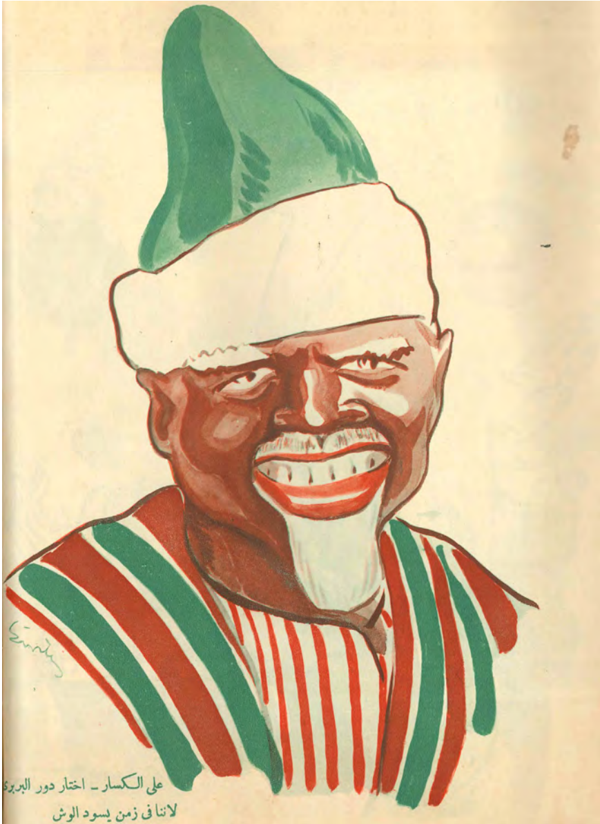
FIGURE 31. Caricature of ‘Ali al-Kassar in blackface. The caption reads: “‘Ali al-Kassar—I chose the role of the barbarian because we are in a time that blackens the face.” Al-Ithnayn , 13 August 1934.

toward Egyptian independence. Negotiations concluded in August 1936, four months before ratification, so the terms of the treaty were discussed and debated in the press. 17 In October 1936, less than two weeks before the release of al-Kassar’s film The Neighborhood Watchman , Togo Mizrahi hosted a party celebrating “the