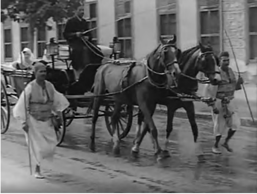
FIGURE 43. Amshagiyya accompany Layla's carriage. Screenshot from Layla (Togo Mizrahi, 1942).

shown departing by carriage from the home he shares with Layla in the country. A doctor arrives by carriage to treat Layla. Farid's father arrives and departs by carriage, framing his dramatic interaction with Layla. The film also features a carriage chase. At one point Farid storms out and rides off into the night on a simple buckboard. Layla follows after him, jumping into an enclosed carriage, a thin black veil pinned, as if in haste, to the back of her head. In this scene, as she rushes to reconcile with Farid by renouncing her reliance on the financial support of other men, Layla no longer wears the yashmak , and her carriage proceeds without the services of the amshagiyya . Within the diegesis, the loss of these royal symbols maps the character's disavowal of wealth in favor of happiness. But for the audience, the star, Layla Murad, remains associated with the trappings of royalty.