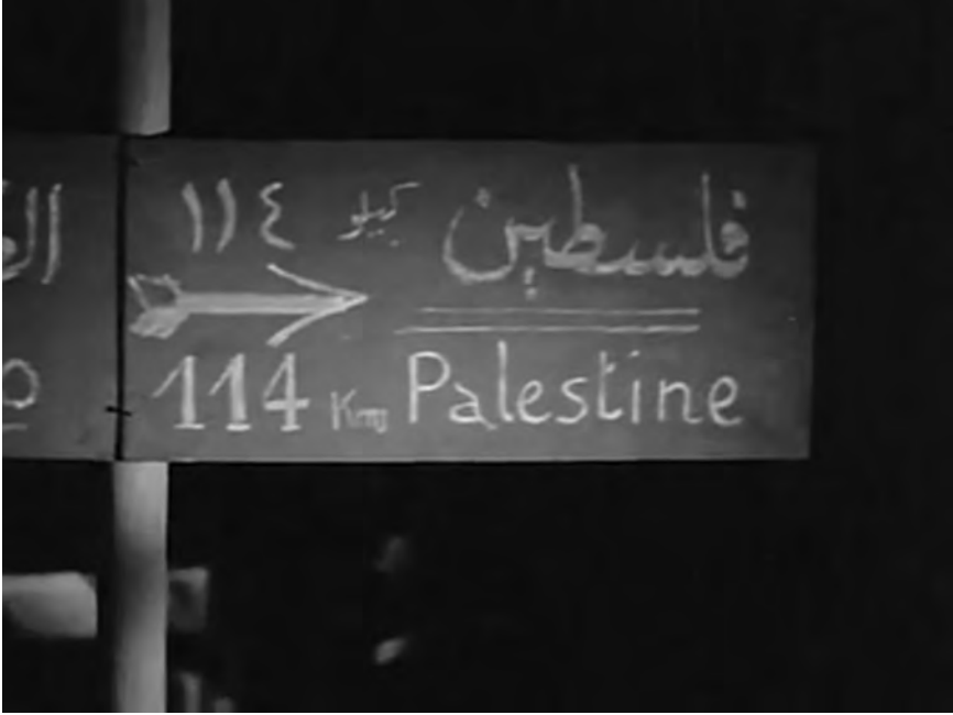
FIGURE 39. Bilingual directional sign near the customs house in Isma'iliya indicating the distance to Palestine. Screenshot from The Straight Road (Togo Mizrahi, 1943).

The accident conveniently provides cover for the later loss of the gold. A telegram sent to the Egyptian Nationalist Bank states that the driver's body was not found but that a bag and a wallet belonging to Yusuf Fahmi were recovered. The article from the newspaper Al-Jumhur that Ibrahim reads out loud in Suraya's dressing room in Beirut notes that no trace of the body or the gold has been found. The two pieces of news, delivered in Cairo and Beirut, bracket the absence in Palestine, and grant it signification: on the one hand, news of Yusuf's presumed death, and on the other, revelation of Yusuf's survival but the demise of his identity.