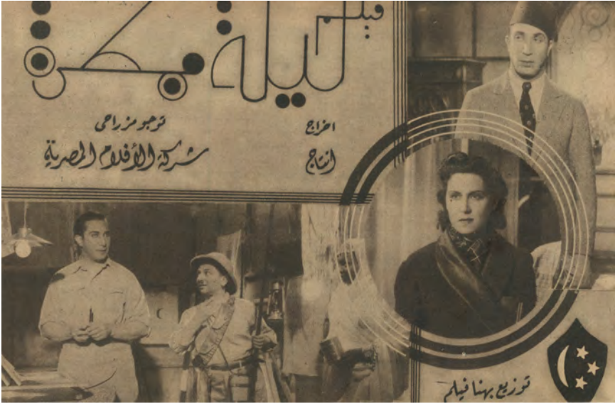
FIGURE 35. The bottom left image in this collage shows Ahmad (Yusuf Wahbi, left) and Shahata ('Abd al-'Aziz Ahmad, center) in Omdurman; also pictured, Ahmad dressed as an effendi (top right) and Saniya (Layla Murad, bottom right). Pressbook for A Rainy Night (Togo Mizrahi, 1939).

through the trials of labor in the colony. The portrayal of Sudan in this albeit uncritical colonialist idiom problematizes the widespread political acceptance in interwar Egypt of Egypt's right to rule Sudan (as discussed in chap. 5). The Egyptian experience in Sudan is rendered through a British colonial lens—raising, but ultimately not answering, questions of colonial legitimacy, sovereignty, and territoriality of nation and state. I have been arguing that A Rainy Night attempts to define the boundaries of what it means to be Egyptian. The Sudan itinerary, I argue, serves to problematize the definition of Egypt's geographical boundaries.