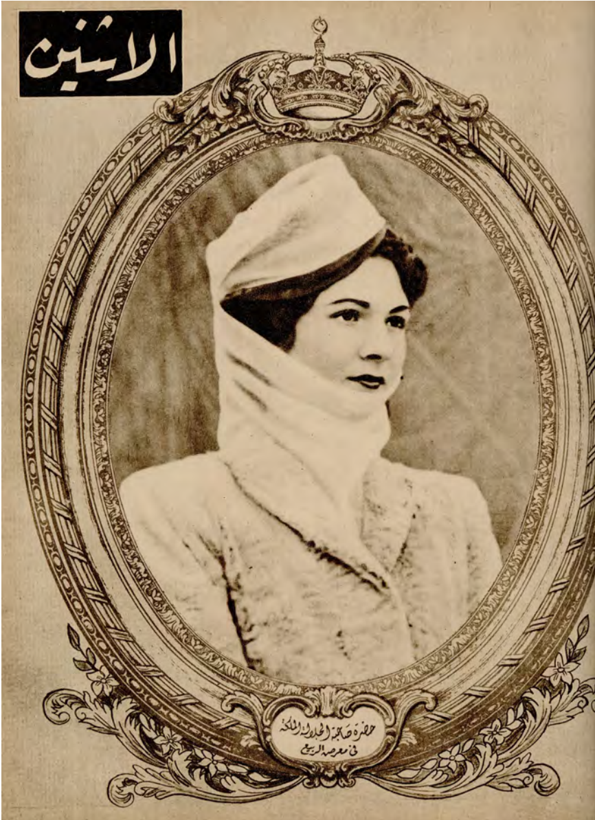
FIGURE 41. Portrait of Queen Farida on the cover of Al-Ithnayn , 16 March 1942.

and character. Visually and textually, the connection between character and star promotes the idea of Layla Murad as cinema royalty.