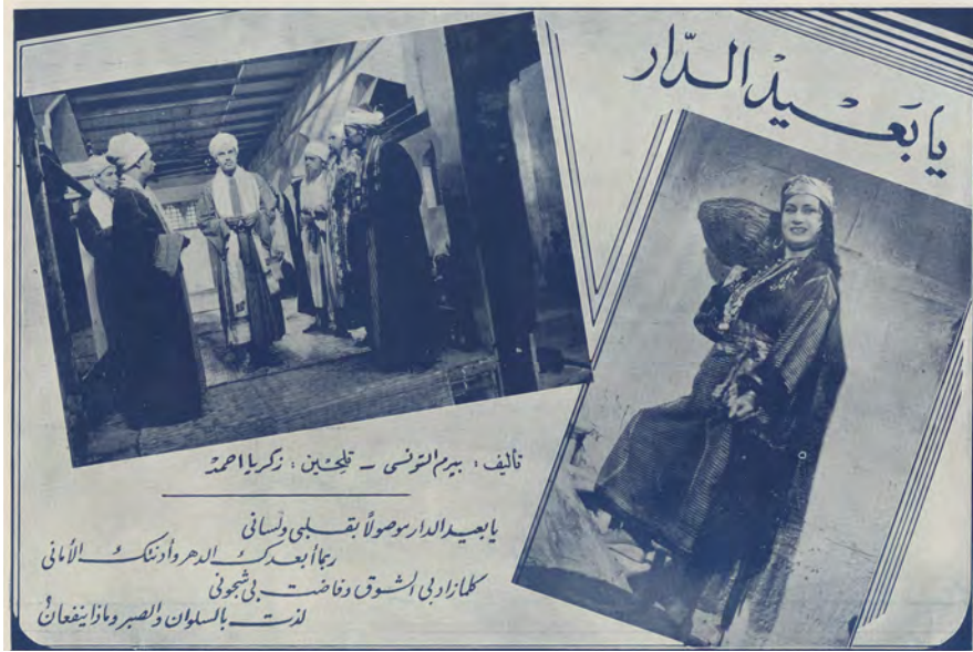
FIGURE 46. Collage: ‘Abd al-Rahman al-Qass (Yahya Shahin) in peasant dress (left, center); Umm Kulthum as Sallama (lower right). Pressbook for Sallama (Togo Mizrahi, 1945).

‘Abd al-Rahman elevates his desire by expressing himself in verse. The poem “Qalu: Uhibb al-Qass Sallama” (“They Say al-Qass Loves Sallama”), composed by Ba Kathir for the novel, adheres to traditional poetic form. 99 The short poem is modified for the film. The first line (in both versions) reads: “They say al-Qass loves Sallama / He is the pure, pious ascetic.” In the film, al-nasik , the world for “pious,” is changed to al-wara’ —a term that also implies timidity or cautiousness. In the original poem, the second line reads: “As if only the brazen, lethal seducer could already know desire.” By contrast, the version in the film eliminates the direct reference to seduction and changes the gender of the subject, replacing the line with the words: “As if only a brazen girl could know the taste of desire and love.” The poem is then set to music and sung by Umm Kulthum in Sallama’s voice. The power of the characters’ longing in the novel is reduced to the tepid, commonly accepted tropes of love and desire acceptable in popular song.