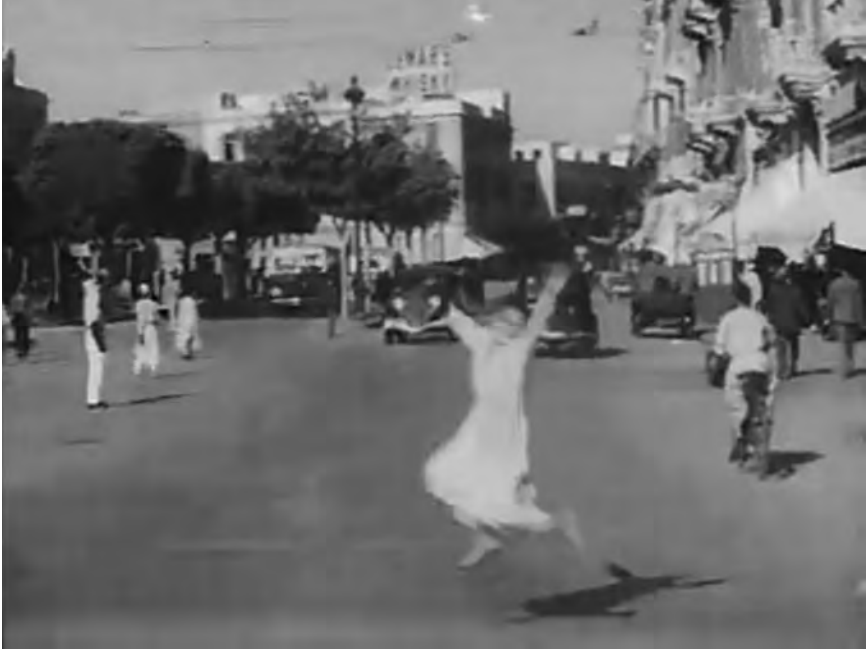
FIGURE 28. Manshiyya Square, Alexandria. Screenshot from Seven O'Clock (Togo Mizrahi, 1937).

Alexandria's eastern harbor. At the end of the shot, the camera has turned around, orienting itself inward toward Egypt, ad Aegyptum . In the diegesis, too, circular urban trajectories give way to a journey along a linear axis. From its position on the Alexandria seaside promenade, the camera points southward, establishing the trajectory of the narrative.