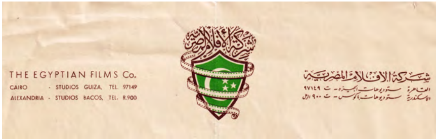
FIGURE 3. Letterhead for the Egyptian Films Company featuring the company logo.