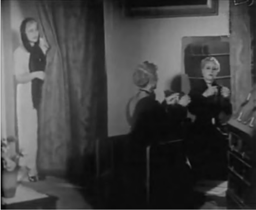
FIGURE 16. Nahid (Assia Dagher) watches Amina (also Assia Dagher) put on jewelry. Screen-shot from Wife by Proxy (Ahmad Galal, 1936).

into motion an extended masquerade. In Wife by Proxy , Nahid (Assia Dagher), a Lebanese country girl fleeing an arranged marriage, stows away on an Alexandria-bound passenger ship anchored in Beirut's harbor. The wealthy Egyptian Amina Hanim (also Assia Dagher) is returning home from a vacation in Istanbul. Nahid and Amina, both played by Assia Dagher, of course resemble one another (fig. 16). A Jewish jewel merchant named Cohen shows his wares to Amina Hanim and permits her to take some pieces back to her cabin to try on. Meanwhile, skirting away from a suspicious crew member, the stowaway, Nahid, takes refuge in Amina's cabin. There, she witnesses Amina's murder at the hands of a jewel thief. Recognizing her resemblance to the deceased, Nahid does the only sensible thing under the circumstances: she dons Amira's gown and strides into the ballroom, assuming her identity. On the boat, Nahid confronts the thief and insists that he return the jewels to Cohen. After disembarking, the thief, who has recognized Nahid, tries to blackmail her with threats to reveal her true identity. Nahid eventually metes out justice, shooting the jewel thief just as he had shot Amina.