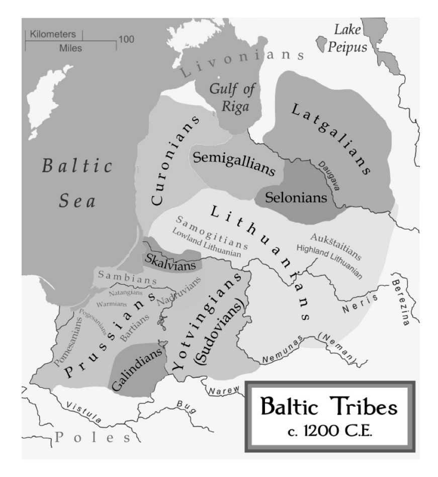
Map A: Approximate bounddaries of the Baltic Tribes c. 1200. By MapMaster (Wikimedia Commons) and distributed under a CC BY-SA 3.0 license