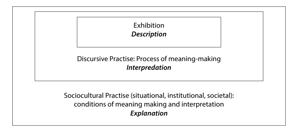
Figure 4: CDA framework for analysing museum exhibitions. Adapted from Grek (2005, p. 222).<sup>50</sup>

This three-step approach allows for an analysis of 'how narratives are built, what types of messages are put together and conveyed through the use of text panels [and] video, as well as specific choices of artefacts and artworks' (Grek, 2005, p. 220). CDA helps us to 'deconstruct the different layers of meaning by imposing a critical questioning of the visual communication' ( ibid. , p. 221). In addition, when describing the exhibition, attention was paid to the relative space devoted to different topics and their positioning for, as Hooper-Greenhill suggests, we should approach our analysis of museums in the same way as cartography, as both fulfil similar functions of delineating territories and power relations (Hooper-Greenhill, 2000, p. 17).