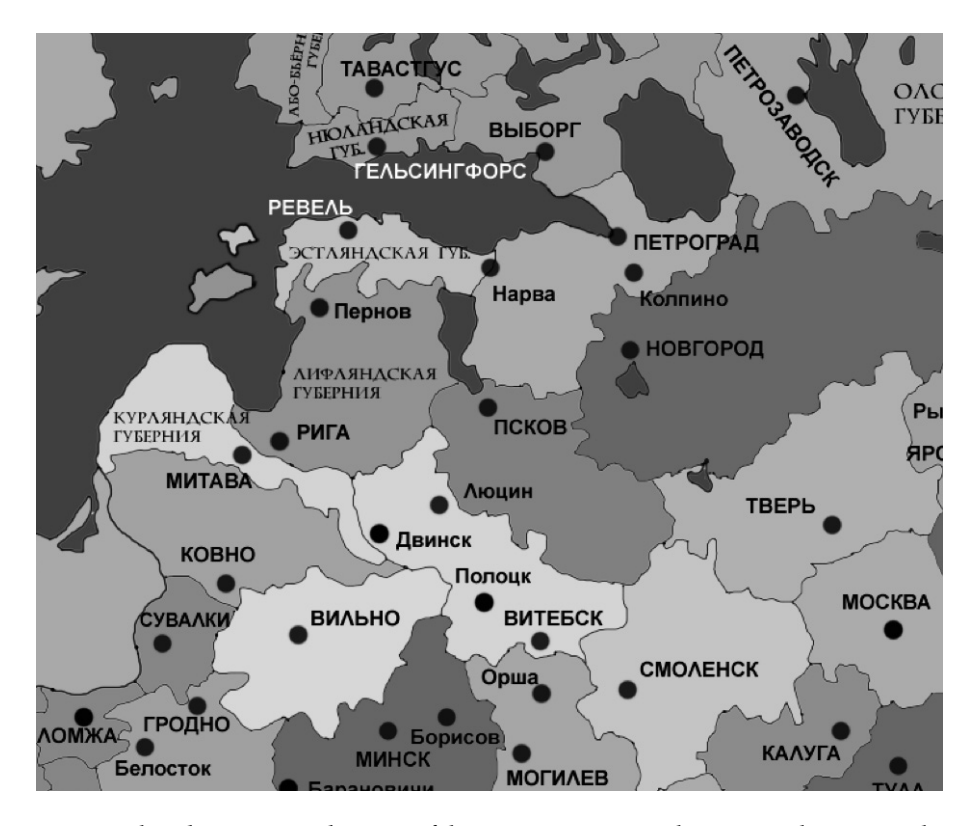
Map D: The administrative divisions of the Russian Empire in the nineteenth century. The author apologises that this map is in Russian, but there is a scarcity of maps of the Russian imperial provincial boundaries available in the public domain. Latgale is the territory to the north of the city of Двинск (Dvinsk/Daugavpils) in Vitebsk gubernia (beige). This is a cropped version of the map by Nicolay Sidorov (Wikimedia Commons) and distributed under a CC BY-SA 3.0 license