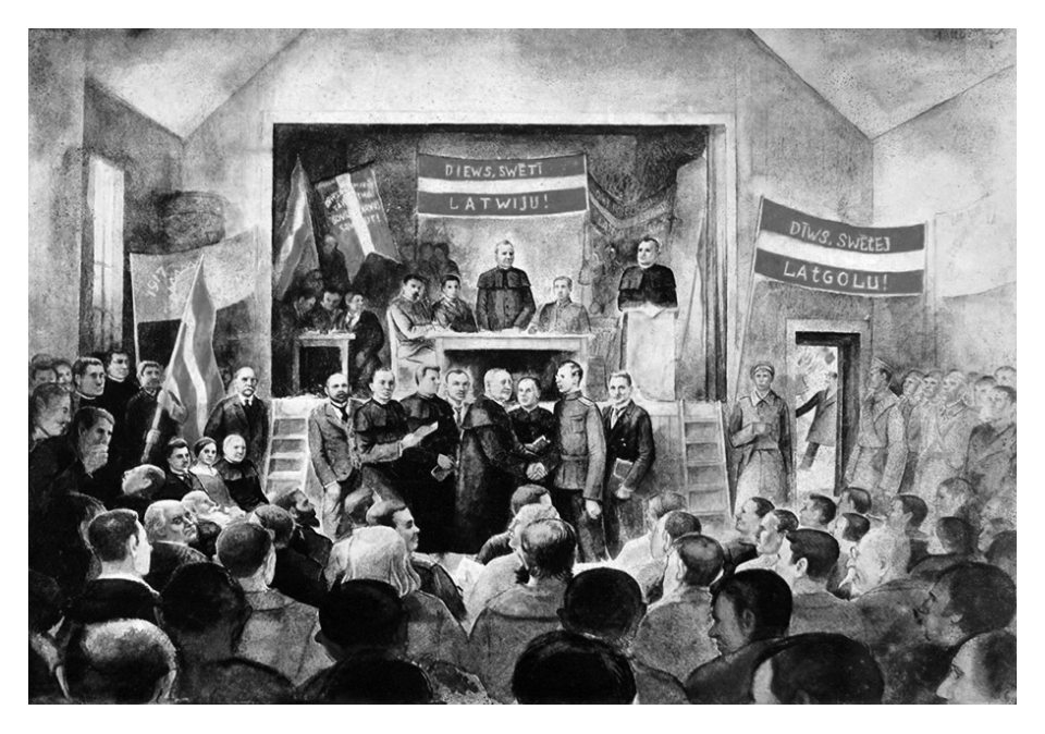
Figure 1: Poster of the First Latgale Cong ress in Rēzekne by Jēkabs Strazdins (1935). http://www.historia.lv/jaunumi/lnvm-iegust-20gs-30-gadu-plakatu-ar-1917g-latgales-latviesu-pirma-kongresa-ainu

Fast-forwarding now to February 2015, a print of the Latgale Congress poster was donated to the Latvian National History Museum (LNVM).<sup>4</sup> The news of the donation of the poster prompted journalists in Latvia to reflect once more on the importance of this event for Latvian History. As one journalist wrote, 'The history of the Latgale Congress is clear proof of the Latgalian political unity with other Latvians and call for the establishment of a territorially unified, autonomous Latvia' (Sprūde, 2015).<sup>5</sup> The media attention given to this event followed on from the commemoration of the 150<sup>th</sup> birthday of Francis Trasuns in Riga the previous May. Trasuns, a Catholic priest and important Latgalian literary figure, was one of the main organisers of the Congress and a supporter of Latvian independence in Latgale. A plaque was erected in his honour at St James's Cathedral in Riga ( Rīgas Svētā Jēkaba katedrāle ) (Juško-Štekele, 2014).