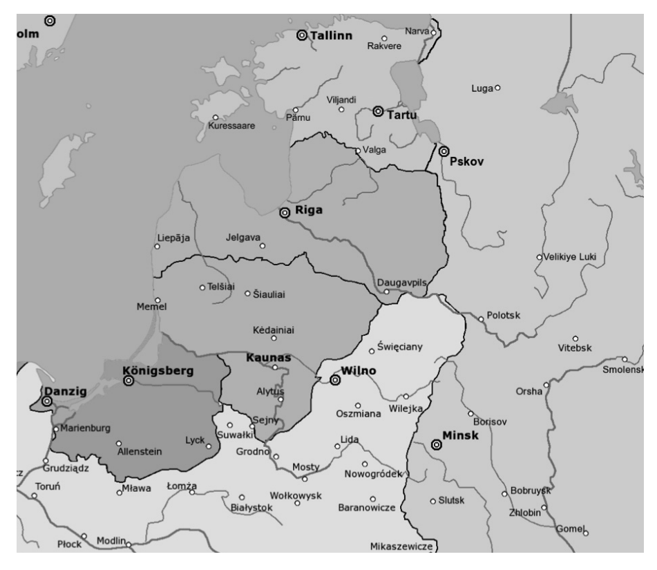
Map E: Interwar Latvia. This is a cropped version of the map by Halibutt (Wikimedia Commons) and distributed under a CC BY-SA 3.0 license