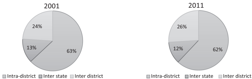
Figure 6.2 Distribution of internal migrants by type of movement.

A 2016 World Bank study on internal migration sheds light on this phenomenon by highlighting how despite internal mobility being a key driver of economic growth across regions, it may remain inhibited in India by the existence of state-level entitlement schemes – primarily, the inability to port social welfare measures for migrants, across state borders (Kone et al., 2017).