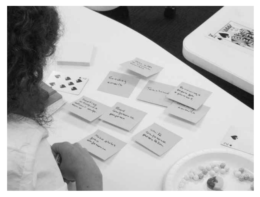
Figure 4.2: An Indie Interfaces Symposium attendee mulls over the tasks that comprise their average workday. Taken by a researcher during the taskscape workshop portion of the symposium. Photo by a member of the research team (Pierson Browne).

and each member of each group was instructed to use post-it notes to write out as many aspects of their daily routine as they could reasonably manage. Once finished, the post-it notes were sorted and grouped into a number of loose themes. The purpose of the exercise was to highlight commonalities across the seemingly disparate roles played by the cultural intermediaries in attendance; it also provided the researchers in attendance with a valuable source of information about the quotidian reality of performing cultural intermediation labour.