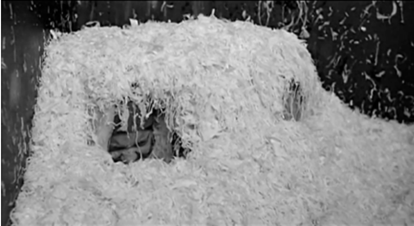
17. Precarious labour and contingent identities: Fariba/Siamak (Jasmin Tabatabai) hides in a vat of fermenting cabbage in Angelina Maccarone's Fremde Haut ( Unveiled , 2005).

mixing her/him into the kraut, a potent signifier for this hybridity (see Illustration 17).