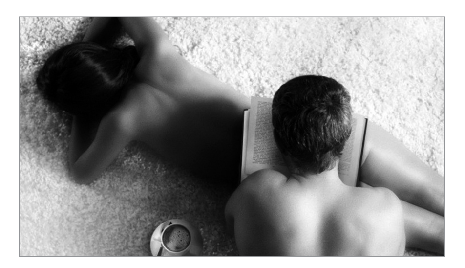
Fig. 3. Max and his nameless young lover

Max's representation is a trap set by the filmmaker for the viewer. (Segal's aptitude for such traps revealing the viewers' misjudgment is even more obvious in his next feature, A Film about Alekseev [Fil'm pro Alekseeva, 2014].) The majority of critics and viewers enthusiastically took Max's side, detecting in this character their own frustrations with the post-Soviet generation, governed by consumerist rather than cultural or historical signifiers. For some reason, however, many of Max's fans failed to notice that his wisdom is an agglomeration of the intelligentsia's clichés (including criminal songs, as sardonically noted by Abdullaeva [2012]) and that his girlfriend sincerely wants to learn from him, which he finds rather irritating. "We should talk more!" (Nam nuzhno bol'she razgovarivat'), she repeats as a mantra after each séance of their sensational sex.