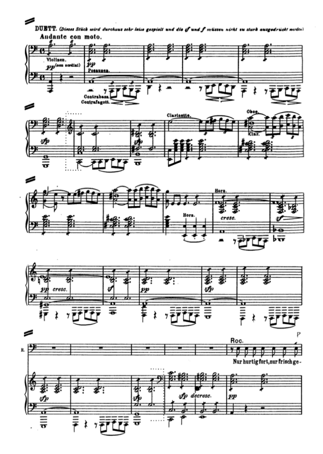
Fig. 4 Ludwig van Beethoven, Duet (No. 14), Leonore (1805 version) (Leipzig: Breitkopf and Härtel, 1905), pp. 189–90. Public domain.

strong sense of threat, while below that, low in the bass, the bassoons and cellos keep their heads down and get on with their work. Only the clarinet and then the oboe attempt to lift a lantern in the gloom (Figure 4).