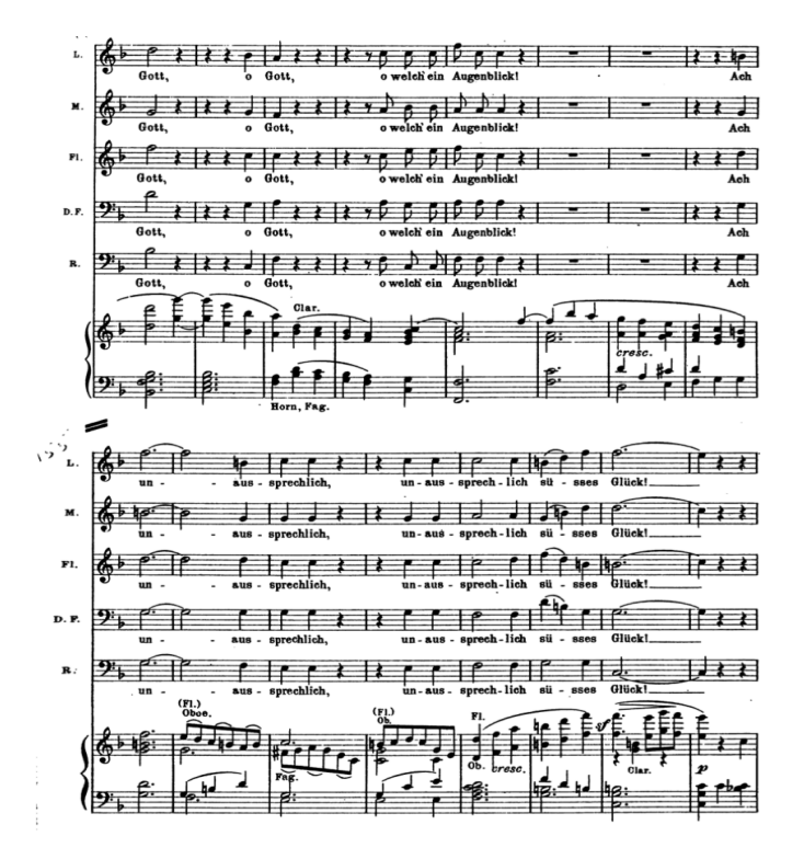
Fig. 2 Ludwig van Beethoven, 'O Gott, Welch ein Augenblick', Leonore (1805 version) (Leipzig: Breitkopf and Härtel, 1905), pp. 246–47. Public domain.

In 1806 Beethoven was persuaded to cut this sublime number—the true climax of the opera in 1805—from 97 bars to 53, and also, intriguingly, to give the first line of it to the Chorus, the very same Chorus that had been clamouring for Revenge a few bars earlier, with the soloists, including Leonore and Florestan, only joining in afterwards.