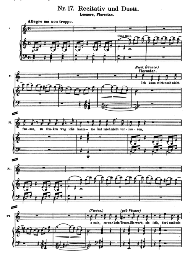
Fig. 1 Ludwig van Beethoven, Recitative und Duett 'O namenlose Freude', Leonore (1805 version) (Leipzig: Breitkopf and Härtel, 1905), p. 221. Public domain.

immediately this is thrown into doubt when Rocco the jailer seizes Leonore's pistol and rushes out without a word. In these incarnations, which are very much in the spirit of Bouilly and Gaveaux, the lovers' duet 'O namenlose Freude' is sung in the full expectation that Pizarro will soon return to kill them. So their joy is the joy of being reunited, with no expectation of being freed. What is more, in this version, the duet is prefaced by a long recitative, in which the fragile air of hope, which is strongly identified with the oboe in this opera, repeatedly blooms and dies (Figure 1). Thought to slow down the action unnecessarily, all such anticipatory yearnings were cut in 1814.