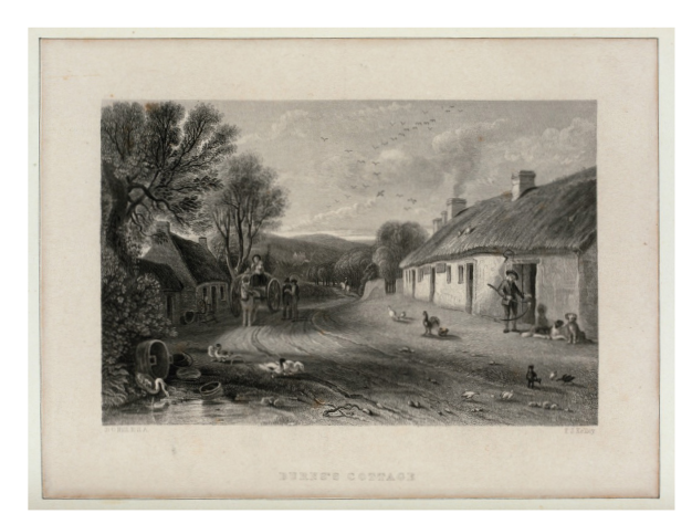
Fig. 5 David Octavius Hill, Burns's Cottage (1880), The Miriam and Ira D. Wallach Division of Art, Prints and Photographs: Print Collection, The New York Public Library. The New York Public Library Digital Collections. Fair use, https:// digitalcollections.nypl.org/items/510d47da-f8f0-a3d9-e040-e00a18064a99

Keats's steps on his walk are undoubtedly guided by his wish to see what these other poets had seen. The temporality and topography of the walk is then partly determined by a time projection, as Keats strove to walk in other poets' elusive footsteps,<sup>32</sup> so as to revive the text and experience it in the landscape and in the time of perception. What is established then is a form of time coincidence between the memory of the text, its inscription in space and the poet-walker's involvement in the landscape, a process Keats performs by using his imagination, his eyes and his walking body.