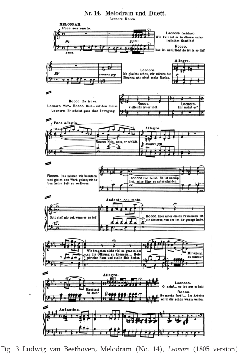
(Leipzig: Breitkopf and Härtel, 1905), pp. 188–89. Public domain.