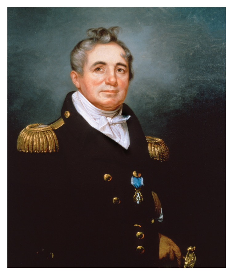
FIGURE 7. Commodore Joshua Barney of Baltimore, Maryland, one of the many ship captains the U.S. government rescued from the Caribbean as part of its neutrality policy. (Maryland Historical Society; painted by Rembrandt Peale 1817)

Skipwith's efforts to aid Americans trapped throughout the Caribbean came to an abrupt end with Britain's capture of Martinique in March 1794. Unable to conduct consular or any other business on the war-torn island, Skipwith returned to the United States a month later. (His meandering journey to Philadelphia included the British navy seizing and impounding his ship.)<sup>11</sup> He quickly returned to consular and diplomatic duties, accompanying the newly appointed minister to France, James Monroe, to serve as consul general to the legation.<sup>12</sup> In May 1794, Congress authorized $900 to reimburse the "just and reasonable expenses incurred by Fulwar Skipwith, in relieving the wants, and facilitating