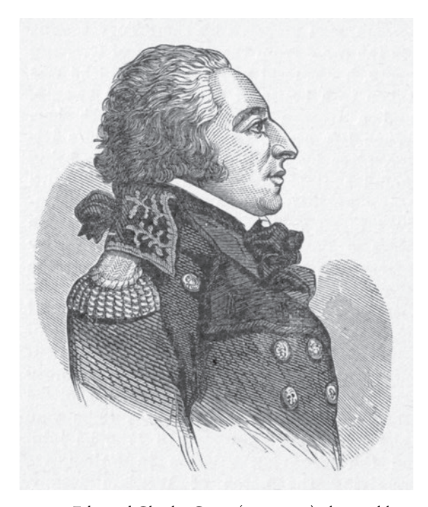
FIGURE 5. Edmund Charles Genet (1763–1834), the troublesome minister from France whose antics affirmed the necessity and wisdom of the neutrality policy.

Genet's tenure proved to be controversial from the outset, thanks to the ambitious and unrealistic instructions the idealistic Girondins, who now ruled the French republic, gave him. First, Genet was encouraged to form a "national pact" with the United States to renew the commercial and political bonds that had linked the two nations. In addition, he was supposed to seek advance payment of America's Revolutionary War debts to support France's wartime economy, to foster expeditions into Spanish Louisiana and Florida, and to liberally interpret the privateering provisions of the Treaty of Amity and Commerce by offering French commissions to Americans willing to serve as privateers or as soldiers on expeditions against Spanish territory. Amid these blatant challenges to U.S. sovereignty, Genet was also told to respect the federal government and its authority.<sup>30</sup>