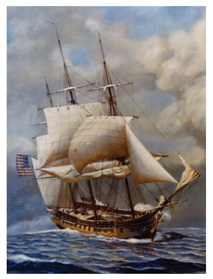
FIGURE 6. The USS Constellation , one of the six original warships that made up the U.S. Navy in the 1790s.

Among the military legislation was the Naval Armaments Act, which authorized the construction of the six vessels, with four mounting forty-four guns and the remainder thirty-six. In his plans for building the nation's first navy, Knox sought frigates that "combine the greatest possible force, with adequate strength, and swiftness of sailing, so as to render them equal or superior to any ships . . . belonging to the powers of Europe." In distributing them, Knox acknowledged that "the government is the government of the whole people," and he proposed that the busy ports of Charleston, Norfolk, Baltimore, Philadelphia, New York, and Boston each receive one of the warships. <sup>94</sup> On June 3, Washington nominated six officers who would serve as captains of the ships. <sup>95</sup> With the help of these newly