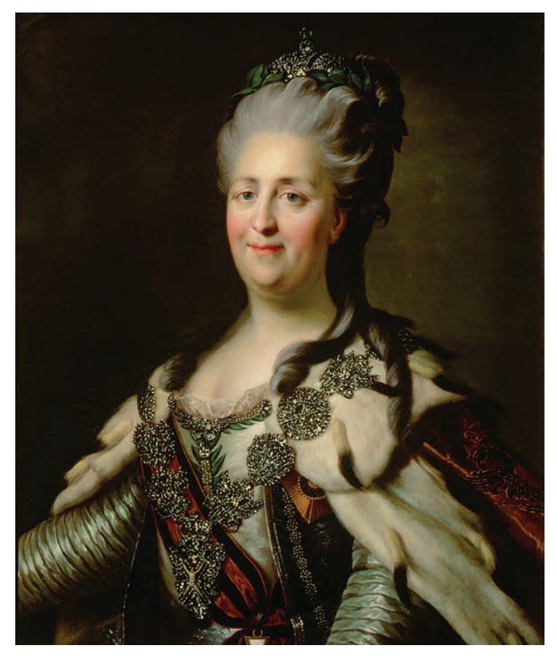
FIGURE 2. Catherine the Great, who organized the League of Armed Neutrality in 1780 to shield Russia and other smaller nations from belligerent actions during the American Revolution. (painted by J. B. Lampi, ca. 1780)

British transgression) provided the violation Catherine needed to launch her diplomatic offensive on neutrality. ^{43}