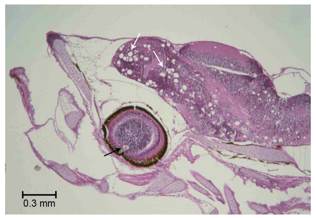
Fig. 1. Histological preparation of a sea bass larva (age 45 days) with the typical vacuolar necrosis of the brain tissue and in the retina (indicated by white and black arrows, respectively). After the collection, the sample has been readily fixed in 10% neutral buffered formalin for not more than 7 days. Thereafter it has been included in paraffin to be cut in to sections of 5 µm and then colored for histological analysis. The dye used in this histological section is hematoxylin-eosin.

reason histological analyses have often been performed in monitoring programs to evaluate the spread of the disease in the hatcheries (Sweetman et al 1996).