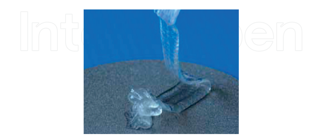
Figure 2. DAC<sup>®</sup> HA-g-PLA, fast-resorbable, hydrogel coating. Composed of covalently linked hyaluronan and poly-D, L-lactide, the "Defensive Antibacterial Coating" (DAC<sup>®</sup>, Novagenit Srl, Mezzolombardo, Italy) is the first antibacterial coating cleared for clinical use in orthopedics, trauma, dentistry and maxillofacial surgery in Europe.

Composed of covalently linked hyaluronan and poly-D,L-lactide, the "Defensive Antibacterial Coating" (DAC<sup>®</sup>, Novagenit Srl, Mezzolombardo, Italy) was specifically developed in order to protect implanted biomaterials used in orthopedics, traumatology, dentistry and maxillo-facial surgery from bacterial colonization [24, 48] ( Figure 2 ).