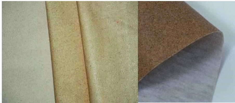
Figure 1. Vegan leather solutions based on sawdust (left) and coffee grounds (right).