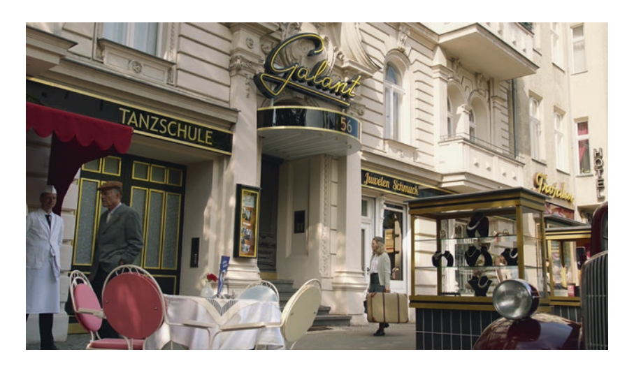
Fig. 5.23 The film's historical world in KU'DAMM 56