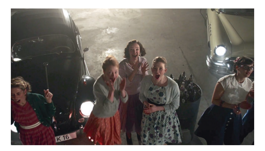
Fig. 6.12 Iconic symbols of the 1950s in KU'DAMM 56

To describe this phenomenon more precisely, I shall draw on Christian Metz's psychoanalytic work on cinema and dream. Metz believes that true illusion can only exist in dreams, <sup>51</sup> while in cinema we can always discern a certain "impression of reality." <sup>52</sup> For Metz, immersive film experience has more in common with daydreams: