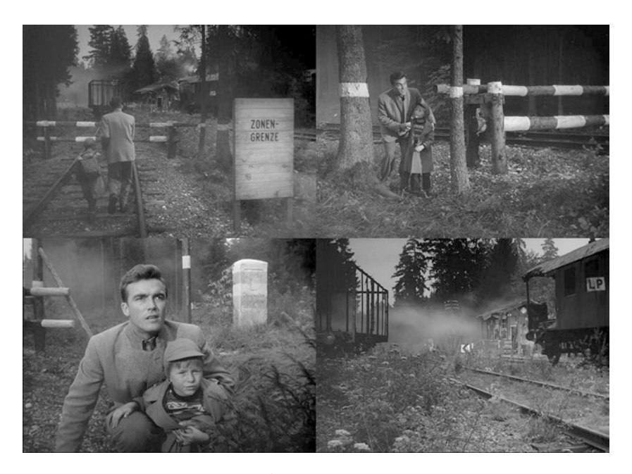
Figs. 6.1–6.4 Menacing atmosphere in SKY WITHOUT STARS

It is not just the visual information that evokes a vague air of menace, but also the dark tonal sequences of the score. The atmosphere permeates everything. Like a "nebulous primal matter" or "aroma," it envelops all