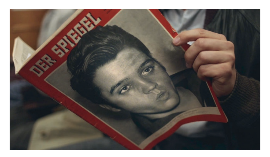
Fig. 8.1 Plurimedial constellations: Elvis on the cover of Spiegel in KU'DAMM 56

Haley's hit was rushed into production. ROCK AROUND THE CLOCK (1956; dir. Fred F. Sears) played a pivotal role in the worldwide breakthrough of rock 'n' roll as a pop cultural phenomenon. Intermedial references like the Spiegel cover and Haley's hit thus not only expand histospheres to include cultural and social discourses, but also embed them in a "complex social network,"89 thereby marking out historical films as not just a genre but part of a plurimedial constellation capable of forming and constituting history. According to sociologist Manuel Castells, in today's "network society" geographical proximity matters less than relational proximity, 90 which genres help to produce. The way in which the dominant processes and functions in plurimedial networks are organized also significantly contributes to the dissemination of films. A historical film's potential influence will be realized "to the extent that the film is plurimedially disseminated orally, textually, or visually."91 Sabine Moller infers from this that the significance and reach of a film rise in proportion to the quality of the networks in which it is embedded, and so also the probability that it will "shape collective processes of memory."92 Plurimedial networks thus not only play a key role in the dissemination and appropriation of individual historical films, but also contribute to the refiguration of historical consciousness.