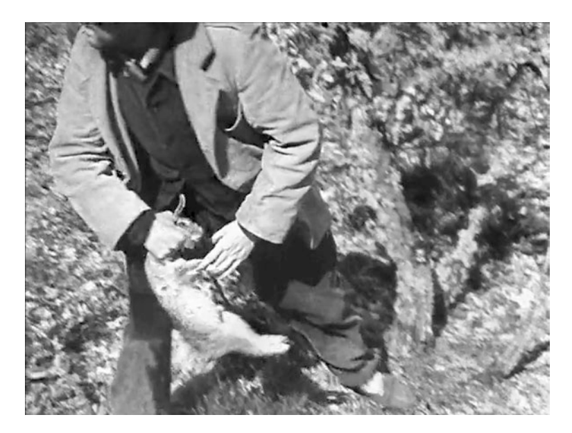
Fig. 7.4 Documentary consciousness: the dead rabbit in the Rules of the GAME

making it possible to experience the film's historical world as a physical reality. The imaginative illusion thus usually remains intact while also being given the validation of factual historical authenticity. However, there can be a discrepancy between filmic figuration and historical reference; for instance, if we do not find an actor "believable" in the role of a historical figure. Such cases will seriously undermine our imaginative empathy and immersive involvement.