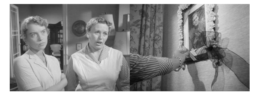
Figs. 3.1–3.2 Incorporation of a photograph into the framing and montage of SKY WITHOUT STARS