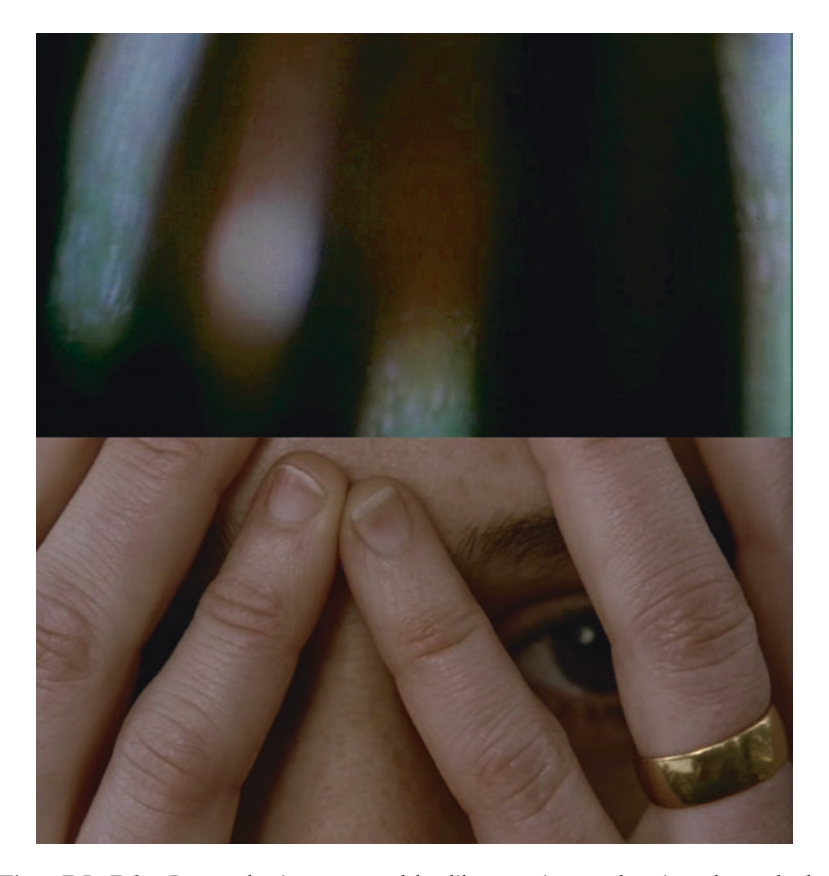
Figs. 7.1-7.2 Remembering personal bodily experience: the view through the protagonist's fingers in THE PIANO

had not yet reflectively grasped<sup>17</sup> implies that she was unconsciously accessing memories of earlier physical-sensory experiences. A film's specific audiovisual configurations trigger the spectator's embodied memory, <sup>18</sup> with haptic and tactile experiences occupying a privileged position in the process. As well as visually depicting surface textures, film can also impart information about the filmic world's material constitution through sound. "Materializing sound indices"<sup>19</sup> like the dull, shuffling steps on the parquet floor in the dance school in KU'DAMM 56 evokes different embodied memories than, say, the crunching of gravel on pavement. A histosphere's