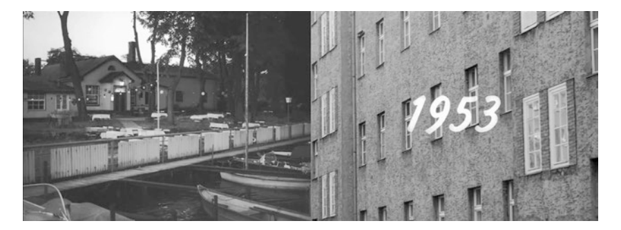
Figs. 2.11–2.12 Cinematic time travel in YEARS OF HUNGER