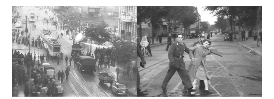
Figs. 2.15–2.16 Use of archival footage in YEARS OF HUNGER