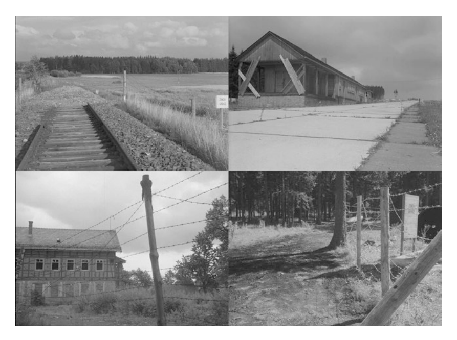
Figs. 5.2–5.5 Image space and perspective in SKY WITHOUT STARS

also a temporal figuration. In the first moments of SKY WITHOUT STARS, the time of the action appears to be standing still, and the space in which the action unfolds can only be vaguely mapped out. Only when the music briefly falls silent, the narrator dates the events to "late summer 1952," and the camera pans from the closed-off railway bridge to the river along the border do we get the impression that the filmic world is now opening up so that the narrative can begin. The camera jumps to a lightly wooded area and tilts down, following the refugees emerging from the trees. The interactions between the characters and the filmic world constitute a "space of narrative action." The refugees always move from right to left. Even when the camera follows the smuggler with a long pan in the opposite direction, fixed visual points like the wood, the bridge, and the border river established at the start allow us to keep our bearings (Figs. 5.6, 5.7, 5.8, and 5.9). The individual image spaces are connected by the movements in front of the camera as well as the movement of the camera itself, and by the audiovisual montage. The consistent light design and the establishment of an auditive space across shots create continuity.<sup>47</sup> This