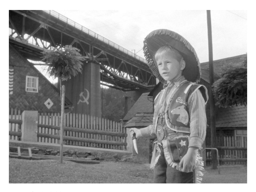
Fig. 7.5 A children's game in sky without stars

The resonating images thus activate tap into primordial experiences such as moments of interpersonal touch, basic sensory impressions, or simple, universally relatable everyday events or encounters. Often, the underlying embodied memories are the result of media experiences. I do not need to have strolled down Kurfürstendamm myself in the 1950s to