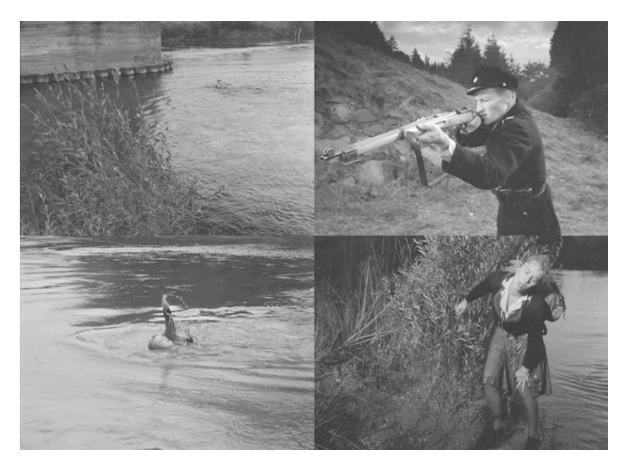
Figs. 5.12–5.15 A filmic space in sky without stars in which spectators can "move around"

linked to particular characters. Quite the contrary: No location is inaccessible to the camera, even if it appears to be floating over the water. The physical laws of the "space of narrative action" matter little to the camera. Instead, the individual filmic spaces stand in a narrative chronology in which the filmic world is gradually disclosed through our perception of camera movements and montage.<sup>68</sup> "The work grows step by step into a whole, and as we accompany its progress we must constantly hark back to what has disappeared from direct perception by ear or eye, but survives in memory," as Rudolf Arnheim writes.<sup>69</sup> A similar form of perception can also be observed in the activity of the historian, who successively studies the available sources and relates them to each other.<sup>70</sup>