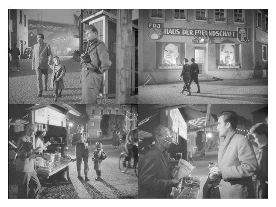
Figs. 6.5–6.8 Change in atmosphere in sky without stars

contributes to the narrativization of history. The dramaturgy of atmosphere has the potential to steer and direct our perceptions of the historical world constructed by the film at an affective and emotional level, and thus also the conceptions and interpretations of history we derive from it.