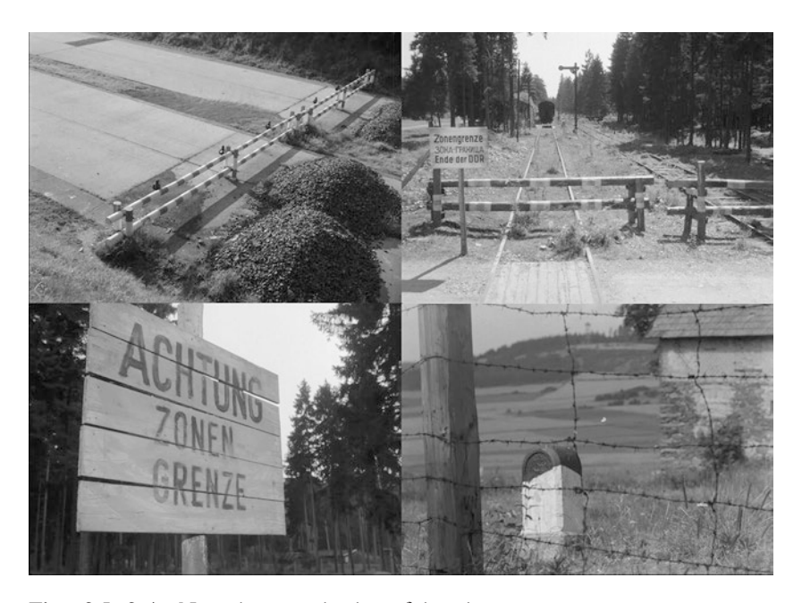
Figs. 2.1–2.4 Narrative organization of signs in SKY WITHOUT STARS

Viewed through the lens of semiology, the concept of the histosphere is closely related to Russian semiotician Jurij Lotman's notion of the "semiosphere." Based on Vladimir Vernadsky's concept of the biosphere, the semiosphere is a model of a semiotic space that is both "the result and the condition for the development of culture." Every "language" (which for Lotman explicitly also includes cinematographic expression) is immersed in a semiosphere with which it stands in a close reciprocal relation. The semiosphere of a "language" is in turn surrounded by other semiospheres, which are always connected to a culture's total semiotic