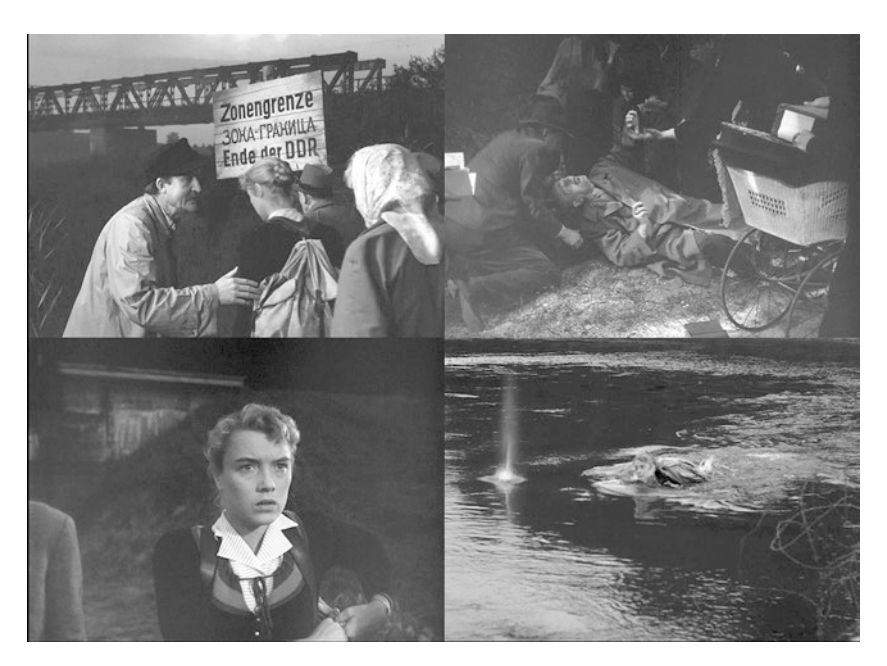
Figs. 1.1–1.4 Subjectivized experience and close identification with the protagonist in SKY WITHOUT STARS

issue, in my study I shall primarily investigate histospheres as an element and phenomenon of historical fiction films. I implicitly acknowledge that specific forms of this phenomenon can also be found in documentaries and other nonfictional film types, but believe that a theory of how histospheres operate in nonfiction films would require further work and cannot simply be tacked onto a discussion of their functioning in fiction films.