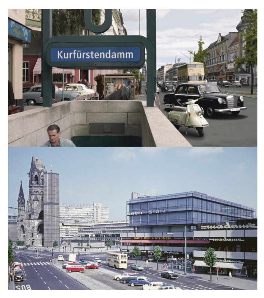
Figs. 5.17–5.18 Faded colors in KU'DAMM 56 and in a contemporary photograph

of visual and aural elements of film grants us an intentional mode of access to history that interacts with our media-influenced conceptions of history. The notion of a chronotope, referring to a narrative "increase in density and concreteness of time markers—the time of human life, of historical time—that occurs within well-delineated spatial areas" that serve as the "primary point from which 'scenes' [...] unfold,"<sup>113</sup> is thus also highly