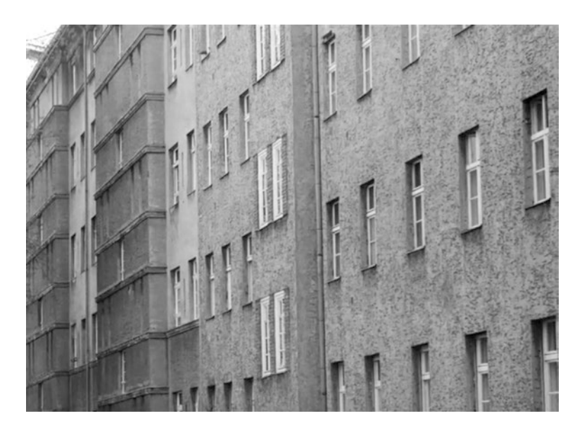
Fig. 7.6 Universally relatable settings in YEARS OF HUNGER

mirror-image.<sup>87</sup> By contrast with Deleuze, who transposes the immanence of the virtual onto the ontology of the film image, 88 here I shall concentrate primarily on a phenomenological interpretation of Bergson's theory, in full awareness that this goes beyond the epistemological limits of his reflections. Embodied film experience as described by Sobchack integrates the virtual images and sounds of a film into our perceptions of "physical reality."89 This process of connecting virtual to actual enables film experience to elicit a kind of doubling effect in the spectator. However, this is not Bergsonian déjà vu in the strict sense—the symptoms are the same: the intense feeling of already having lived through the present moment. But the present moment in question is not the moment of reception. That is, the feeling here is not that of already having seen a film like this, rather, in the very moment of perception we feel as though we ourselves can recall the film's events. The embodied film experience overrides the virtuality of the filmic world, allowing it to be experienced in the present and falsely linking it to a vague memory. As Bergson puts it, memory is animated by the film's "sensori-motor elements."90 Their ability to latch onto a wide range of extra-filmic experiences makes reminiscence triggers ideally suited