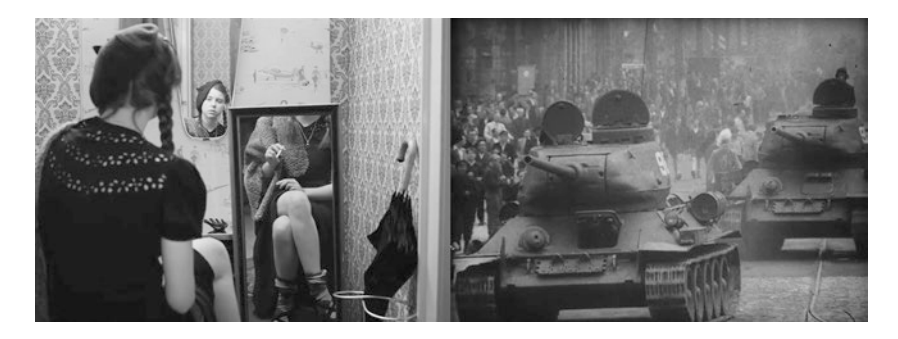
Figs. 6.9–6.10 Differing material qualities: aesthetics of New German Cinema and archive footage in YEARS OF HUNGER

Atmospheres evocative of historical films can shape histospheres in various ways. For instance, the black and white footage, slightly crackling sound, and traditional score of Helmut Käutner's sky without stars lend it the character of a historical document. This effect is reinforced by the fact that the film was made just three years after the time it is set. In Jutta Brückner's years of hunger, meanwhile, historical archive footage from the 1950s is spliced into fictional sequences. The camera's observing stance, the electronic music, the main character's way of speaking, and various other details, however, represent aesthetic strategies of New German Cinema. As a result, the fictional sequences have a markedly different atmosphere than the grainy, flickering, and scratched archive footage (Figs. 6.9 and 6.10). This abrupt shift in atmosphere draws attention to the nearly thirty-year gap between the different layers of the film's historicity, thereby opening up space for reflection. The opposite effect is achieved by the slight decoloration of the images in Sven Bohse's ku'damm