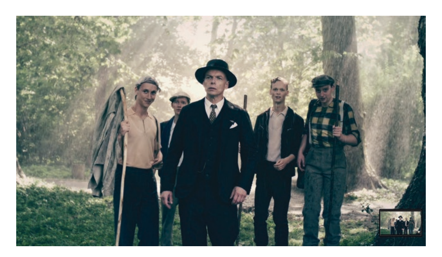
Fig. 6.18 Empathy and "social field" in KU'DAMM 56