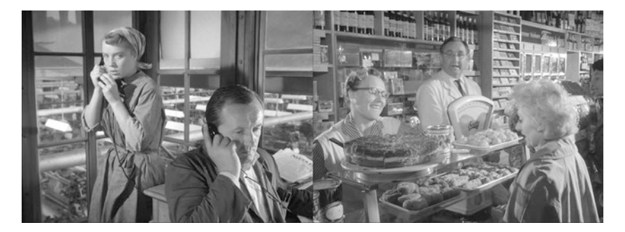
Figs. 5.10–5.11 East German surveillance and West German consumerism in SKY WITHOUT STARS