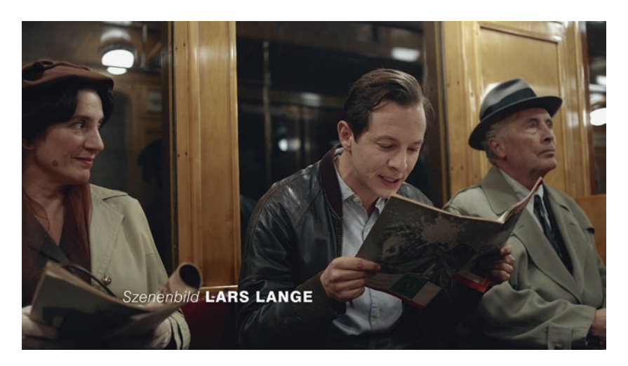
Fig. 5.16 Staging of history in KU'DAMM 56