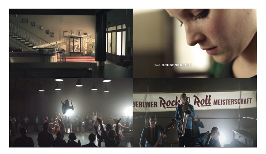
Figs. 2.7–2.10 A personalized historical experience in KU'DAMM 56

action must be based on documentable historical events (by contrast with costume dramas).<sup>37</sup> Robert Rosenstone adds the further condition that a historical film "intersects with, comments upon, and adds something to the larger discourse of history."<sup>38</sup>