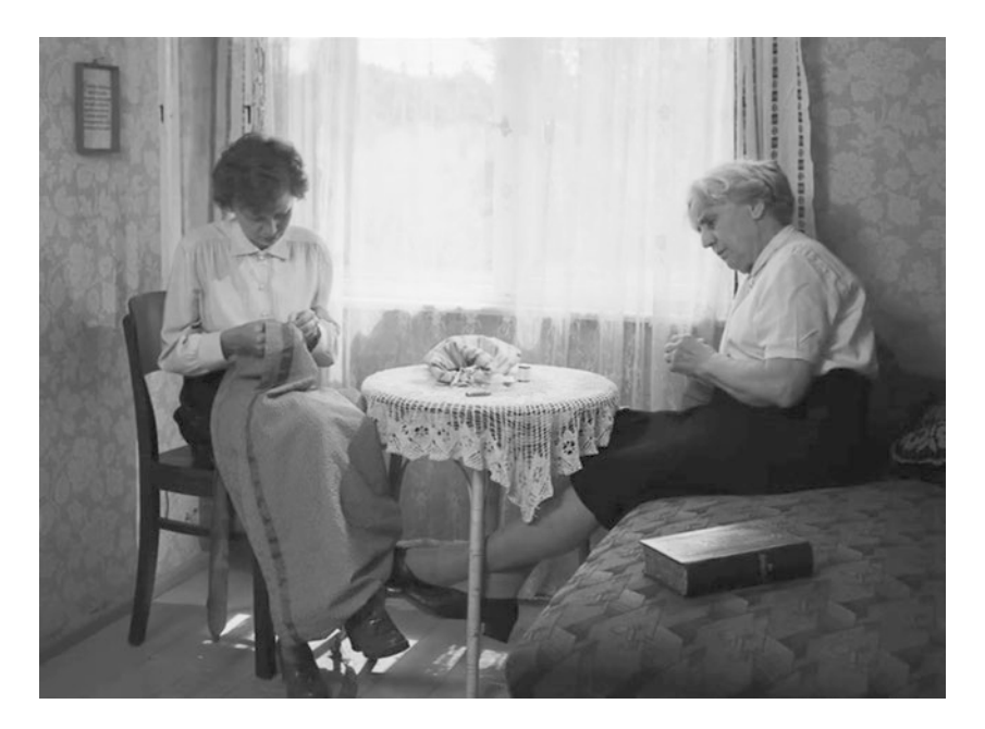
Fig. 7.3 Tactile resonance: fabrics in YEARS OF HUNGER

The medium of this resonance is the skin, which represents less a boundary or dividing line between subject and world than a "semipermeable membrane [...] that brings world and subject into relation and makes them mutually receptive and porous."<sup>21</sup> With regards to film's synesthetic