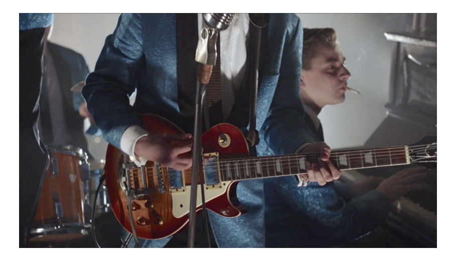
Fig. 3.3 Synchronization of image and sound in KU'DAMM 56