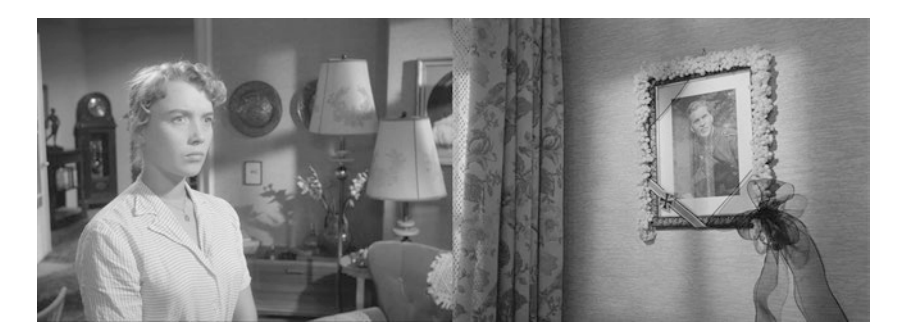
Figs. 2.5–2.6 Audiovisual metaphor for the war in SKY WITHOUT STARS

expression. However, while in the 1950s this device would have been able to awaken German audiences' memories of their own lived experiences, for modern spectators it can only be comprehended indirectly, by reference to other audiovisual or written representations. What this shows is that filmic signs "evolve." Which of the references in the historical cosmos of signs spectators will actually pick up on depends on their individual historical experiences and knowledge.