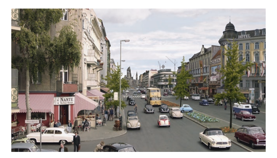
Fig. 5.1 1950s flair in KU'DAMM 56

When Monika walks down Kurfürstendamm for the first time in KU'DAMM 56, the spectator is flooded with audiovisual details from the 1950s. The stores, the cars, the clothing of passersby, the bombed-out Gedächtniskirche in the background: Moving images and sounds are woven into a complex historical world (Fig. 5.1).