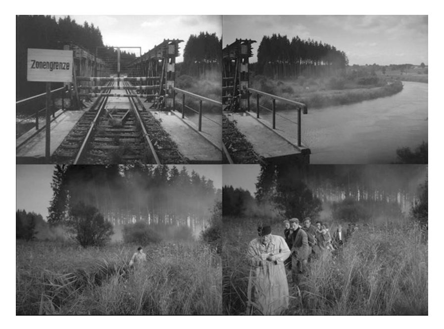
Figs. 5.6–5.9 Spatial orientation in sky without stars

means the historical world configured by the film is not merely a "space of narrative action" that the characters can move about in, but also a cohesive "filmic space" experienceable by us spectators.<sup>48</sup> The limited number of locations in which the action unfolds is in line with the narrative need for a small, bounded cosmos; however, as a filmic world, this cosmos nevertheless also points beyond itself.