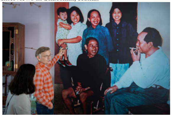
Visiting Mao Family Restaurant in Xiangtan, Hunan on November 12, 2019