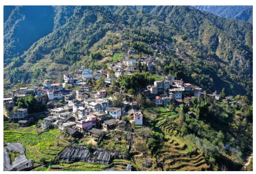
Panoramic view of a village in Nujiang Lisu Autonomous Prefecture