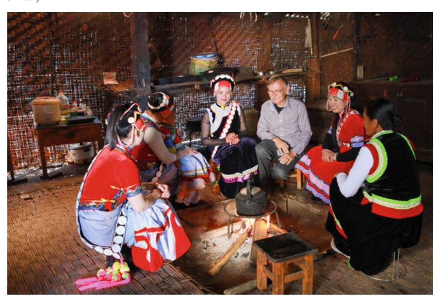
Interviewing a Lisu family, December 10, 2019