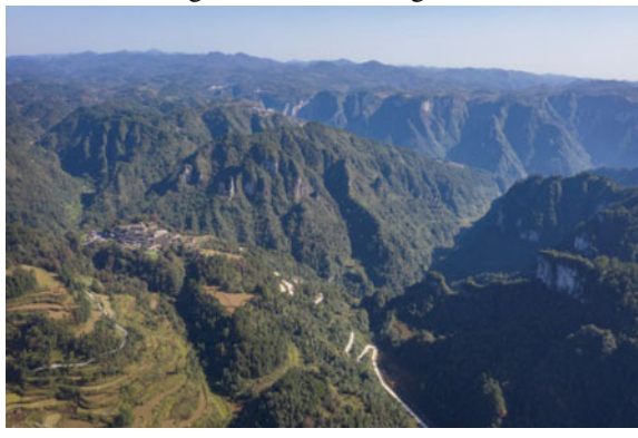
Eighteen Caves Village is secluded deep within Hunan's mountains