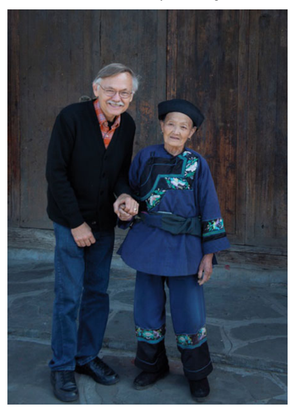
Taking a photo with a Miao grandmother in Eighteen Caves Village, Hunan, December 11, 2019