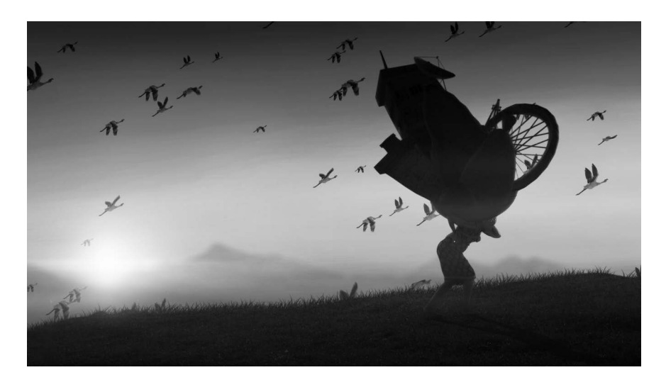
Figure 1.1 Still from The End of carrying All by Wangechi Mutu, 2015. Threescreen animated video (colour, sound). 9 minutes 27 seconds loop. Edition of 3.

Kenyan-born, transnationally based artist Wangechi Mutu transports us to a surreal and metamorphic terrain of mobile female identity in her 2015 video piece The End of carrying All. <sup>2</sup> Set in an unidentified landscape that might best be characterised as something between apocalyptic no-man's land and natural utopia, this three-channel, nine-minute twenty-sevensecond video installation focusses on an anonymous woman – played in