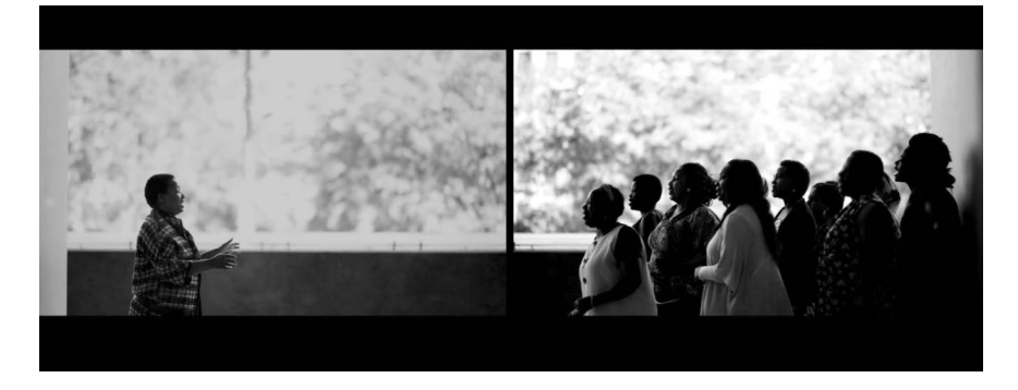
Figure 4.2 Still from Hear Her Singing, Charwei Tsai, 2017.

While inciting a cosmopolitan connectivity, though, what also resonates across these recordings is the disparity between the physically present body of the Women For Refugee Women performers and the vocal anonymity of