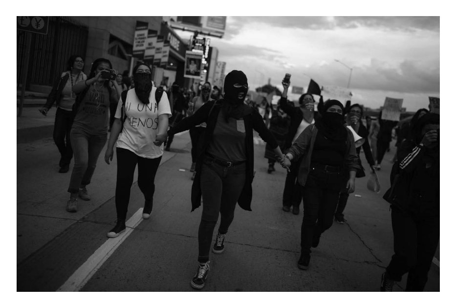
Figure 1.2 Feminist activists protesting at the Tijuana border, Mexico.

women's situated, embodied, and 'materialized...agency'.<sup>57</sup> For these feminist discourses expose a desire not simply for gendered awareness but for societal change. Certainly, this drive towards material intervention has been implicit in previous waves of gender-conscious scholarship on forced migration. Yet it is the contention of this book that twenty-first-century engagement with women's forced migration must acknowledge its intersection with the larger fourth-wave global feminist movement that is currently responding to the mobile and shifting forms of intersectionally gendered, raced, sexualised, and economically determined disenfranchisements circulating around women's mobilities.<sup>58</sup> These interrelationships have not yet been extensively chartered in Forced Migration Studies to date, which tends to distance itself from overtly feminist or activist stances. Rather than signalling a new trend in women's twenty-first-century forced migration, then, the connections that I forge between social, political, geographical, cultural, activist, and critical feminist movements reveal a new approach to women's forced migration. This approach recognises forced migrant women not simply as subjects of vulnerability and need but as agents, activists, allies, and as the very galvanising force of a necessarily mobile twenty-first-century feminism.