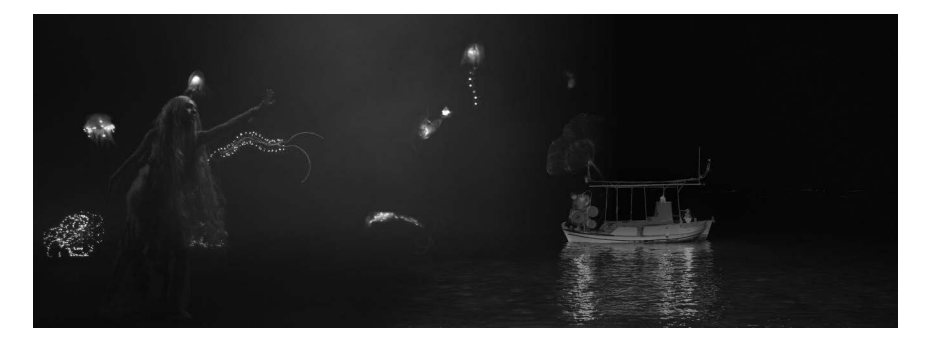
Figure 5.2 Still from One Emerging from a Point of View by Wu Tsang (2019).

rescue vessel in to safety. Drawn into symbiotic existence through these visual 'feelers', Tsang thus conjures the island's 'oddkin' as those connected through their tentacular abilities to 'feel' for others. These are abilities that arise from the shared experience of reaching out to those engaged in the act of crossing over, but which also bring about forms of transformation – psychological and social – in all those who make such tentacular connections.