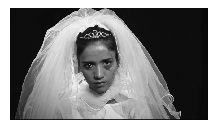
Figure 3.3 Still of Sonita in her video 'Brides for Sale', featured in Rokhsareh Ghaem Maghami, dir., Sonita (2016).

is applying not only eyeliner but a barcode to her forehead – a stark representation of her commodified status as 'bride for sale'.