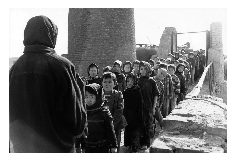
Figure 3.1 Still from 'God, Destruction and Construction' by Samira Makhmalbaf. Short film contribution to Alain Brigand, 11.09.01, September 11th, A Film (2002).

Afghan women's displacement constitutes a severe but lesser-publicised 'mobility crisis' than those population flows that have proven more readily visible to Europe in the twenty-first century (such as the Syrian 'crisis', explored in Chapter 2 of this volume).<sup>7</sup> As a phenomenon that spans this century and the last, however, it represents one of the longest-running displacement crises in the world and attests to the longstanding status of the country as a site of transnational leverage between superpowers.<sup>8</sup> Population movements have been continual and complex, but military conflict has been a constant driving force. In the late 1980s, some 5 million Afghans became refugees as a result of the Soviet Invasion, the legacy of which meant that 'when American bombardment began in October 2001, 3.6 million Afghans remained refugees, mostly in Pakistan and Iran, while at least 700,000 more were internally displaced'.<sup>9</sup> The United Nations High Commissioner for Refugees notes that today Afghans remain the largest protracted refugee population in Asia, though the number of internally displaced people peaked in 2002, at 1.2 million.<sup>10</sup> Significantly, the landscape of Afghan displacement is a feminised one: as Judy Benjamin has noted,