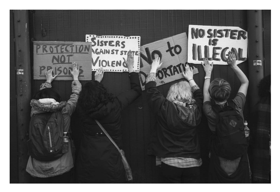
Figure 4.1 Protestors create a 'wall of sound' around Yarl's Wood, Bedfordshire.