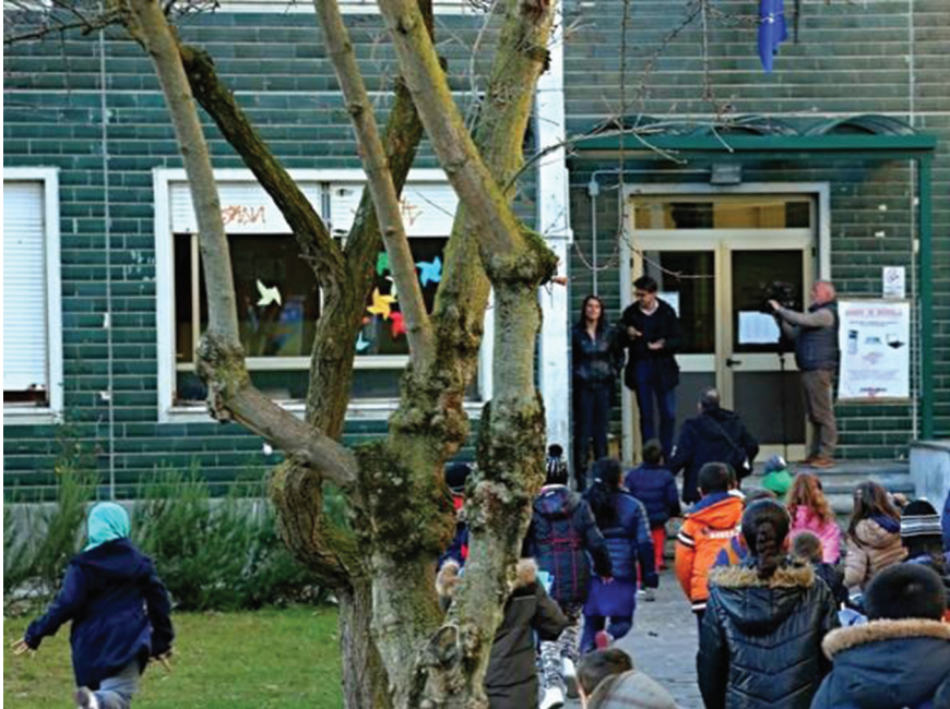
FIGURE 8.4 Children running towards a school's entrance