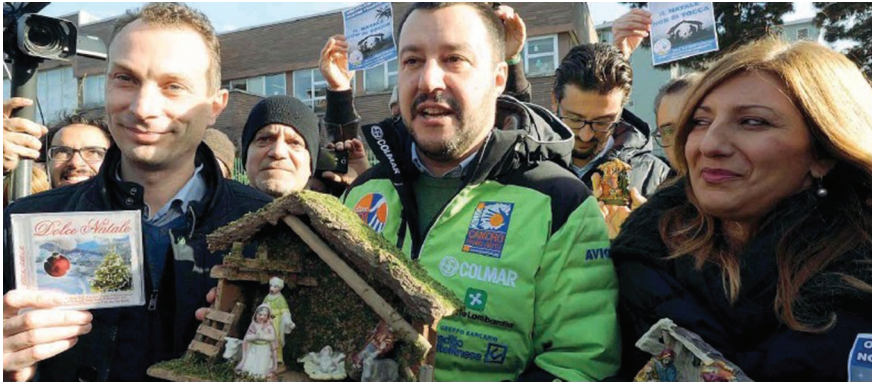
FIGURE 8.1 Matteo Salvini (Lega Nord) in Rozzano