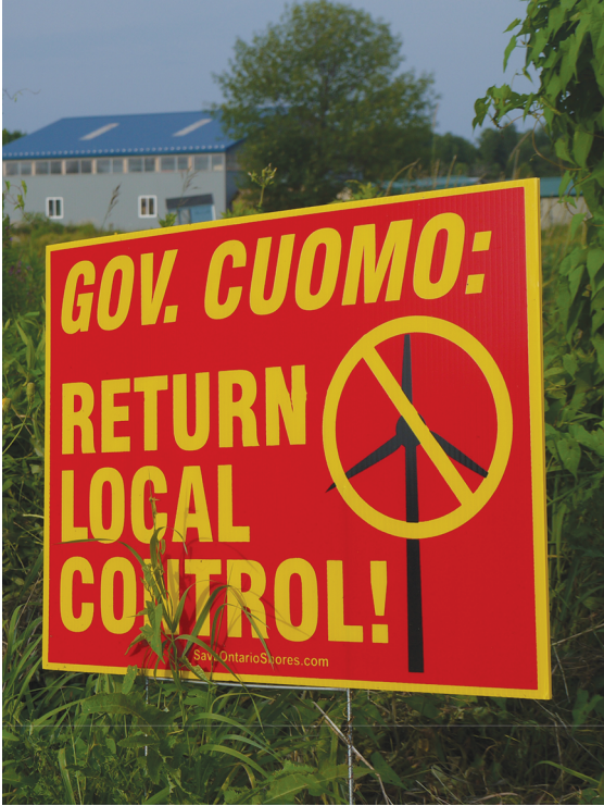
FIGURE 7.1 Local SOS protest sign, with a farm in the background in Orleans County, New York

communities in Ontario, where the state controlled decision-making, opposed wind energy projects; while in contrast, communities in Quebec were entirely unconcerned and in fact highly supportive of community-based wind energy projects where the community led the projects. 8 Therefore, whether wind energy decision-making is governed by local municipalities or state-level authorities can hugely impact project outcomes and social acceptability.