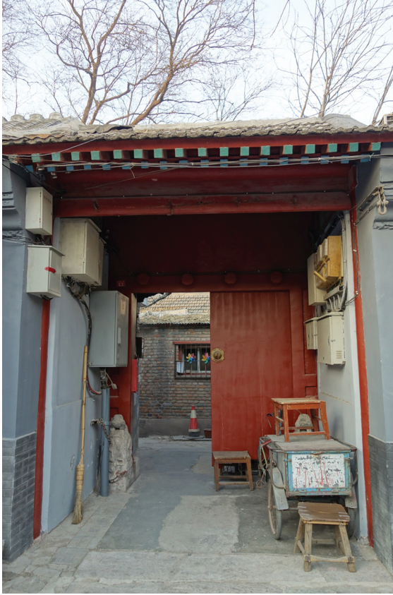
FIGURE 3.3 Entrance to a traditional Beijing courtyard (Hutong) in which a Swiss interview partner lives

PHOTO TAKEN BY ALDINA CAMENISCH IN JANUARY 2015