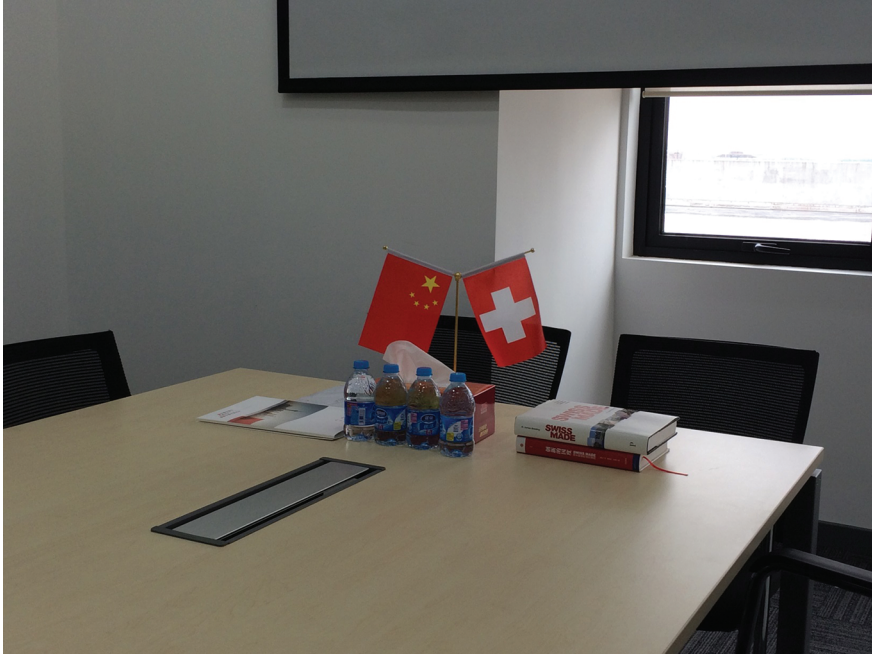
FIGURE 3.1 Meeting room at a Sino-Swiss business consultancy in Shanghai

PHOTO TAKEN BY ALDINA CAMENISCH IN FEBRUARY 2015