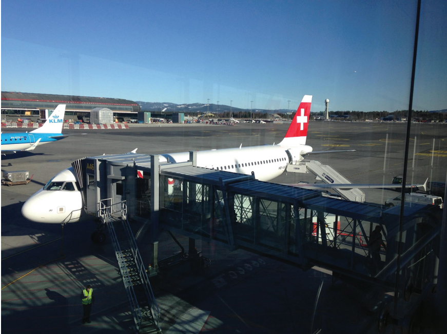
FIGURE 3.2 Departing flight from Oslo heading to Zurich

Some of the interview partners also took a critical stance towards their Swiss environment, seeing it as an overregulated, uneventful place with a rather narrow-minded and complacent society. Hence, they felt that they would be happier elsewhere where they could lead a less predetermined, and more challenging life.