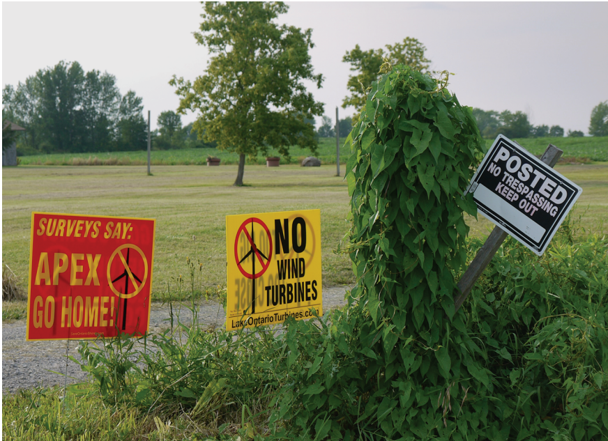
FIGURE 7.2 SOS protest signs by the roadside on private property in Orleans County, New York

Apex is a much more significant driving force of opposition. In support of this, another comment states the following: ‘Any monetary payment receive (sic) would be like selling our souls to the devil!’ 16 This suggests that even if there were benefits to the community, the fact that the corporations are outsiders with non-local interests is what drives opposition. Figure 7.2. shows again local SOS protest signs, specifically the sign on the left of the image reads: “Surveys say: Apex go home!”, illustrating a direct message to the Apex corporation referencing that it is not a local organization, rather its “home” is based elsewhere, in this case Virginia.