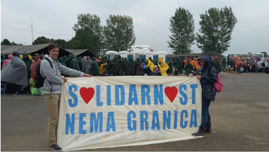
FIGURE 5.3 Solidarity has no borders . Volunteers of the Welcome Initiative supporting refugees at the temporary refugee centre in small Croatian town Opatovac on Croatian – Serbian border, autumn 2015.