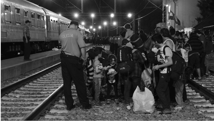
FIGURE 5.1 Departure to a better future? Croatian Police supervise arrival of the refugees in Croatia at the railway station Tovarnik at Croatian–Serbian border in order to control their further transit to Slovenia, late summer 2015.