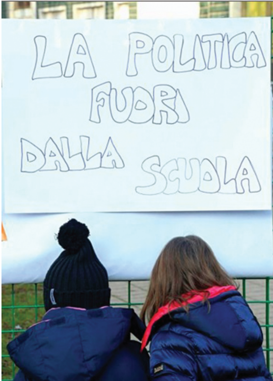
FIGURE 8.3 School children facing a billboard spelling 'politics out of schools'