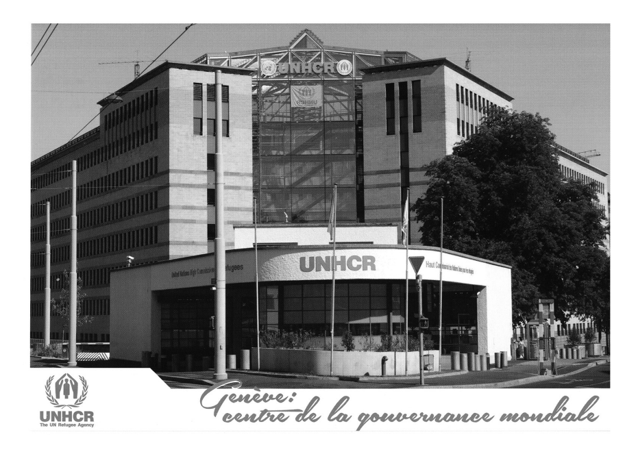
Figure 0.3 UNHCR headquarters in Geneva.

chapters start with the production of a key figure produced by humanitarian agencies, the estimation of a number of "people in need." Chapter 5 looks at the emergence of a knowledge of crisis in Cameroon, and the registration of refugees by UNHCR. Chapter 6 looks at the construction of the number of malnourished children by UNICEF, and at the mapping of "vulnerability" in Cameroon. Both chapters analyze needs assessment as a tool to pacify the competition between humanitarian agencies. Technology, it is argued, does not play the role that one expects: Even when digital technologies are included in the process, needs assessment still relies heavily on low tech. Moreover, high tech does not necessarely means higher transparency.