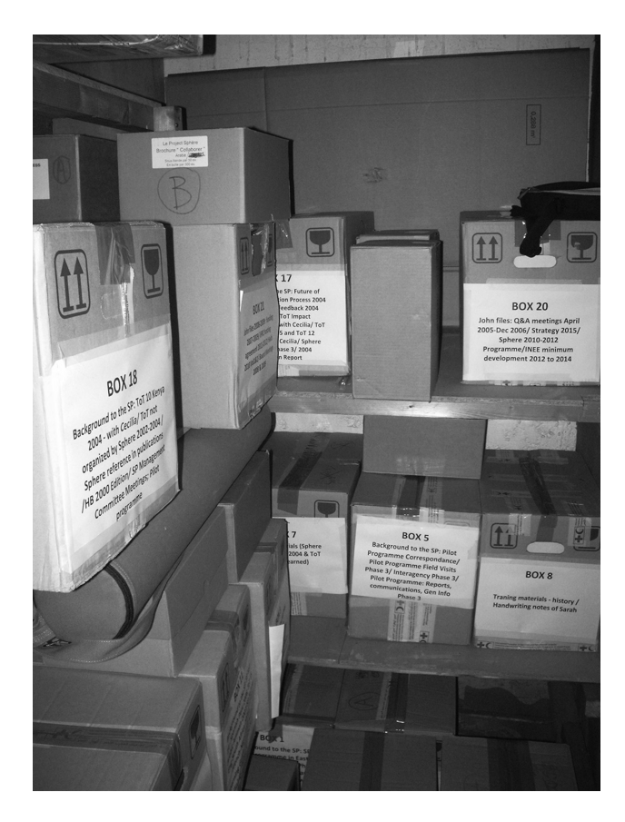
Figure 0.2 Sphere Archive in Geneva.

The fourth chapter investigates the standardization of good humanitarian practice by large aid agencies since the 1980s. While some refined their own "humanitarian principles," others produced handbooks in which they listed the dos and don'ts of their profession. UNHCR, UNICEF, Oxfam, CARE, and MSF produced such handbooks, but none have been more controversial and more influential than the aforementioned Sphere Handbook. The Sphere Project attempted to produce a handbook of all handbooks, a definition of survival needs oriented toward an ISO-norms-like understanding of aid work.