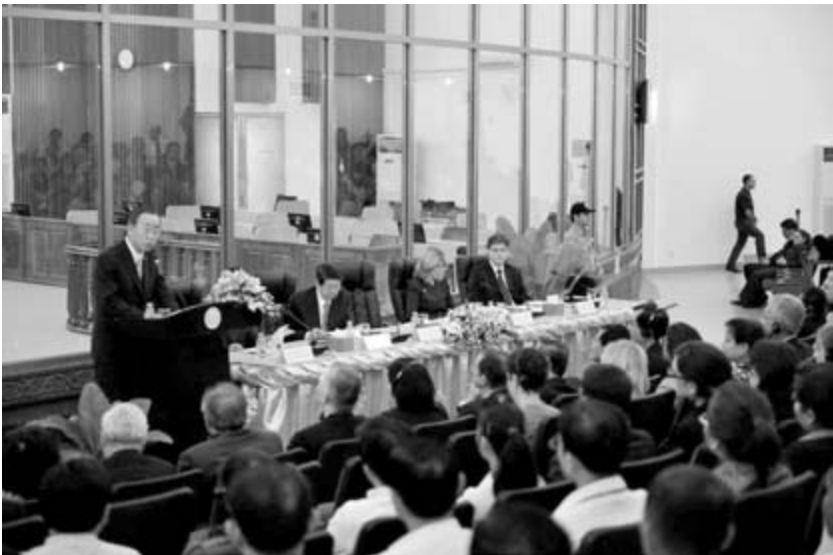
UN Secretary-General Ban Ki-moon ( left ) addresses the ECCC judges and staff in the courtroom gallery during an October 2010 visit to the tribunal.