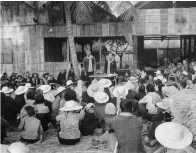
One of many village meetings organized throughout Cambodia in 1982–83 by the People's Republic of Kampuchea to shed light on the crimes of the Pol Pot regime.