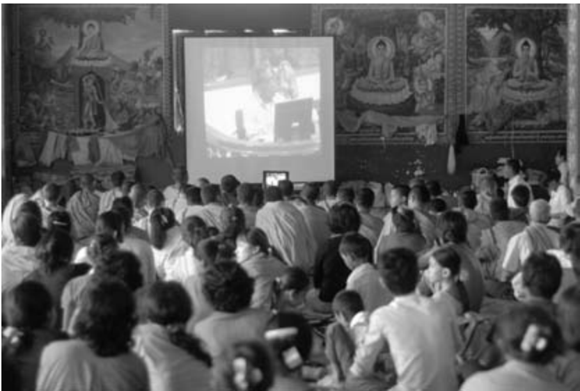
Villagers watching Duch's trial on screen at an outreach event in a pagoda at the former Khmer Rouge stronghold of Pailin in northwestern Cambodia.