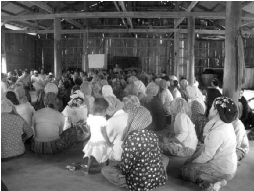
An outreach event on Khmer Rouge history and the ECCC in a Cham Muslim community, led by the Documentation Center of Cambodia.