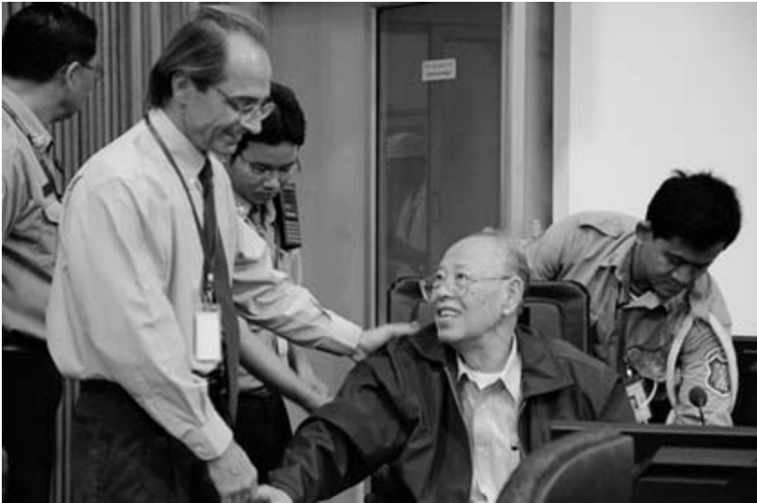
Ieng Sary toasting the Chinese ambassador as foreign minister of Democratic Kampuchea ( top ) and greeting his international defense lawyer Michael Karnavas in the ECCC courtroom on November 23, 2011.