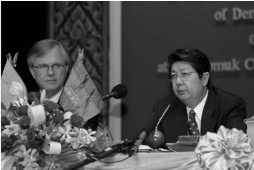
UN Legal Counsel Hans Corell and Cambodian Deputy Prime Minister Sok An return to the Chaktomuk Theatre for the signing ceremony of the ECCC's Framework Agreement, June 6, 2003.