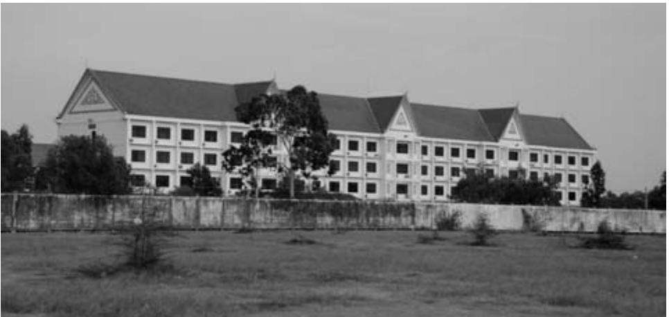
The ECCC complex, including the courtroom ( top ) and administration building ( bottom ) on the site of a former military base on the western outskirts of Phnom Penh.