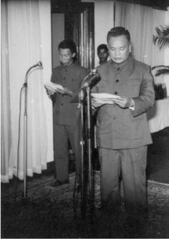
Nuon Chea, former Deputy Chairman of the Communist Party of Kampuchea, addressing Chinese visitors to Democratic Kampuchea ( top ) and addressing the ECCC Trial Chamber on December 14, 2011 ( bottom ).