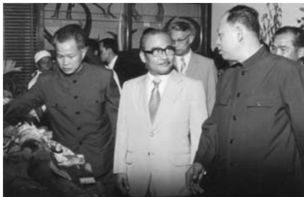
Khieu Samphan ( left ) and Ieng Sary ( right ) with Lao Prince Souphanouvong ( center ) during his visit to Democratic Kampuchea.