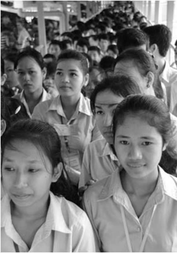
Public visitors to the ECCC on the third day of Case 002 opening statements, November 23, 2011.