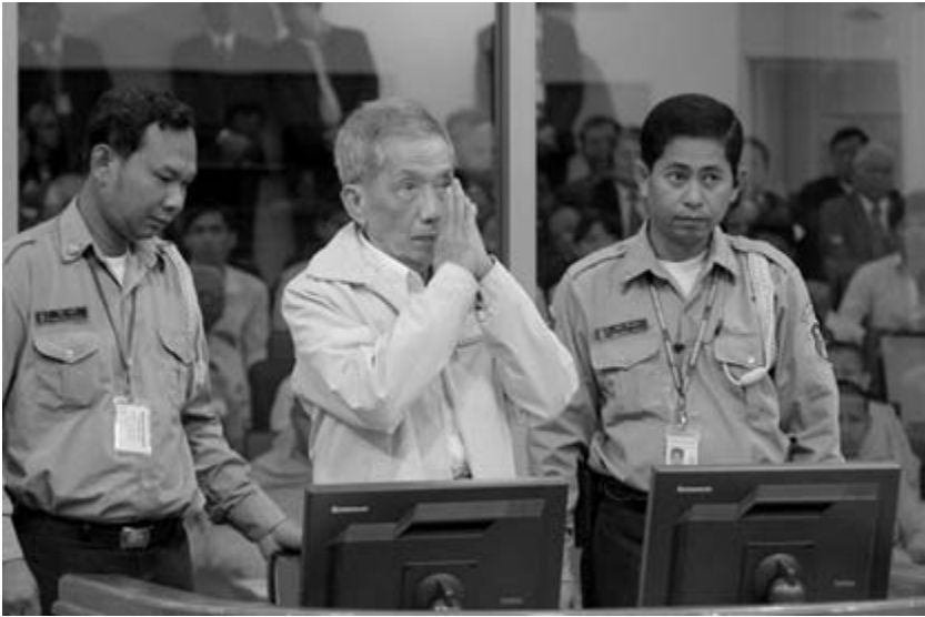
Duch on the day of the appeal judgment.