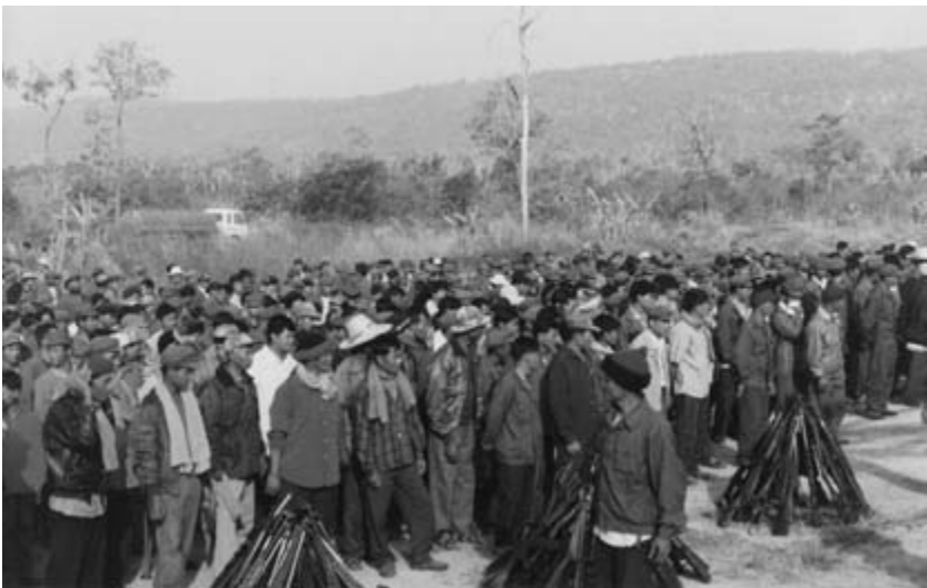
Khmer Rouge soldiers in the mountainous northwestern province of Anlong Veng turning over their weapons to defect to the government with Ieng Sary in 1996.