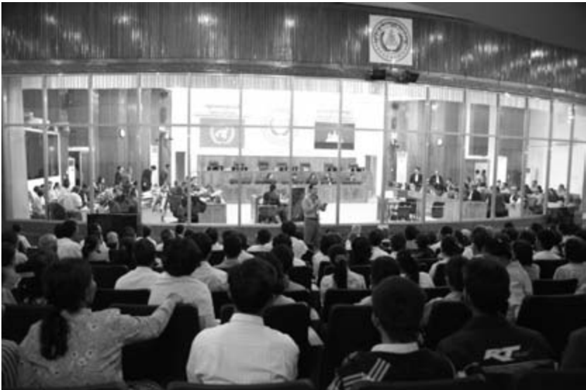
Visitors being briefed in the public courtroom gallery before a Case 002 trial hearing as prosecutors and civil parties ( left ) and defense teams ( right ) take their seats.