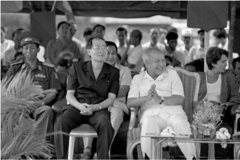
Head of the UN Transitional Authority in Cambodia Yasushi Akashi ( left ) and King Norodom Sihanouk ( right ) during the UN's interregnum in Cambodia in 1992–93.