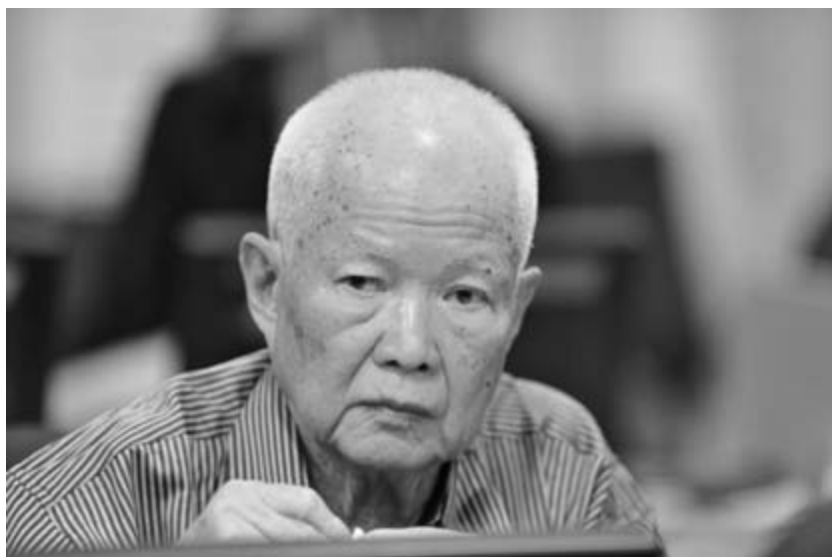
Khieu Samphan during the proceedings against him at the ECCC.