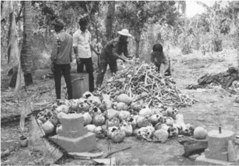
Workers unearthing remains at a mass grave at Tram Kak district, Takeo province, circa 1979.