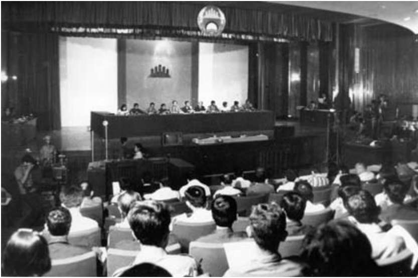
The People's Revolutionary Tribunal, which issued history's first genocide convictions against Pol Pot and Ieng Sary in absentia, held in the Chaktomuk Theatre, Phnom Penh, July–August 1979.